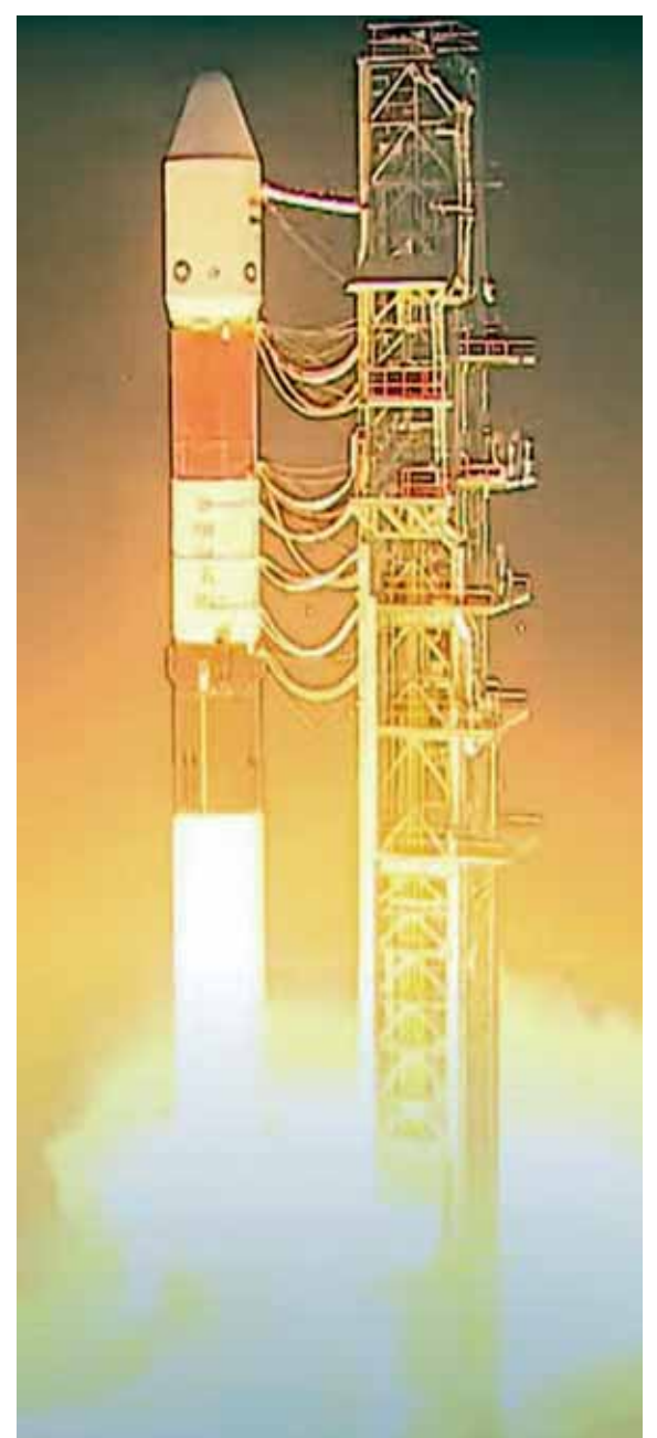
ISRO's PSLV-C60 carrying SpaDeX and its payloads, lifts off from the first launch pad at Satish Dhawan Space Centre, in Sriharikota