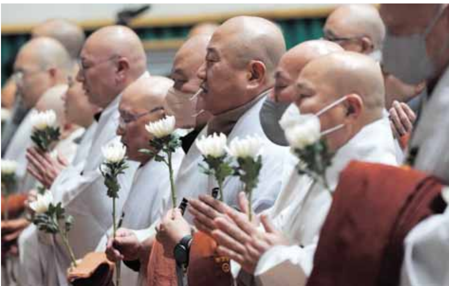
Buddhist monks (above) pray for the victims on a plane which skidded off a runway and burst into flames (left), at a memorial altar at Muan sport park in Muan, South Korea, on Monday.