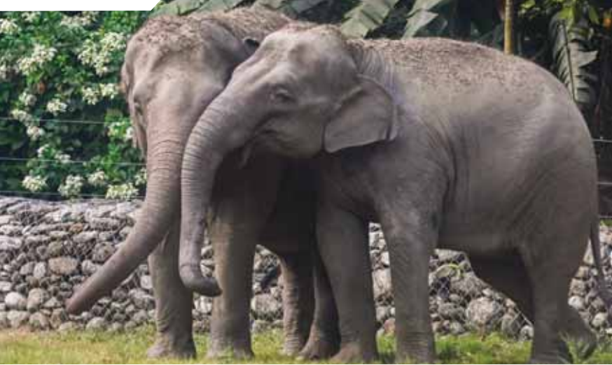
Elephants inside an enclosure at Alipore Zoological Garden in Kolkata