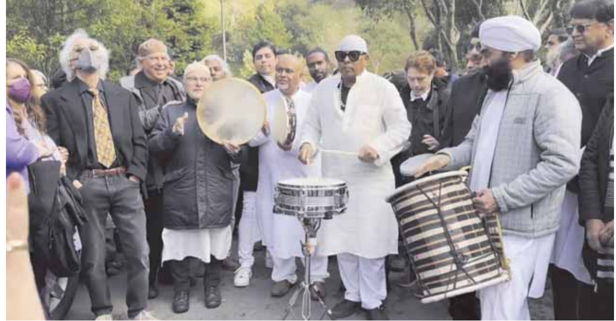
Percussionist A Sivamani performs during the funeral of Tabla maestro Zakir Hussain at Fernwood Cemetery in San Francisco, US, on Thursday.

in on social media as the news of Hussain's demise spread. Prime Minister Narendra Modi called him a true genius who revolutionised the world of Indian classical music. Grammy winner musician Ricky Kej remembered Hussain for his "immense humility, approachable nature". "One of the greatest musicians and personalities India has ever produced. Along with being the best himself, Zakirji was known for...being responsible for the careers of numerous musicians, who are now forces to reckon with themselves. He was a treasure trove of skill and knowledge and always shared and encouraged the entire music community through collaborations and his actions. His legacy will live on forever, and his influence will be felt for generations. He left us too soon," Kej had written on X after his demise.