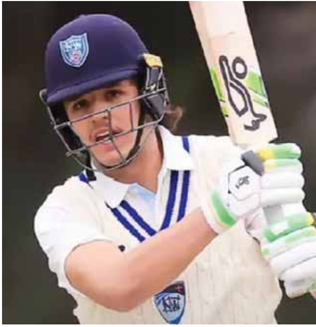
forward to watching his game develop further," Australian Chair of Selectors George Bailey said. "We remain confident Nathan has the ability and

Konstas' inclusion follows a series of disappointing performances from the Australian top order in the first three Tests especially McSweeney. The 25-year-old, who made his Test debut in the series-opener in Perth, failed to score a single half century and could only manage scores of 10, 0, 39, 10 not out, 9 and 4 in his six innings and was dismissed by Indian pace Jasprit Bumrah spearhead four times. Konstas had been in the reckoning to partner experienced Usman Khawaja after grabbing the attention of Cricket Australia's selection committee following his twin Sheffield Shield centuries for New South Wales. He had scored an unbeaten 73 at the MCG against India A while notching up a ton (107) in the Prime Ministers XI pink ball game against India in Canberra. "Sam gets a call up to the Test squad for the first time. His style of batting offers a point of difference and we look