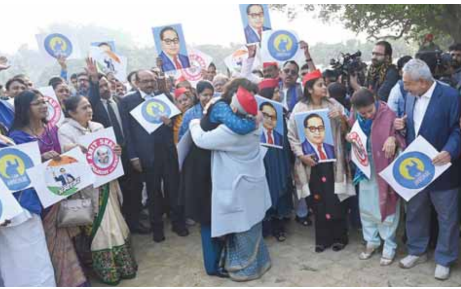
Congress MP Priyanka Gandhi Vadra greets Samajwadi Party MP Jaya Bachchan during INDIA bloc MPs' protest against Home Minister Amit Shah over his remarks related to Dr BR Ambedkar, at Vijay Chowk

President Murmu said the news of the loss of lives in the Jaipur gas tanker accident was very painful and offered her condolences to the families of the deceased. "The news of the death of many people due to a road accident in Jaipur is very painful. I pray to God for peace to the departed souls. My deepest condolences to their families! I pray that the injured get well soon," she said in a social media post in Hindi. Expressing grief over the loss of lives, Prime Minister Modi spoke to the Chief Minister to enquire about the incident and assured him of all possible support.