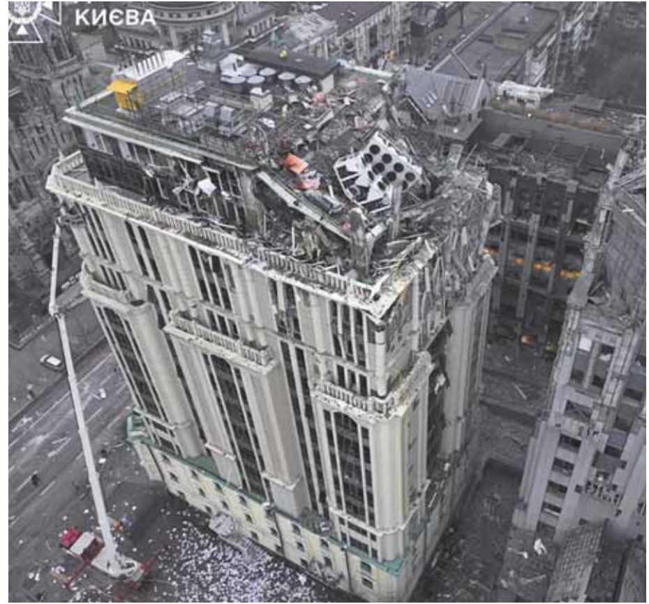
In this photo provided by the Ukrainian Emergency Service, firefighters work on the site of a damaged building after a Russian missile attack in Kyiv, Ukraine on Friday. AP/PTI

A Russian ballistic missile attack on Ukraine's capital Kyiv early Friday killed at least one person and injured nine others, officials said. Moscow claimed it was in response to a Ukrainian strike on Russian soil using American-made weapons. At least three loud blasts were heard in Kyiv shortly before sunrise. Ukraine's air force said it intercepted five Iskander short-range ballistic missiles fired at the city. The attack knocked out heating to 630 residential buildings, 16 medical facilities, and 30 schools and kindergartens, the city administration said, and falling missile debris caused damage and sparked fires in three districts. "We ask citizens to immediately respond to reports of ballistic attack threats, because there is very little time to find shelter," the air force said. During the almost three years since the war began, Russia has regularly bombarded civilian areas of Ukraine, often in an attempt to cripple the power grid and unnerve Ukrainians. Meanwhile Ukraine, struggling to hold back Russia's bigger army on the front line, has attempted to strike Russian infrastructure supporting the country's war effort. The Russian Ministry of Defence said the strike was in response to a Ukrainian missile attack on Russia's Rostov border region two days earlier. That attack used six American-made Army Tactical Missile System, known as ATACMS, missiles and four Storm Shadow air-launched missiles provided by the United Kingdom, it said. That day, Ukraine claimed to