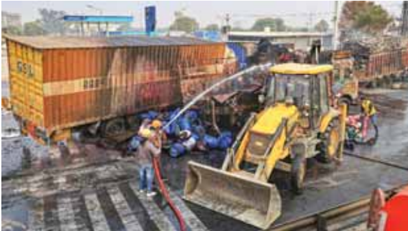
Firefighters at the site of the accident after a truck loaded with a chemical collided with some other vehicles and caught fire on the Jaipur-Ajmer Highway.

At least 11 people were killed and about 35 injured after an LPG tanker collided with a truck on Friday here sparking a massive fireball. It turned a stretch of the Jaipur-Ajmer highway into an inferno and nearly 40 vehicles were gutted. President Droupadi Murmu, Prime Minister Narendra Modi, Home Minister Amit Shah, Rajasthan Governor Haribhau Bagade, Chief Minister Bhajanlal Sharma and his predecessor Ashok Gehlot expressed grief over the loss of lives in the crash.