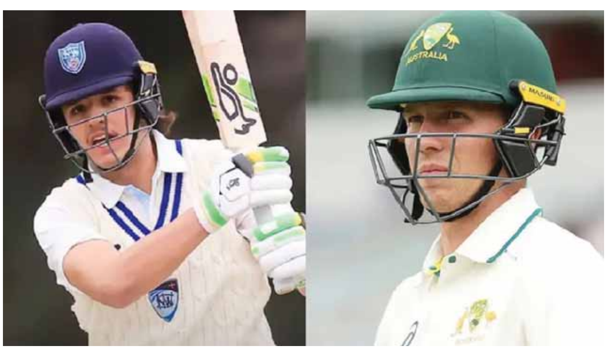
forward to watching his game develop further," Australian Chair of Selectors George Bailey said. "We remain confident Nathan has the ability and temperament to succeed at Test level in the future. It was a difficult decision to leave him out. "It has clearly been a challenge at the top of the order for batters throughout the series and we want to provide the option of a different line up for the next two matches," he added.