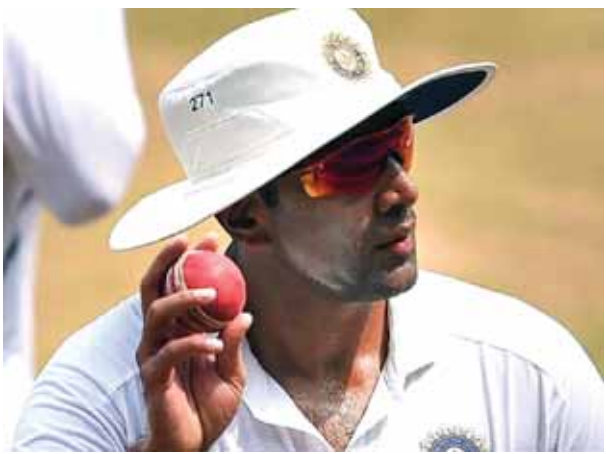
Ashwin consistently worked on new deliveries and refined his action, even in the later stages of his career. "He wanted new tricks to be learned. He pursued it, practiced hard at it and continued to look for new things as his career progressed, to keep up with the times," Shastri said. "His legacy will be of being a terrific match-winner, a fabulous record, 537 sticks. I mean anyone over 500 (in Test cricket) is special." Ashwin, who made his debut in 2011 against the West Indies, quickly cemented his place in India's Test side. He retired as India's second-highest wicket-taker with 765 scalps, including 537 in Tests. Ashwin and fellow spinner Ravindra Jadeja often bowled in tandem, leading India to numerous victories. Shastri felt the "spin twins" played a role in each other's success.

PTI ■ MELBOURNE Ravichandran Ashwin's constant drive to evolve and excel in his craft, coupled with his focus on self-improvement rather than being concerned about the opponents made him stand out, says former India coach Ravi Shastri. The 38-year-old surprised the cricketing world by announcing his retirement in the middle of the Test series against Australia after the end of the third Test in Brisbane on Wednesday. "What stands out for me was his wanting to evolve all the time. He wasn't the kind of guy satisfied as to where he started," Shastri said on 'The ICC Review'. "For me it was his guile, wanting to excel in his craft and (especially) in the last two-three years the way he got the ball to the way, gave it a rip and got it to dip on the batsman with drift made him stand out," Shastri said. Known for his relentless drive to develop his game,