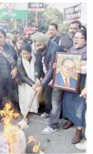
Ambedkar issue nor will get bogged down by the FIR on the Congress leader.

in the country by the derogatory comment on B R Ambedkar made by the Union Home minister Amit Shah in parliament. He said that there is proof of the allegations made by the BJP on Rahul Gandhi and no CCTV footage of the incident is being shown. The Congress leader said that the entire episode is a shameful attempt by the BJP to save Shah. He said that the Congress will neither allow the Home minister to avoid responsibility for the derogatory comment on the