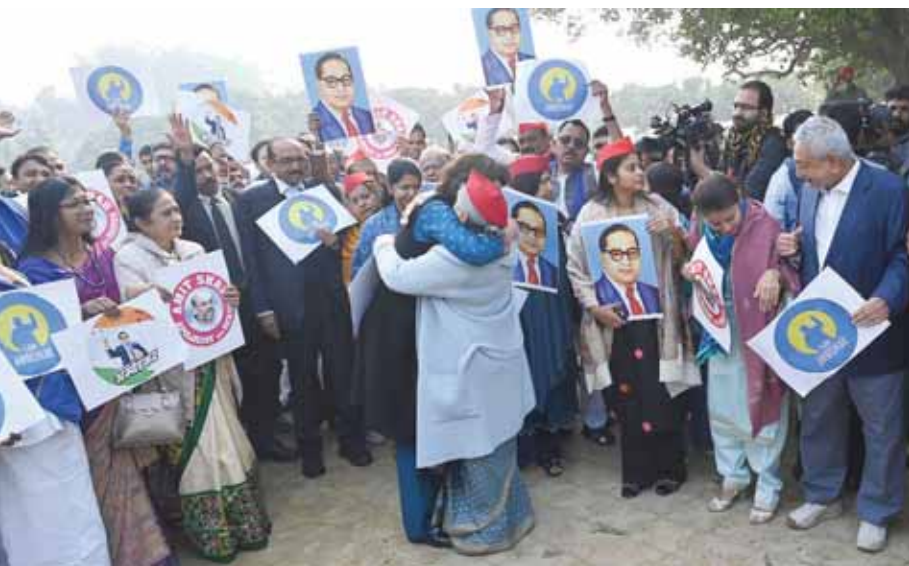
Congress MP Priyanka Gandhi Vadra greets Samajwadi Party MP Jaya Bachchan during INDIA bloc MPs' protest against Home Minister Amit Shah over his remarks related to Dr BR Ambedkar, at Vijay Chowk.

PUBLISHED FROM: DELHI | LUCKNOW | BHOPAL | BHUBANESWAR | RANCHI | RAIPUR | CHANDIGARH | DEHRADUN | HYDERABAD | VIJAYWADA