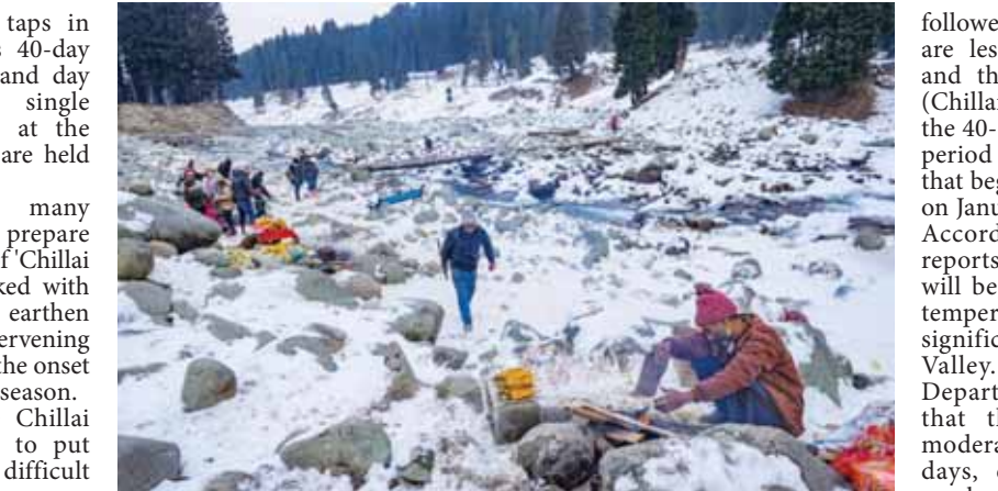
Kashmir's mountains covered in snow for weeks, and the famous Dal Lake also reaching freezing point until the end of January. Kashmir's winter pans out in three stages starting with a 40-day intense period from December 21 (locally called Chillai Kalan)

bodies and even water taps in homes to freeze. In this 40-day period, nights are chilly and day temperatures are in single digits. The winter games at the skiing resort of Gulmarg are held during this period. During Chillai Kalan, many Kashmiri families prepare 'Shabdeg' on the first day of 'Chillai Kalan'. Meat is slow cooked with turnips and spices in an earthen vessel during the night intervening December 20-21, to mark the onset of the coldest phase of the season. During its 40 days, the Chillai Kalan leaves no chance to put people through the most difficult of hardships. Generally, however, due to the icy winds in Chillai Kalan, the entire valley is gripped by severe cold. The ongoing cold wave is said to reach its peak with