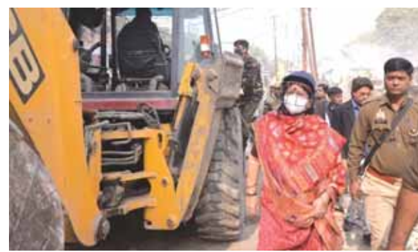
Mayor Pramila Pandey inspecting the demolition of illegal construction around Sisamau nullah on Friday.

In view of the tragic killing of a minor girl after falling into Sisamau nullah a few days ago, Mayor Pramila Pandey on Friday reached the spot with the Nagar Nigam team and six backhoe loaders. She directed to demolish the illegal construction carried out around the nullah which damaged the slab and led to death of the minor girl. The residents made a futile attempt to lodge the protest against the move but were soon pacified due to presence of police force.