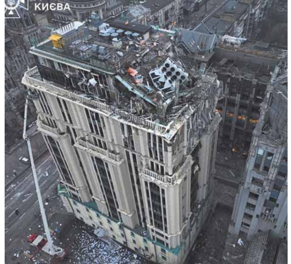
In this photo provided by the Ukrainian Emergency Service, firefighters work on the site of a damaged building after a Russian missile attack in Kyiv, Ukraine on Friday.

A Russian ballistic missile attack on Ukraine's capital Kyiv early Friday killed at least one person and injured nine others, officials said. Moscow claimed it was in response to a Ukrainian strike on Russian soil using American-made weapons. At least three loud blasts were heard in Kyiv shortly before sunrise. Ukraine's air force said it intercepted five Iskander short-range ballistic missiles fired at the city. The attack knocked out heating to 630 residential buildings, 16 medical facilities, and 30 schools and kindergartens, the city administration said, and falling missile debris caused damage and sparked fires in three districts. "We ask citizens to immediately respond to reports of ballistic attack threats, because there is very little time to find shelter," the air force said. During the almost three years since the war began, Russia has regularly bombarded civilian areas of Ukraine, often in an attempt to cripple the power grid and unnerve Ukrainians. Meanwhile Ukraine, struggling to hold back Russia's bigger army on the front line, has attempted to strike Russian infrastructure supporting the country's war effort. The Russian Ministry of Defence said the strike was in response to a Ukrainian missile attack on Russia's Rostov border region two days earlier. That attack used six American-made Army Tactical Missile System, known as ATACMS, missiles and four Storm Shadow air-launched missiles provided by the United Kingdom, it said. That day, Ukraine claimed to