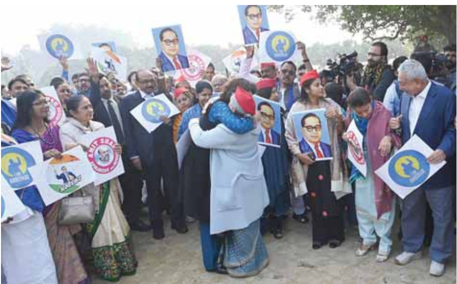
Congress MP Priyanka Gandhi Vadra greets Samajwadi Party MP Jaya Bachchan during INDIA bloc MPs' protest against Home Minister Amit Shah over his remarks related to Dr BR Ambedkar, at Vijay Chowk

PUBLISHED FROM: DELHI | LUCKNOW | BHOPAL | BHUBANESWAR | RANCHI | RAIPUR | CHANDIGARH | DEHRADUN | HYDERABAD | VIJAYWADA