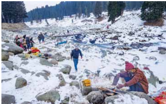
Kashmir's mountains covered in snow for weeks, and the famous Dal Lake also reaching freezing point until the end of January. Kashmir's winter pans out in three stages starting with a 40-day intense period from December 21 (locally called Chillai Kalan)

bodies and even water taps in homes to freeze. In this 40-day period, nights are chilly and day temperatures are in single digits. The winter games at the skiing resort of Gulmarg are held during this period. During Chillai Kalan, many Kashmiri families prepare 'Shabdeg' on the first day of 'Chillai Kalan'. Meat is slow cooked with turnips and spices in an earthen vessel during the night intervening December 20-21, to mark the onset of the coldest phase of the season. During its 40 days, the Chillai Kalan leaves no chance to put people through the most difficult of hardships. Generally, however, due to the icy winds in Chillai Kalan, the entire valley is gripped by severe cold. The ongoing cold wave is said to reach its peak with