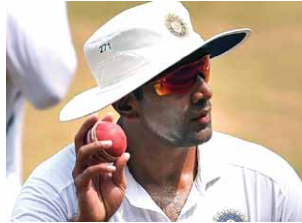
Ashwin consistently worked on new deliveries and refined his action, even in the later stages of his career. "He wanted new tricks to be learned. He pursued it, practiced hard at it and continued to look for new things as his career progressed, to keep up with the times," Shastri said. "His legacy will be of being a terrific match-winner, a fabulous record, 537 sticks. I mean anyone over 500 (in

Ravichandran Ashwin's constant drive to evolve and excel in his craft, coupled with his focus on self-improvement rather than being concerned about the opponents made him stand out, says former India coach Ravi Shastri. The 38-year-old surprised the cricketing world by announcing his retirement in the middle of the Test series against Australia after the end of the third Test in Brisbane on Wednesday. "What stands out for me was his wanting to evolve all the time. He wasn't the kind of guy satisfied as to where he started," Shastri said on 'The ICC Review'. "For me it was his guile, wanting to excel in his craft and (especially) in the last two-three years the way he got the ball to the way, gave it a rip and got it to dip on the batsman with drift made him stand out," Shastri said. Known for his relentless drive to develop his game,