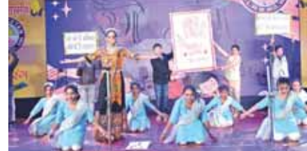
Children of Bal Niketan presenting cultural programme on their Annual Day at BLW in Varanasi on Friday.