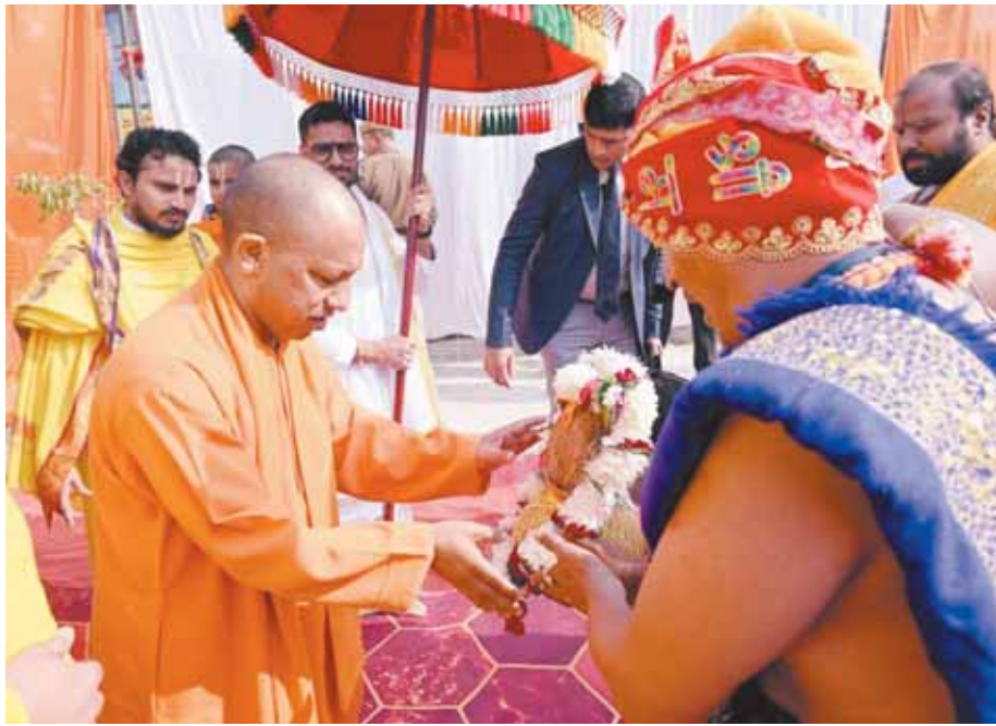
Chief Minister Yogi Adityanath takes part in the grand Ashtottarshat 108 Shrimad Bhagwat Paath and Panch Narayan Mahayagya held at Asharfi Bhawan Ashram in Shri Ayodhya Dham on Friday

Calling Sanatan Dharma the national religion of India, Uttar Pradesh Chief Minister Yogi Adityanath said on Friday that it is the collective responsibility of the citizens to protect it. Reflecting on the historical attacks on sacred temples by invaders, he said that the clans of those who desecrated these holy sites vanished into oblivion. The chief minister made these remarks while participating in the grand Ashtottarshat 108 Shrimad Bhagwat Paath and Panch Narayan Mahayagya held at Asharfi Bhawan Ashram in Shri Ayodhya Dham.