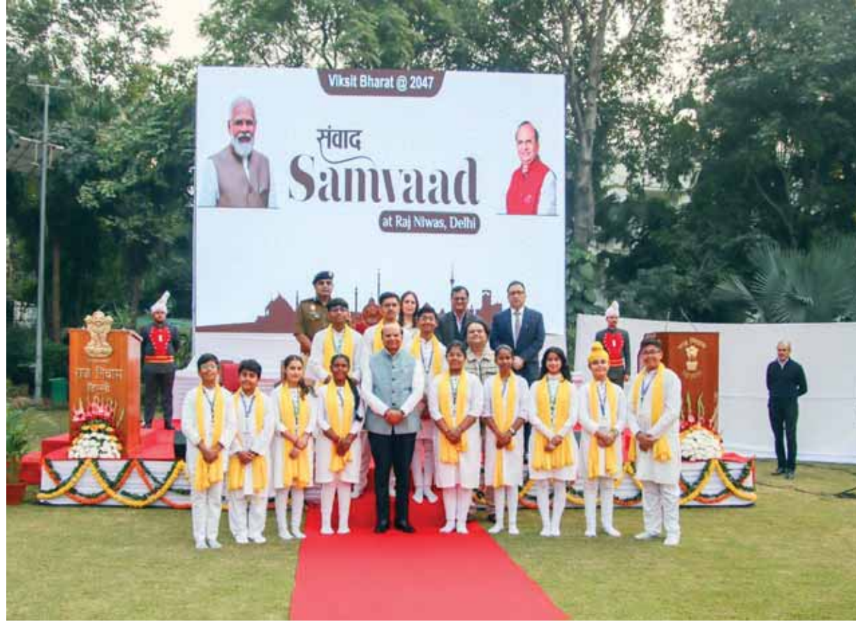
STAFF REPORTER ■ NEW DELHI

The Delhi Lieutenant Governor Vinai Kumar Saxena on Friday interacted with scores of principals and teachers of more than 5,000 private schools in the national Capital, discussing issues like bomb threats, National Education Policy (NEP) 2020 and mental health of students among others.