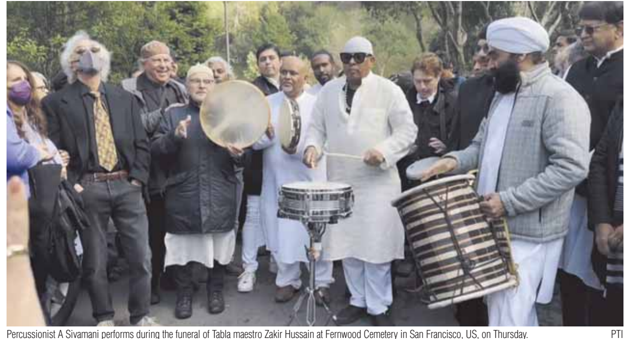
Percussionist A Sivamani performs during the funeral of Tabla maestro Zakir Hussain at Fernwood Cemetery in San Francisco, US, on Thursday.

in on social media as the news of Hussain's demise spread. Prime Minister Narendra Modi called him a true genius who revolutionised the world of Indian classical music. Grammy winner musician Ricky Kej remembered Hussain for his "immense humility, approachable nature". "One of the greatest musicians and personalities India has ever produced. Along with being the best himself, Zakirji was known for...being responsible for the careers of numerous musicians, who are now forces to reckon with themselves. He was a treasure trove of skill and knowledge and always shared and encouraged the entire music community through collaborations and his actions. His legacy will live on forever, and his influence will be felt for generations. He left us too soon," Kej had written on X after his demise.