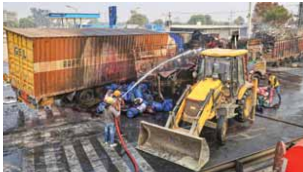
Firefighters at the site of the accident after a truck loaded with a chemical collided with some other vehicles and caught fire on the Jaipur-Ajmer Highway

At least 11 people were killed and about 35 injured after an LPG tanker collided with a truck on Friday here sparking a massive fireball. It turned a stretch of the Jaipur-Ajmer highway into an inferno and nearly 40 vehicles were gutted. President Droupadi Murmu, Prime Minister Narendra Modi, Home Minister Amit Shah, Rajasthan Governor Haribhau Bagade, Chief Minister Bhajanlal Sharma and his predecessor Ashok Gehlot expressed grief over the loss of lives in the crash.