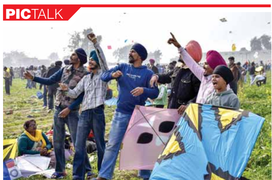
People fly kites at the annual Basant Panchmi festival in Amritsar

enhanced safety features. By promoting indigenously developed SMRs, India aims to increase its self-reliance in nuclear technology and reduce dependency on foreign nations. The allocation of Rs 20,000 crore under the Nuclear Energy Mission signals a clear intent to boost nuclear power generation. This funding will support research and development in indigenous nuclear technologies, particularly SMRs. Infrastructure development will be a key focus, with plans to set up at least five SMRs by 2033 as part of a long-term nuclear expansion plan. Despite its benefits, nuclear energy in India faces several challenges. Regulatory barriers exist due to the Atomic Energy Act and the Civil Liability for Nuclear Damage Act, which currently limit private sector involvement and require amendments. Public concerns on safety remain a significant issue, as nuclear accidents worldwide have created scepticism, necessitating stringent safety protocols. Technological monopolies present another challenge, as nuclear technology is concentrated among a few global players, making domestic capacity-building initiatives essential. But a push for nuclear energy is the need of the hours. It will reduce country's carbon footprint, enhance energy security, and meet its growing electricity demands sustainably.