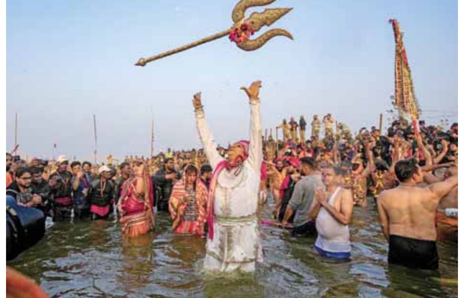
A Kinnar Akhara member tosses a trident while taking a holy dip on the 'Basant Panchami' during the ongoing Mahakumbh Mela, at the Sangam in Prayagraj