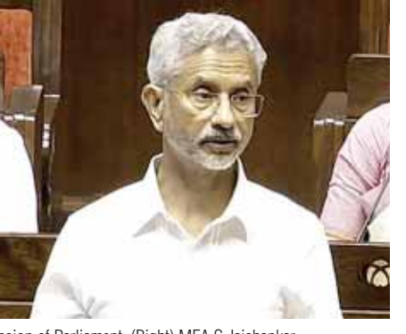
(Right) MEA S Jaishankar

not have had to send Foreign Minister S Jaishankar to the US to get an invitation for Prime Minister Narendra Modi for Donald Trump's swearing-in ceremony. "When we talk to the United States, we would not send the Foreign Minister three-four times to get an invite for our Prime Minister because if we had a production system and we were working on these technologies, the US President would come here and invite the Prime Minister," said Rahul. Rijju said the LoP cannot make such serious, unsubstantiated statements. "This is about the relationship between two countries. He is making unverified statements about the invitation of our Prime Minister. He should be responsible. If the Leader of the Opposition has the information, he must tell the House who has told him that the Foreign Minister visited for this purpose," Rijju said. Replying to him, Rahul Gandhi said he would apologise for disturbing the Parliamentary Affairs Minister peace of mind but the Congress leader continued with another his jab raking up the China issue and said that the Indian Army contradicted Prime Minister Narendra Modi's claims about Chinese army intrusion in Ladakh.