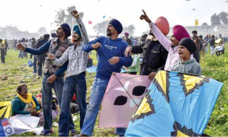
People fly kites at the annual Basant Panchmi festival in Amritsar