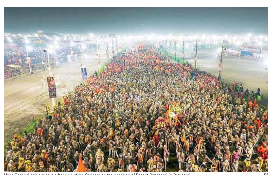
Naga Sadhus arrive to take a holy dip at the Sangam on the occasion of Basant Panchami in Prayagraj.