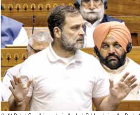
(Left) Rahul Gandhi speaks in the Lok Sabha during the Budget session of Parliament. (Right) MEA S Jaishankar

Leader of Opposition in Lok Sabha Rahul Gandhi on Monday created a flutter by raking up the issue of Prime Minister Narendra Modi 'not being invited for coronation of US President Donald Trump last month to which the External Affairs Minister S Jaishankar dismissed the claim as false and accused the Congress of harming India's global image. Jaishankar asserted that no discussion about an invitation to Prime Minister Modi ever took place and pointed out that the Prime Minister does not attend such events. Union Minister for Parliamentary Affairs Kiren Rijju too strongly objected to the remarks. "It is common knowledge that our PM does not attend such events. In fact, India is generally represented by Special Envoys," he clarified. Jaishankar represented India at Donald Trump's inauguration on January 20. He was seated in the first row during the ceremony. Mocking the Central government during Motion of Thanks on the President's address in Lok Sabh, Rahul claimed that if the Modi government had taken economic policies seriously, then the government would