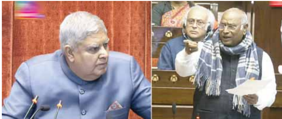
Delhi Vice President and Rajya Sabha Chairman Jagdeep Dhankhar conducts proceedings of the House as LoP Mallikarjun Kharge speaks during the Budget session of Parliament, in New Delhi

The Rajya Sabha on Monday witnessed uproar from the treasury benches after Leader of Opposition (LoP) and Congress president Mallikarjun Kharge paid tribute to 'thousands' who died in stampede in Maha Kumbh on January 29. Chairman Jagdeep Dhankhar asked him to authenticate or retract the statement. Opposition MPs in the Lok Sabha also voiced strong concerns over the Kumbh Mela stampede, accusing the Government of negligence and insensitivity and calling for accountability. Kharge was quick to add that "this is my estimate (and) if this is not right you (the Government) should tell what is the truth". He said he was ready to be corrected. "I did not say 'thousands' to blame anyone. But how many people died, give that information at least. I will apologise if I am wrong. They should give figures how many died, how many are missing," he said. However, while participating in a debate on the Motion of Thanks to the President's address in Rajya Sabha, Kharge used the phrase "the thousands who died in Kumbh" to pay tributes to the deceased. "I pay my tributes to the people who died in Maha Kumbh... The thousands who died in