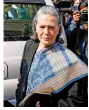
wrote to Rajya Sabha chairman. The MPs alleged that the statement was a "clear manifestation of elitist and

Bharatiya Janata Party (BJP) MPs on Monday moved a privilege motion against Rajya Sabha MP Sonia Gandhi over her "poor thing" remark on President Droupadi Murmu. "We write this with great dismay about certain unparliamentary, derogatory and demeaning remarks recently made by Smt. Sonia Gandhi, Member of Parliament, Rajya Sabha, against the Hon'ble President of India, which warrant serious consideration and disciplinary action," the MPs