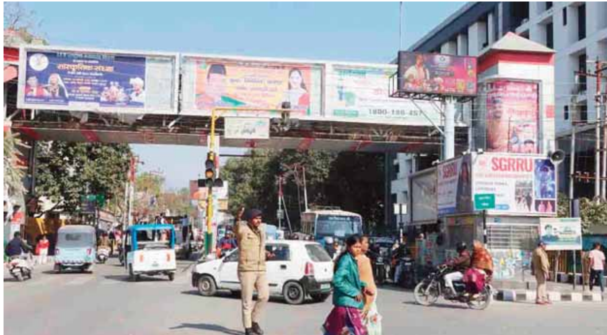
The pedestrian overbridge at Tehsil Chowk in Dehradun, inaugurated in 2015 remains locked after considerable expenses as pedestrians walk across the road and the structure remains a base for advertisements