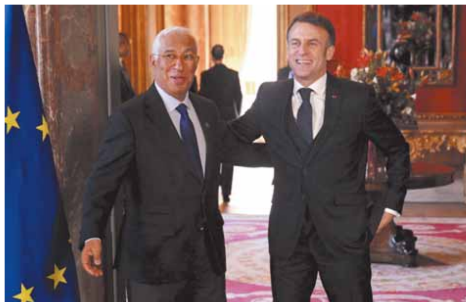
European Council President Antonio Costa, left, greets French President Emmanuel Macron as he arrives for an EU summit at the Egmont Palace in Brussels, on Monday

to respect the sovereignty of all national states in the world, and that Greenland is today a part of the Kingdom of Denmark. It's part of our territory and it's not for sale." She acknowledged US concerns about security in the Arctic Region, where Russia and China have been increasingly active. "I totally agree with the Americans that the High North, that the Arctic region is becoming more and more important when we are talking about defence and security and deterrence," Frederiksen said, adding that the US and Denmark could have "stronger footprints" in Greenland, in security terms. "They are already there and they can have more possibilities," she said, underlining that Denmark itself can also "scale up" its security presence. "If this is about securing our part of the world, we can find a way forward," Frederiksen said. Last week, her government announced a roughly 14.6 billion kroner (nearly $2 billion) agreement with parties includ-