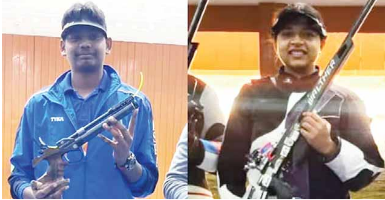
gold and bronze in the youth category. "I'm thrilled with this win.