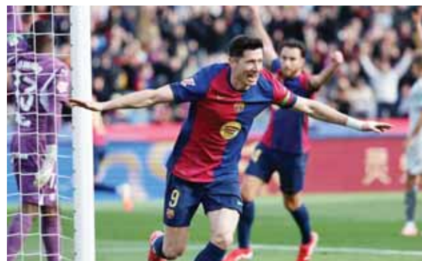
scoring game for Barcelona, which had claimed 14 goals in its last three matches — including a 7-1 rout of Valencia in the league. Lewandowski scored his fourth goal in as many matches across all competitions, and his seventh in the last eight games. The Poland striker scored from close range after a volley by Lamine Yamal from inside the area deflected off a defender. Yamal had amazed the crowd only a few minutes into the game, using nifty moves to get past six defenders in a run that ended with Raphinha sending a shot wide of the net.

There was no rout this time but Barcelona still prevailed with Robert Lewandowski scoring a second-half winner as the Catalan club beat Alaves 1-0 to move within four points of rival Real Madrid at the top of the Spanish league. "It's not every time that we will be able to score three, four or five goals in a game," Lewandowski said. "We had to be patient and in the end we did what we had to do, which was to score one more goal than our opponent." Madrid lost 1-0 at Espanyol on Saturday after a run of 10 victories in its last 11 matches in all competitions. Third-placed Barcelona is three points behind second-placed Atletico Madrid, which ended a two-match winless streak in the league with a 2-0 victory against Mallorca on Saturday. "We knew we had to win this match," Lewandowski said. "We needed the victory. We had lost too many points in the league already." It was an unusually low-