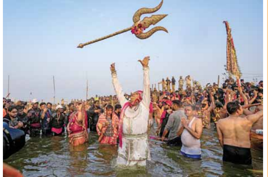
A Kinnar Akhara member tosses a trident while taking a holy dip on the 'Basant Panchami' during the ongoing Mahakumbh Mela, at the Sangam in Prayagraj