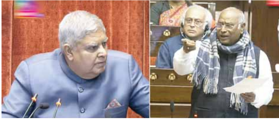
Delhi Vice President and Rajya Sabha Chairman Jagdeep Dhankhar conducts proceedings of the House as LoP Mallikarjun Kharge speaks during the Budget session of Parliament, in New Delhi

The Rajya Sabha on Monday witnessed uproar from the treasury benches after Leader of Opposition (LoP) and Congress president Mallikarjun Kharge paid tribute to 'thousands' who died in stampede in Maha Kumbh on January 29. Chairman Jagdeep Dhankhar asked him to authenticate or retract the statement. Opposition MPs in the Lok Sabha also voiced strong concerns over the Kumbh Mela stampede, accusing the Government of negligence and insensitivity and calling for accountability. Kharge was quick to add that "this is my estimate (and) if this is not right you (the Government) should tell what is the truth". He said he was ready to be corrected. "I did not say 'thousands' to blame anyone. But how many people died, give that information at least. I will apologise if I am wrong. They should give figures how many died, how many are missing," he said. However, while participating in a debate on the Motion of Thanks to the President's address in Rajya Sabha, Kharge used the phrase "the thousands who died in Kumbh" to pay tributes to the deceased. "I pay my tributes to the people who died in Maha Kumbh... The thousands who died in