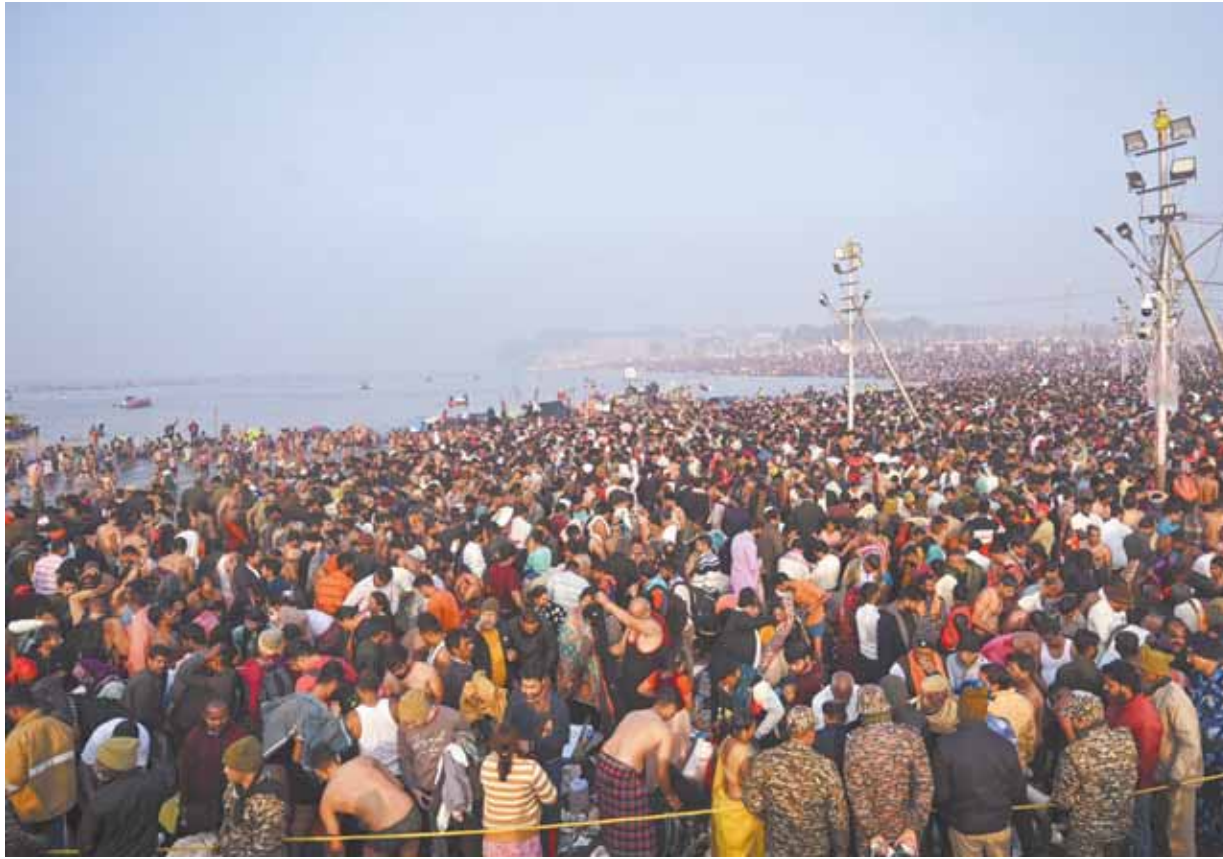
Devotees gather to take a holy dip at the Sangam on the occasion of Basant Panchami during the Maha Kumbh in Prayagraj on Monday

Following the customary order, the akharas proceeded towards the Sangam with full grandeur. The amrit snan began with Maha Nirvani Akhara, followed by the Naga Sadhus of Niranjani Akhara, Panchdashnam Juna Akhara,