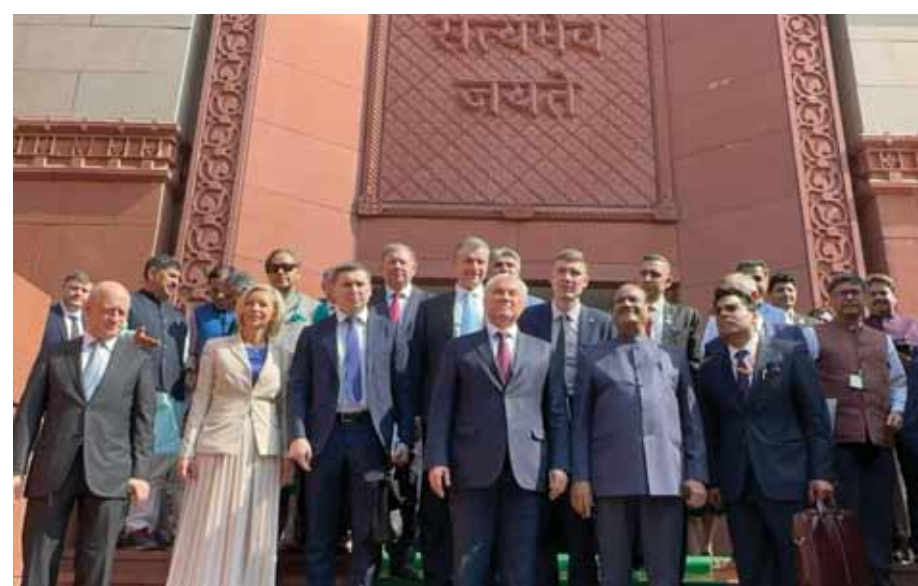
Russian Parliamentary delegation led by Vyacheslav Volodin, Chairman of the State Duma of the Federal Assembly of the Russian Federation, called on Lok Sabha Speaker Om Birla at the Parliament House on Monday