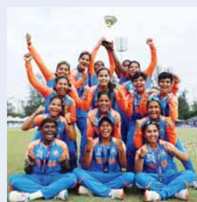
India beat South Africa by nine wickets in the 2025 U-19 T20 World Cup final at the Bayuemas Oval in the Malaysian capital of Kuala Lumpur. Champions India won all their group-stage matches against West Indies, Malaysia and Sri Lanka before getting the better of Bangladesh and Scotland in the Super Six. In the semifinal, they defeated England to make it six wins on the bounce. Meanwhile, South Africa topped Group C with wins over New Zealand, Samoa, and Nigeria.

In the Super Six round, South Africa defeated Ireland but had to share points with the USA after the game was abandoned due to rain. In the semifinal, they defeated Australia by five wickets to seal their spot in the final. In the final, India defeated South Africa by nine wickets to win the coveted trophy.