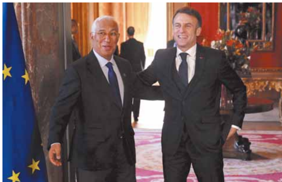
European Council President Antonio Costa, left, greets French President Emmanuel Macron as he arrives for an EU summit at the Egmont Palace in Brussels, on Monday

to respect the sovereignty of all national states in the world, and that Greenland is today a part of the Kingdom of Denmark. It's part of our territory and it's not for sale." She acknowledged US concerns about security in the Arctic Region, where Russia and China have been increasingly active. "I totally agree with the Americans that the High North, that the Arctic region is becoming more and more important when we are talking about defence and security and deterrence," Frederiksen said, adding that the US and Denmark could have "stronger footprints" in Greenland, in security terms. "They are already there and they can have more possibilities," she said, underlining that Denmark itself can also "scale up" its security presence. "If this is about securing our part of the world, we can find a way forward," Frederiksen said. Last week, her government announced a roughly 14.6 billion kroner (nearly $2 billion) agreement with parties includ-