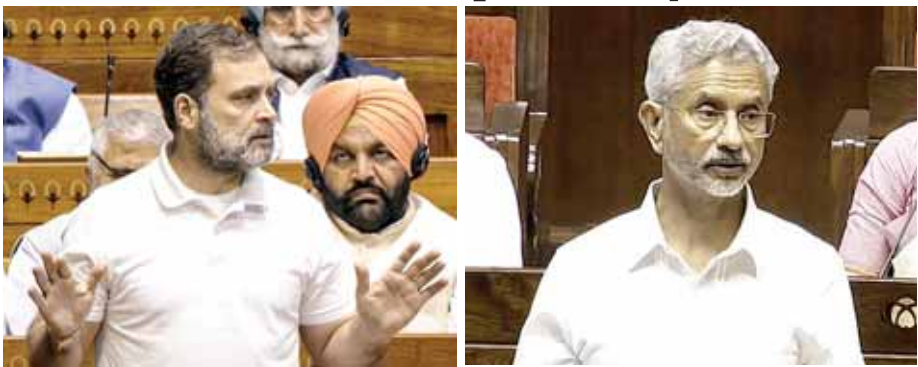
(Left) Rahul Gandhi speaks in the Lok Sabha during the Budget session of Parliament. (Right) MEA S Jaishankar

Jaishankar asserted that no discussion about an invitation to Prime Minister Modi ever took place and pointed out that the Prime Minister does not attend such events. Union Minister for Parliamentary Affairs Kiren Rijiju too strongly objected to the remarks. "It is common knowledge that our PM does not attend such events. In fact, India is generally represented by Special Envoys," he clarified. Jaishankar represented India at Donald Trump's inauguration on January 20. He was seated in the first row during the ceremony. Mocking the Central government during Motion of Thanks on the President's address in Lok Sabh, Rahul claimed that if the Modi government had taken economic policies seriously, then the government would