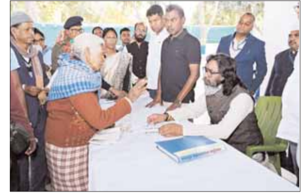
Chief Minister Hemant Soren listening to people from various areas at his residence, Khijuria in Dumka on Monday.

Common people from different areas who reached the residence of Chief Minister Hemant Soren at Khijuria, Dumka today met him and apprised him of their problems. The Chief Minister directed the concerned officials to resolve the problems of the people soon. On this occasion, the Chief Minister told the people that this is Abua Government. With the blessings of all of you, a strong government has been formed once again in the state. Resolving your problems is among the top priorities of our government.