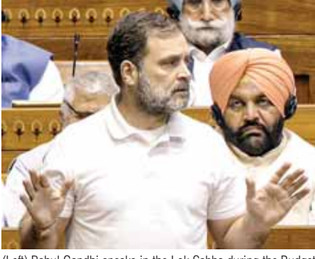
(Left) Rahul Gandhi speaks in the Lok Sabha during the Budget session of Parliament.

Leader of Opposition in Lok Sabha Rahul Gandhi on Monday created a flutter by raking up the issue of Prime Minister Narendra Modi 'not being invited for coronation of US President Donald Trump last month to which the External Affairs Minister S Jaishankar dismissed the claim as false and accused the Congress of harming India's global image. Jaishankar asserted that no discussion about an invitation to Prime Minister Modi ever took place and pointed out that the Prime Minister does not attend such events. Union Minister for Parliamentary Affairs Kiren Rijju too strongly objected to the remarks. "It is common knowledge that our PM does not attend such events. In fact, India is generally represented by Special Envoys," he clarified. Jaishankar represented India at Donald Trump's inauguration on January 20. He was seated in the first row during the ceremony. Mocking the Central government during Motion of Thanks on the President's address in Lok Sabh, Rahul claimed that if the Modi government had taken economic policies seriously, then the government would