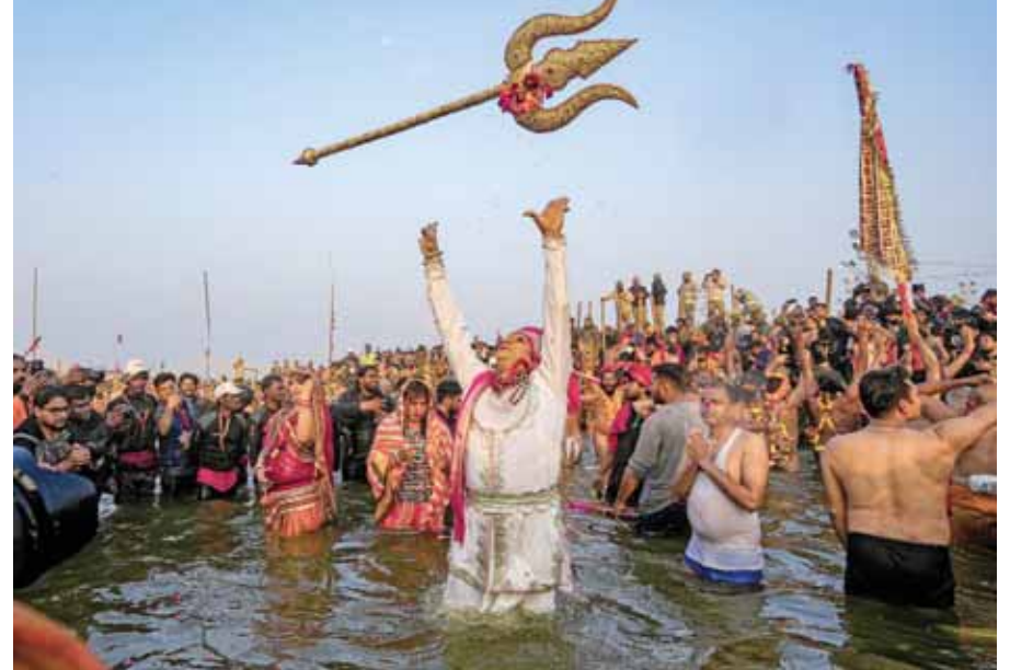
A Kinnar Akhara member tosses a trident while taking a holy dip on the 'Basant Panchami' during the ongoing Mahakumbh Mela, at the Sangam in Prayagraj