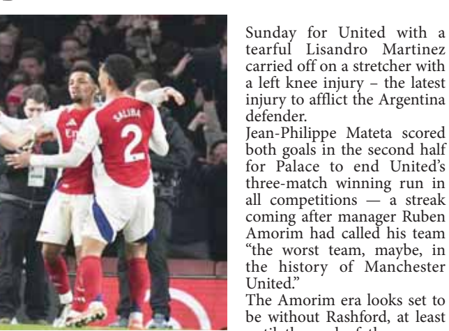
that went on there, you do have that fire in your stomach." Arsenal was alone in second place, three points above Nottingham Forest and nine above fourth-placed City. MARTINEZ SUSTAINS SERIOUS INJURY IN UNITED LOSS On the day locally born striker Marcus Rashford edged closer to a departure from Old Trafford, Manchester United lacked a cutting edge up front in the loss to Crystal Palace. And there was more bad news

Emirates that again demonstrated the new-found hostility between Arsenal and City. City arrived having won six of its last eight games in all competitions but all is still not right with Pep Guardiola's team, which let in a sloppy opener when Manuel Akanji was dispossessed near his own area and Martin Odegaard scored. Haaland was goaded after that goal by Gabriel in a hangover from the spiky 2-2 draw between the teams in September but responded by equalizing in the 55th. Arsenal went back in front in the 57th through Thomas Partey's deflected shot and there were further goals from Myles Lewis-Skelly, Kai Havertz and Ethan Nwaneri as City fell apart in a similar fashion to the 4-2 loss at Paris Saint-Germain in the Champions League last month. "How we played in the last 30 minutes is not acceptable. It's not us," City defender John Stones said. "I'm angry, upset." Arsenal revelled in the win. Lewis-Skelly, an 18-year-old defender, marked his goal by sitting down, crossing his legs and delivering a "Zen" celebration — one often used by Haaland. And when the final whistle sounded, the home team played Kendrick Lamar's "Humble" loudly around the stadium — surely a nod to Haaland telling Arsenal manager Mikel Arteta to "stay humble" after the 2-2 draw in September. "This is a thing that's been building up over a certain amount of time," Arsenal midfielder Declan Rice said. "With the Etihad at the start of the season and everything