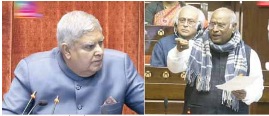
Delhi Vice President and Rajya Sabha Chairman Jagdeep Dhankhar conducts proceedings of the House as LoP Mallikarjun Kharge speaks during the Budget session of Parliament, in New Delhi.

The Rajya Sabha on Monday witnessed uproar from the treasury benches after Leader of Opposition (LoP) and Congress president Mallikarjun Kharge paid tribute to 'thousands' who died in stampede in Maha Kumbh on January 29. Chairman Jagdeep Dhankhar asked him to authenticate or retract the statement. Opposition MPs in the Lok Sabha also voiced strong concerns over the Kumbh Mela stampede, accusing the Government of negligence and insensitivity and calling for accountability. Kharge was quick to add that "this is my estimate (and) if this is not right you (the Government) should tell what is the truth". He said he was ready to be corrected. "I did not say 'thousands' to blame anyone. But how many people died, give that information at least. I will apologise if I am wrong. They should give figures how many died, how many are missing," he said. However, while participating in a debate on the Motion of Thanks to the President's address in Rajya Sabha, Kharge used the phrase "the thousands who died in Kumbh" to pay tributes to the deceased. "I pay my tributes to the people who died in Maha Kumbh... The thousands who died in