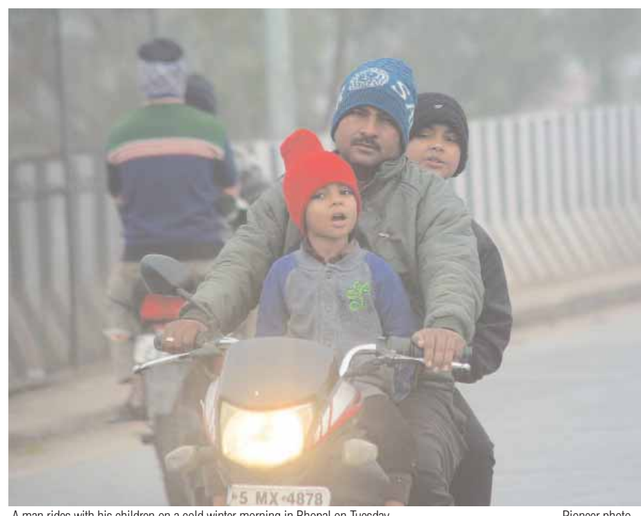
A man rides with his children on a cold winter morning in Bhopal on Tuesday.

mote milk production. Under the collaboration agreement between the M.P. State Co-operative Dairy Federation Limited and the National Dairy Development Board (NDDB), collection centers will be established in every Gram Panchayat to ensure fair pricing for milk producers. Milk unions' processing capacity will be expanded. Approximately Rs 1,500 crore will be invested over the next five years. The number of milk committees will increase from 6,000 to 9,000. Daily milk collection will grow from 10.5 lakh kg to 20 lakh kg. Annual income for milk producers is targeted to rise from Rs 1,700 crore to Rs 3,500 crore. Efforts will be made to promote the Sanchi brand at the national level.