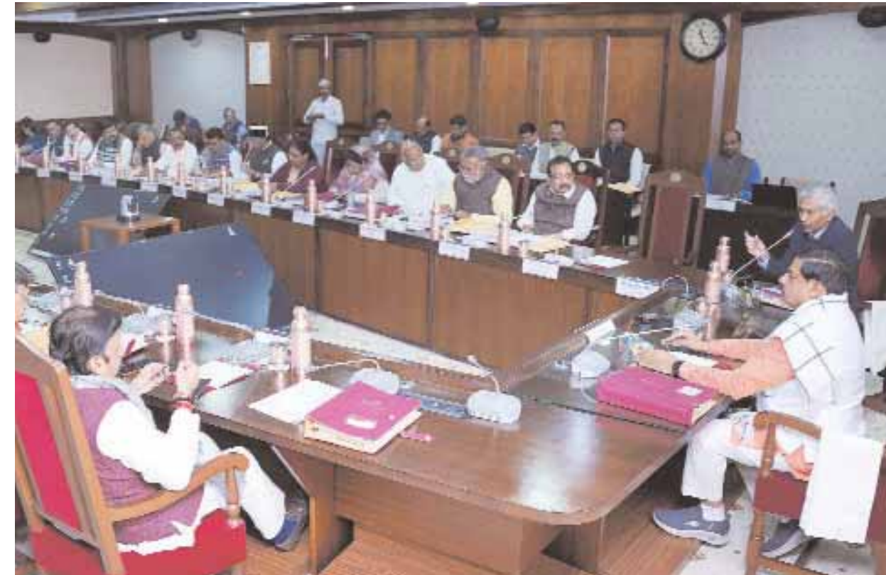
Madhya Pradesh Chief Minister Mohan Yadav chairs a meeting with his Cabinet Ministers at State Mantralaya in Bhopal on Tuesday.

adding to the chill. The cold winds are expected to dominate regions such as Gwalior, Sheopur, Morena, and others, prolonging the icy conditions. Meteorological experts predict that the chilly weather will persist, with another spell of cold expected in the coming days. A Western Disturbance is forecast to become active in North-West India by January 10, which could lead to further dips in temperature and light drizzle in parts of the state around January 12. As Madhya Pradesh braces for continued cold weather, residents are urged to prepare for extended chilly conditions. The state remains under the influence of freezing winds, dense fog, and dropping temperatures, impacting daily life and making this one of the coldest spells of the season.