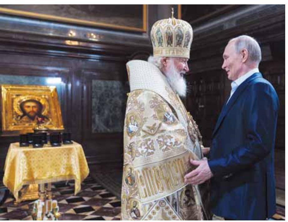
In this photo released by Russian Orthodox Church Press Service, Russian Orthodox Patriarch Kirill (left) and Russian President Vladimir Putin speak after the Christmas service in the Christ The Saviour Cathedral in Moscow, on Tuesday.

reported in the US, but previous illnesses have been mild and most have been detected among farmworkers exposed to sick poultry or dairy cows. In two cases — and adult in Missouri and a child in California — health officials have not determined how they caught it. The origin of the Louisiana person's infection was not considered a mystery. But it was the first human case in the US linked to exposure to backyard birds, according to the Centers for Disease Control and Prevention. Louisiana officials say they are not aware of any other cases in their state, and US officials have said they do not have any evidence that the virus is spreading from person to person.