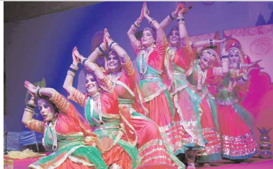
Artists from Rewa perform during 28th State level Yuva Utsav-2025 at TT Nagar Stadium in Bhopal on Tuesday.