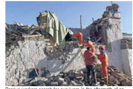
Rescue workers search for survivors in the aftermath of an earthquake in Changsuo Township of Dingri in Xigaze, southwestern China's Tibet Autonomous Region.

A 6.8-magnitude earthquake struck near one of Tibet's holiest cities on Tuesday, killing at least 95 people and injuring 130 others with tremors also shaking buildings and forcing people to run to the streets in neighbouring Nepal. According to regional disaster relief headquarters, the quake jolted Dingri County in Xigaze in Tibet Autonomous Region in China at 9:05 am Tuesday (Beijing Time). The US Geological Service, however, put the quake's magnitude at 7.1. At least 95 people have been confirmed dead and 130 others injured as of 3 p.m. Tuesday (local time), state-run Xinhua news agency reported. Chinese President Xi Jinping has ordered all-out rescue efforts to carry out relief and rescue operations in the affected areas. Xi ordered utmost efforts to treat the injured and urged efforts to prevent secondary