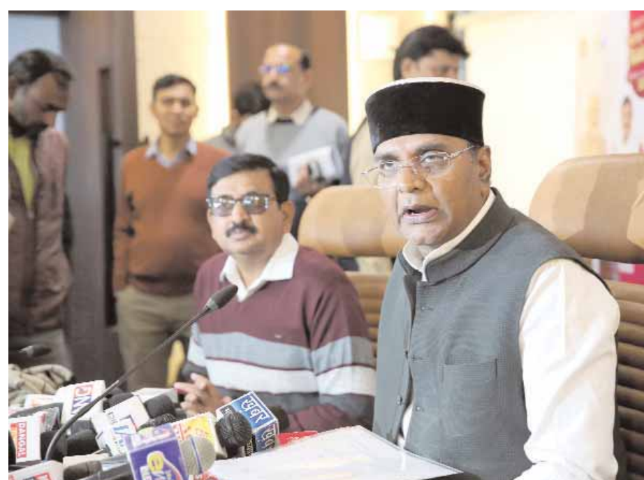
Minister for Sports and Youth Welfare Vishwas Kailash Sarang talking to media persons at TT Nagar Stadium in Bhopal on Tuesday.

(PARTH Police Army Recruitment Training & Hunar) scheme has been prepared to provide employment to the patriotic and energetic youth of the state in the police and army and to awaken the feeling of patriotism. The scheme will be inaugurated by Chief Minister Dr. Yadav on 8 January 2025 at 1 pm in the closing ceremony of the state level Yuva Mahotsav programme at TT Nagar Stadium Bhopal. Under the scheme, the training scheme will be conducted at the division level to provide pre-recruitment physical and mental training to the youth of the state for employment in the Indian Army, Police, Para Military etc. Schemes for the pre-recruitment training programme for youth will be conducted at the division level of the department.