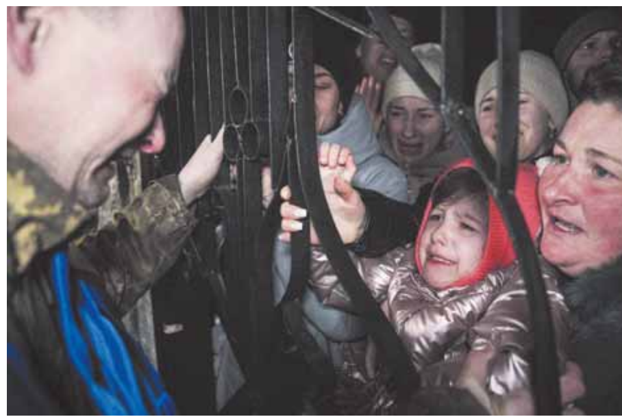
A Ukrainian serviceman cries upon seeing his daughter after returning from captivity during a POWs exchange between Russia and Ukraine, in Ukraine

Kyiv's Western allies have provided air defense systems to help Ukraine protect critical infrastructure, but Russia has