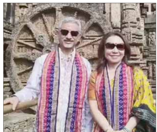
External Affairs Minister S Jaishankar, who is in Odisha to attend the Pravasi Bharatiya Divas Convention, visits the Konark Sun Temple on Tuesday.