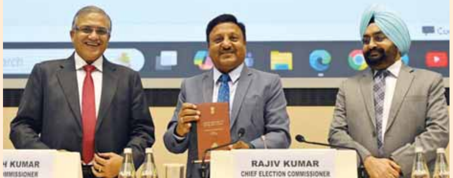
Chief Election Commissioner Rajiv Kumar with Election Commissioners Gyanesh Kumar and Sukhbir Singh Sandhu during a press conference for the announcement of the schedule for the Delhi Assembly elections.

Model Code of Conduct (MCC) is now in effect and will remain so until the conclusion of the polls. The last date to file nominations is January 17 and the scrutiny of nominations will be done by January 18. Candidates will be able to withdraw their nominations till January 20. Of the 70 seats in Delhi, 58 are general and 12 reserved. According to the electoral roll, Delhi has 1.55 crore voters -- 83.49 lakh men, 71.74 lakh women and 1,261 transgender persons. There are 25.89 lakh young voters, 2.08 lakh first-time voters, and 830 above the age of 100, Kumar said. More than 13,000 polling stations will be set up in Delhi, he said. Kumar has urged candidates and political party leaders to refrain from making remarks against women and involving children during poll campaigns. He was asked