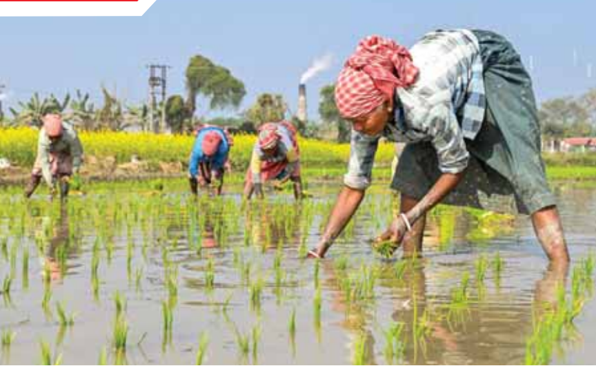
Farmers plant paddy saplings in a field, in Nadia