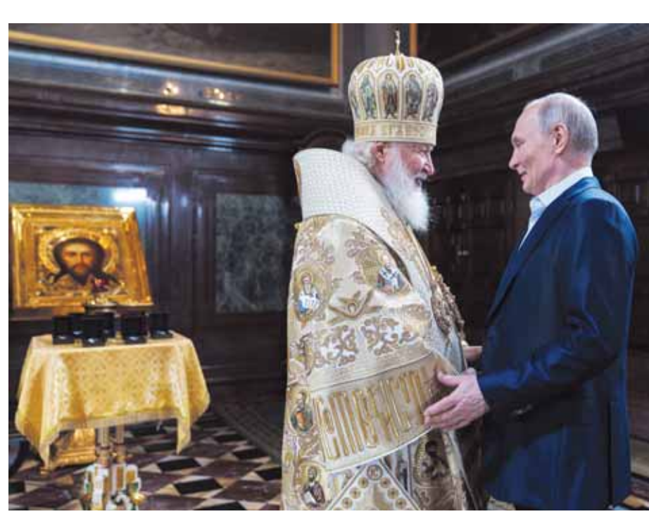
Russian Orthodox Patriarch Kirill (left) and Russian President Vladimir Putin speak after the Christmas service in the Christ The Saviour Cathedral in Moscow, on Tuesday.

reported in the US, but previous illnesses have been mild and most have been detected among farmworkers exposed to sick poultry or dairy cows. In two cases — and adult in Missouri and a child in California — health officials have not determined how they caught it. The origin of the Louisiana person's infection was not considered a mystery. But it was the first human case in the US linked to exposure to backyard birds, according to the Centers for Disease Control and Prevention. Louisiana officials say they are not aware of any other cases in their state, and US officials have said they do not have any evidence that the virus is spreading from person to person.