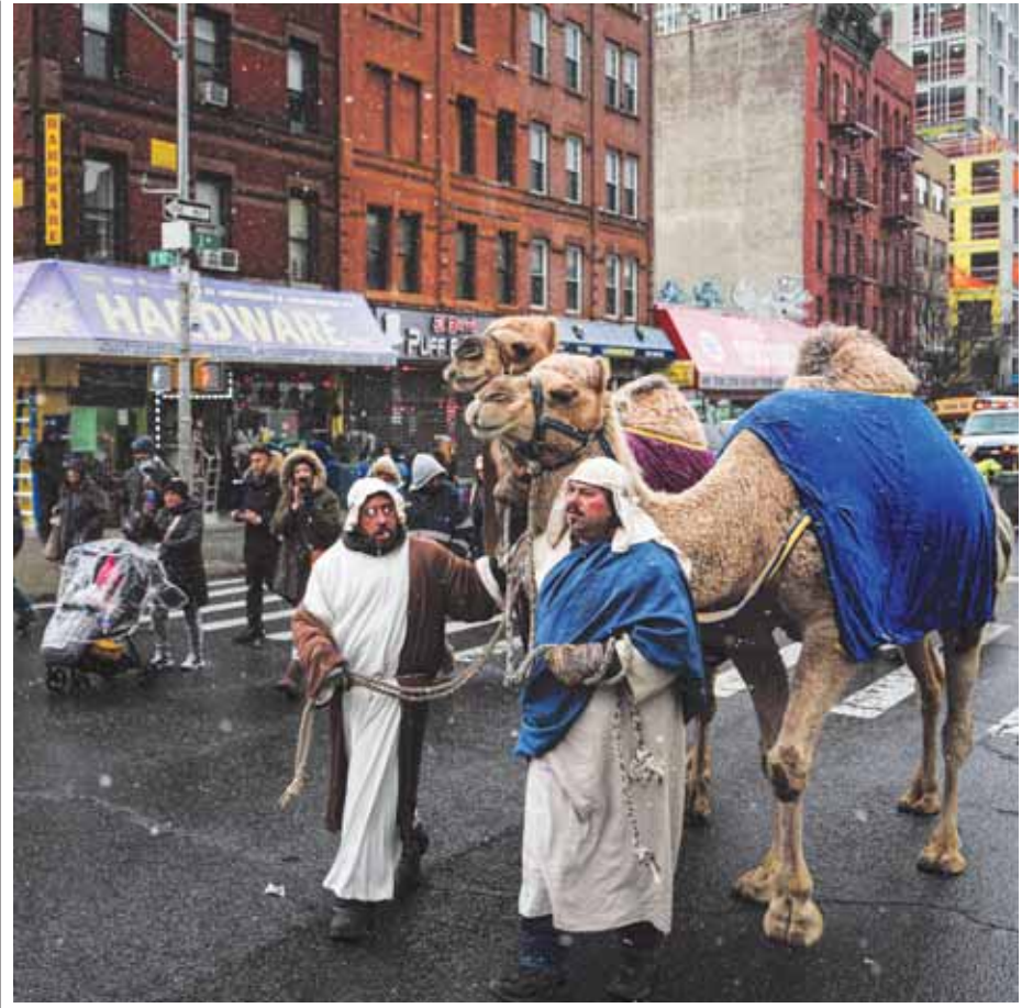
Camels walk through snow during El Museo del Barrio's 47th annual Three Kings Day parade on Monday, in New York.