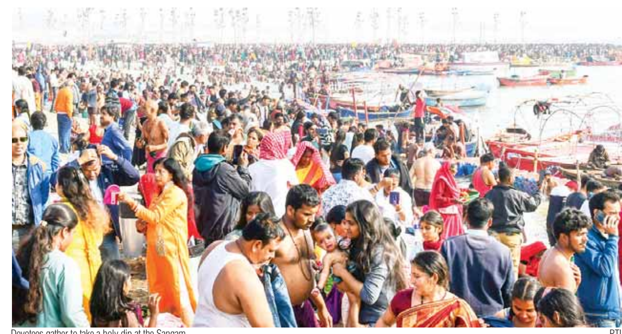
Devotees gather to take a holy dip at the Sangam