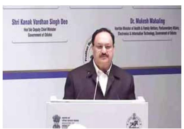
Six Crore senior citizens brought under Ayushman Bharat, 45 per cent of population covered: Nadda