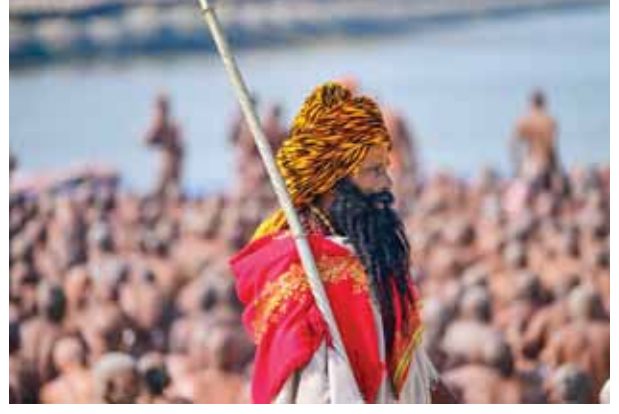
appreciation. The Media Center also features amenities such as tea, breakfast, and dining facilities, along with a well-equipped conference room. Comprehensive security arrangements have been implemented to ensure the safety and convenience of journalists and visitors alike.

broadcasting updates and news about the Mahakumbh on digital platforms. So far, 30 international journalists have conducted special coverage of the event, highlighting its cultural and spiritual significance. Chief Minister Yogi Adityanath has directed officials to ensure that the Media Center provides all necessary facilities for both domestic and international devotees to stay informed. The demand for Mahakumbh-related news is particularly high in countries such as the USA, Russia, Germany, Japan, and Israel. Adding to its global reach, Mahakumbh programs aired on Swedish Radio have garnered significant