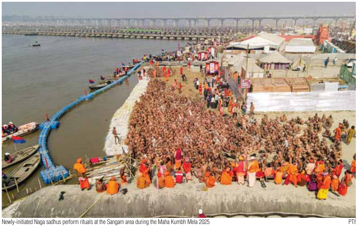
Newly-initiated Naga sadhus perform rituals at the Sangam area during the Maha Kumbh Mela 2025

a powerful blend of faith, humility, and joy." The Mahakumbh, one of the largest religious gatherings on Earth, has transformed Prayagraj into a vibrant tapestry of colors, sounds, and spiritual experiences. From the chanting of mantras to the rhythmic beats of devotional music, the atmosphere is charged with an undeniable sense of collective upliftment. "I have traveled from the southernmost tip of India to experience the sanctity of the Sangam," shared an elderly woman, her eyes glistening with tears of joy. "This is a once-in-a-lifetime opportunity to cleanse my soul and connect with the divine." Beyond the religious significance, the Mahakumbh also serves as a powerful testament to the unifying force of faith. People from all walks of life, irrespective of caste, creed, or social standing, come