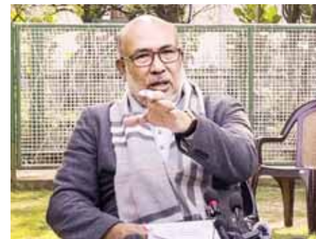
Manipur Chief Minister N. Biren Singh addresses a press conference

state over the last 20 months since the ethnic conflict began in May 2023. "From May to October, 2023, 408 firing incidents were reported. From November 2023 to April 2024, there were 345 firing incidents, whereas from May this year till now, 112 firing incidents were reported," he said. He said that of all the looted weapons, 3,112 have been recovered and 2,511 explosives have been seized during the period. The chief minister further said that 625 people have been arrested and 12,047 FIRs registered so far. More than 250 people have been killed and thousands rendered homeless in ethnic violence between Imphal Valley-based Meiteis and adjoining hills-based Kuki-Zo groups since May last year. Meanwhile, Manipur, which has been witnessing prolonged ethnic violence between majority Meitei and tribal Kuki communities, accounted for about 77 per cent of the total violence in the entire northeastern region in 2023, according to the latest annual report of the Ministry of Home Affairs. In 2023, Manipur witnessed an increase in violent incidents owing to the prevailing ethnic strife and the resultant increase in the casualties of civilians and security forces personnel as compared to 2022. The state accounted for about 77 per cent of the total violent incidents in Northeastern region in 2023, according to the MHA annual report. Among the total 243 violent incidents occurred in the Northeast, 187 took place in Manipur. Continued on page 2