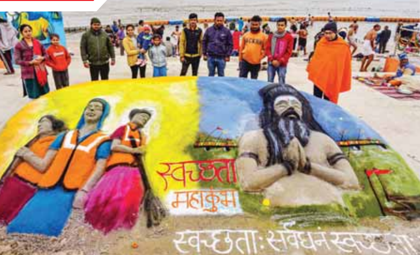
Devotees look at a sand sculpture themed on 'clean Mahakumbh' ahead of Mahakumbh 2025, in Prayagraj