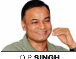
O P SINGH

these connections in today's fast-paced world requires conscious effort. Being present is challenging in a world of constant notifications, endless emails, and overflowing to-do lists. Yet studies show that mind-wandering—even toward pleasant thoughts—correlates with reduced happiness. The richest moments are those we fully engage in, whether during a family meal, a morning walk, or a simple act of kindness. Adaptability is another essential skill. Life rarely unfolds as planned, and the ability to pivot determines how well we navigate change. After reflection and building resilience, action must follow. Instead of sweeping declarations like "I'll meditate for an hour daily" focus on creating systems. Systems grounded in routine, rather than fleeting motivation, are more sustainable. The New Year isn't magical. It's a psychological cue to pause and reassess, but its real value lies in how you use it. Progress, not perfection, is the key to a fulfilling year. (The writer is author and DGP and head, Haryana State Narcotic Control Bureau; views are personal)