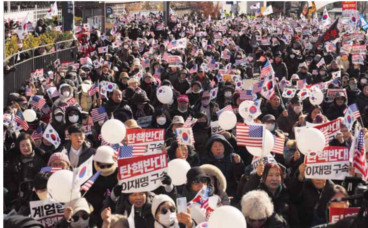
Supporters of impeached South Korean President Yoon Suk Yeol stage a rally near the presidential residence in Seoul, South Korea. The letters read 'Oppose Impeachment', and 'Arrest Lee Jae-myung'.