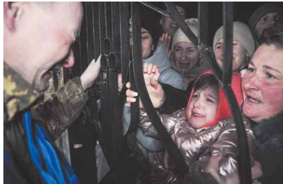
A Ukrainian serviceman cries upon seeing his daughter after returning from captivity during a POWs exchange between Russia and Ukraine, in Ukraine.

Around half of Ukraine's energy infrastructure has been destroyed during the war, and rolling electricity blackouts are common and widespread. Kyiv's Western allies have provided air defense systems to help Ukraine protect critical infrastructure, but Russia has