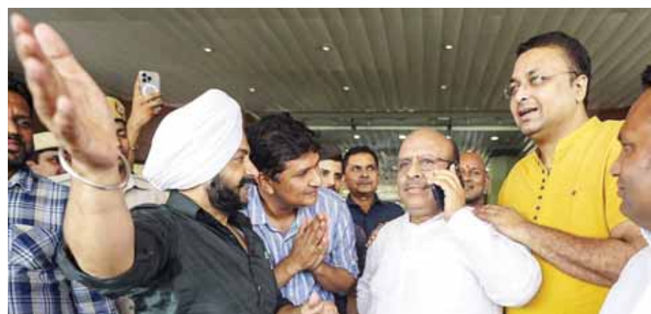
Arvind Kejriwal (right) interacting with a crowd of supporters during a campaign event.

The announcement of the Delhi Assembly elections schedule on Tuesday has escalated political tensions in the national capital, with key constituencies such as New Delhi, Kalkaji and Jangpura at the centre of the high-stakes battle. The voters of the city are set to cast their votes on February 5 and the results will be declared on February 8. The battle lines are drawn among the three major contenders --- AAP, BJP and Congress --- with heavyweight candidates from these political parties locking horns in fierce contests in the high-profile constituencies. The New Delhi constituency remains the epicentre of political tensions, as AAP supremo and former Chief Minister Arvind Kejriwal seeks re-election from the seat that he has represented for more than a decade. Kejriwal faces a formidable challenge from the sons of two former Delhi chief ministers.