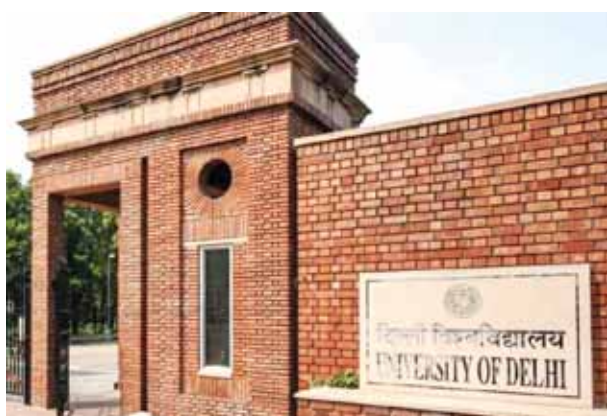
The entrance gate of St. Stephen's College, University of Delhi.

Nearly three months after Delhi University constituted a committee to address the long-standing policy implementation disputes with St. Stephen's college, no meeting has taken place between the two sides, delaying efforts to resolve allegations of the college disregarding university rules, a committee member said on Tuesday. In August last year, St. Stephen's rejected the applications of 12 'single girl child' students seeking admission to its undergraduate programmes beyond its declared seat capacity. DU had previously asked all its colleges to admit students beyond its seat limit for optimal filling of seats. The parents of the affected students challenged the matter in the Supreme Court, and after