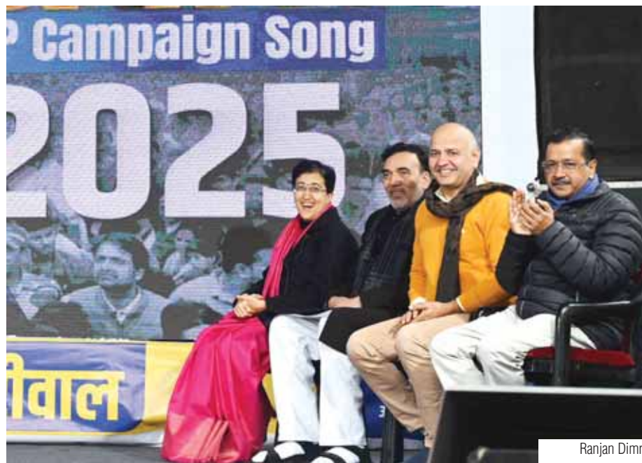
Arvind Kejriwal (left) and other party leaders sitting on a stage during the launch of the campaign song for the assembly elections.

widely. "Dance to it, play it at weddings, birthdays and celebrations." He also took a jab at the BJP, referring to it as a "gali-galauj (abuse)" party, and said, "I know even BJP leaders will like our song, they can secretly dance to it in their rooms." The song highlights the AAP government's core achievements, including free electricity, clean water, health care, and education. It aims to strike a chord with every section of society, including women, youngsters, children, and autorickshaw drivers, and counters misinformation against Kejriwal's administration, the party said in statement. The party has not disclosed who sang the song. AAP launched its first campaign song in 2015, followed by another in 2020. With "Phir Layenge Kejriwal", the party hopes to rally support for a