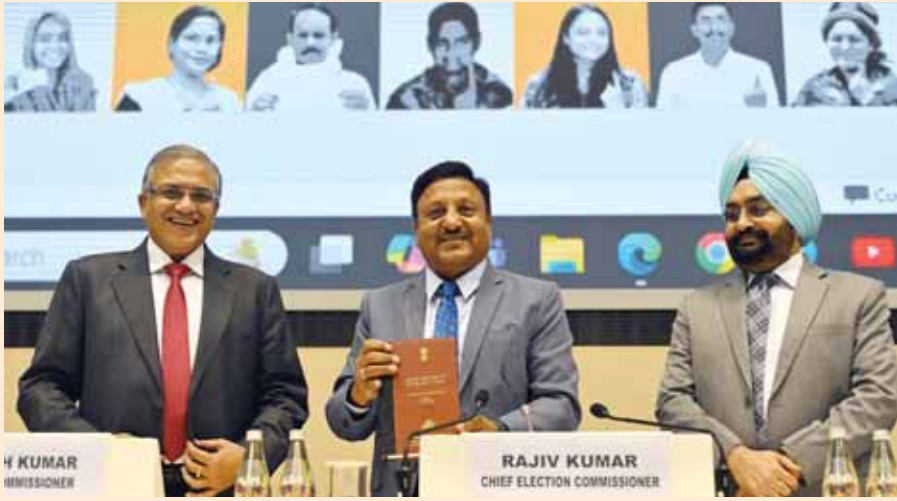
Chief Election Commissioner Rajiv Kumar with Election Commissioners Gyanesh Kumar and Sukhbir Singh Sandhu during a press conference for the announcement of the schedule for the Delhi Assembly elections.

With an announcement of the 70 assembly seats in Delhi in a single phase on February 5 and the votes will be counted on February 8 by the Election Commission (EC), the stage is set for a fierce triangular contest between the incumbent Aam Aadmi Party (AAP), the Bharatiya Janata Party (BJP), and the Congress. The battle lines are drawn between Prime Minister Narendra Modi's developmental model versus the 'freebies' model touted by the AAP chief and former Chief Minister Arvind Kejriwal, who is eyeing a hat-trick, having swept the 2015 and 2020 elections with 67 and 62 seats, respectively. The AAP faces anti-incumbency, corruption allegations and an aggressive BJP in its bid to assume power for a third successive term. The Congress will be keen to regain the national Capital. Although the Congress and the AAP contested the 2024 Lok Sabha elections together as part of the INDIA bloc, they will be competing separately in the upcoming Assembly polls. Announcing the dates for the Assembly polls in Delhi, Chief Election Commissioner Rajiv Kumar said "It is a single-phase election... We have deliberately kept polling on a Wednesday so more people come out to vote... like we did in Maharashtra. The entire election process will be completed by February 10." With the EC's announcement of the election schedule, the