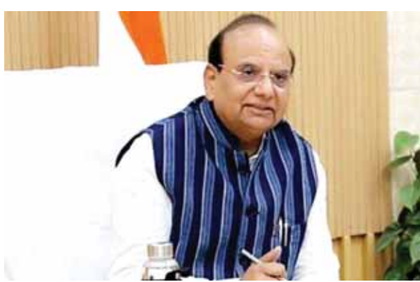
Vinai Kumar Saxena, Lieutenant Governor of Delhi, speaking at a press conference.

In a big relief to thousands of students of the Capital's unauthorised colonies, Delhi Lieutenant Governor Vinai Kumar Saxena has approved regularisation of 150 un-aided schools in non-conforming areas. According to a statement issued by Raj Niwas, these schools, where the access of roads is six metres or above, lie in areas such as Narela, Shaheed Bhagat Singh Colony, Najafgarh, Sangam Vihar, Asola, Nathupura, Deoli, Badarpur, Shyam Vihar, Bhagat Vihar, Mundka, etc. -- all unauthorised colonies. "The issue of regularisation of these schools had come up prominently in LG's 'Samvaad@RajNiwas' with principals/teachers of private schools on December 20, 2024. Saxena had then promised that he will look into the matter and very soon get it sorted," the