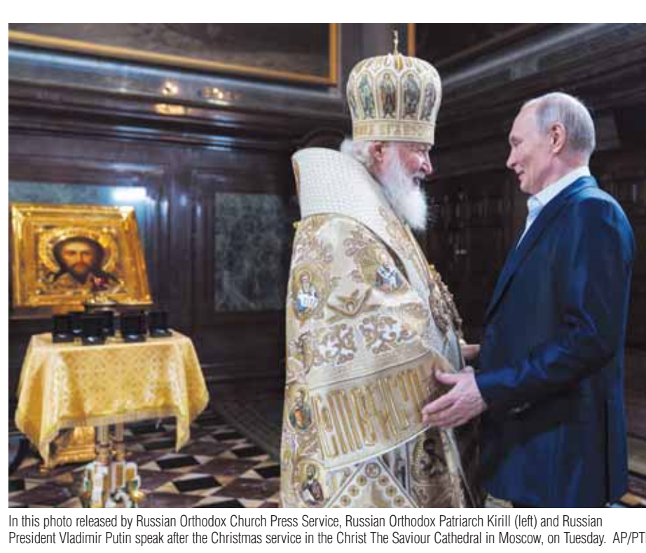
In this photo released by Russian Orthodox Church Press Service, Russian Orthodox Patriarch Kirill (left) and Russian President Vladimir Putin speak after the Christmas service in the Christ The Saviour Cathedral in Moscow, on Tuesday.

THE FIRST US BIRD FLU DEATH has been reported — a person in Louisiana who had been hospitalized with severe respiratory symptoms.