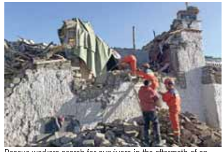
Rescue workers search for survivors in the aftermath of an earthquake in Changsuo Township of Dingri in Xigaze, southwestern China's Tibet Autonomous Region.

A 6.8-magnitude earthquake struck near one of Tibet's holiest cities on Tuesday, killing at least 95 people and injuring 130 others with tremors also shaking buildings and forcing people to run to the streets in neighbouring Nepal. According to regional disaster relief headquarters, the quake jolted Dingri County in Xigaze, Tibet Autonomous Region in China at 9:05 am Tuesday (Beijing Time). The US Geological Service, however, put the quake's magnitude at 7.1. At least 95 people have been confirmed dead and 130 others injured as of 3 p.m. Tuesday (local time), state-run Xinhua news agency reported. Chinese President Xi Jinping has ordered all-out rescue efforts to carry out relief and rescue operations in the affected areas. Xi ordered utmost efforts to treat the injured and urged efforts to prevent secondary