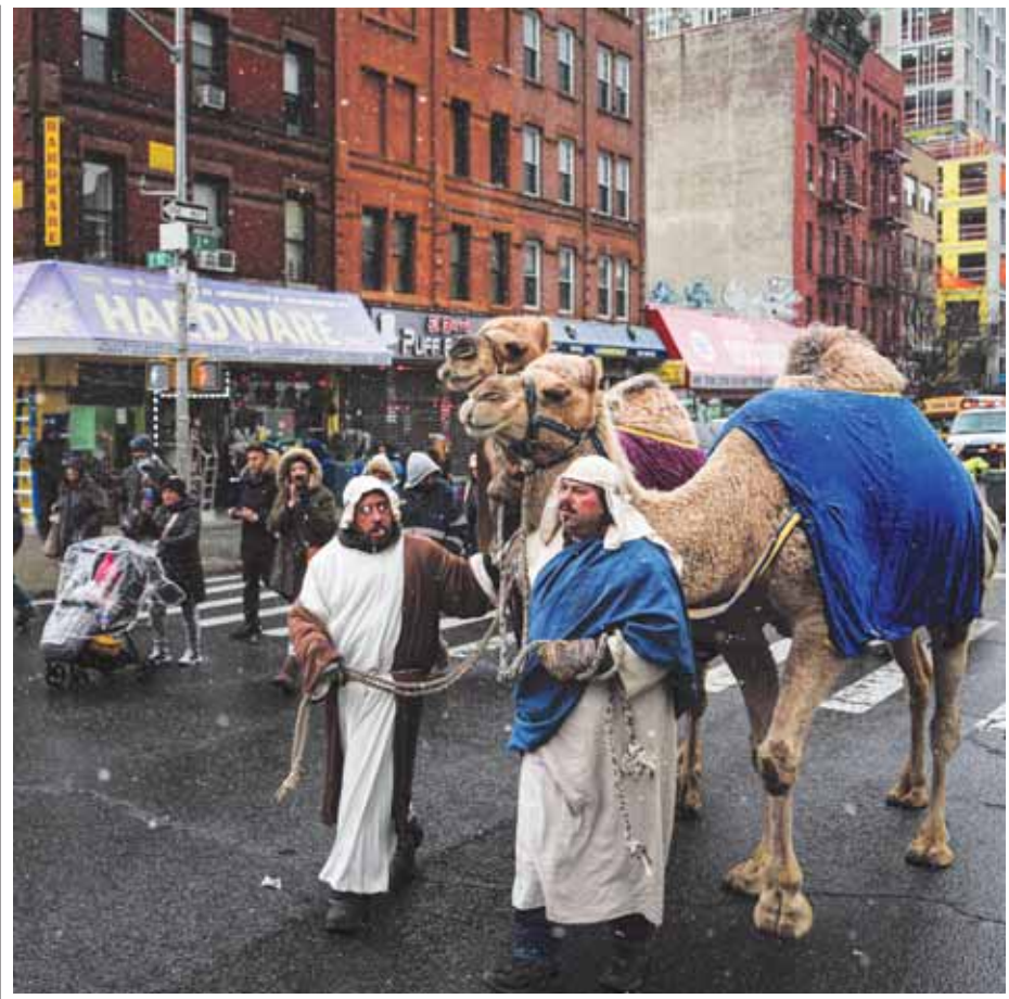
Camels walk through snow during El Museo del Barrio's 47th annual Three Kings Day parade on Monday, in New York.