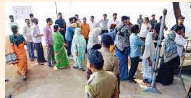
A group of people gathered for a political event, possibly a campaign launch or a public meeting.

Political parties including the BJP, AAP and Congress welcomed the announcement of Delhi assembly elections and asserted their claim to the throne with the AAP chief Arvind Kejriwal terming the elections as a battle between 'politics of work' and 'politics of hurling abuses'. Welcoming the announcement, the former Chief Minister rallied AAP's volunteers, calling them the party's greatest strength and urging them to rise with determination to defeat the opposition's machinery. "The election schedule has been announced. All volunteers should gear up with full strength and enthusiasm to take the field. Even their massive machinery fails in the face of your passion. You are our greatest strength. This election will be a contest between the politics of work and the politics of hurling abuses. The