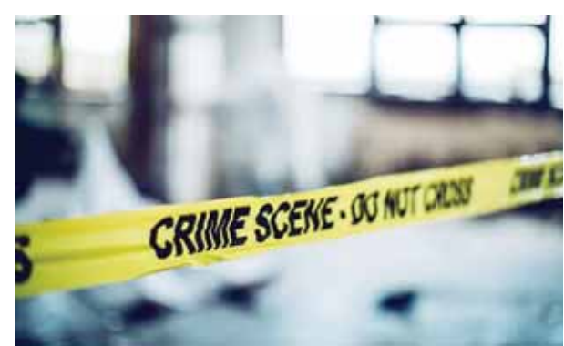
A crime scene with yellow tape and a sign that says 'CRIME SCENE - DO NOT CROSS'.