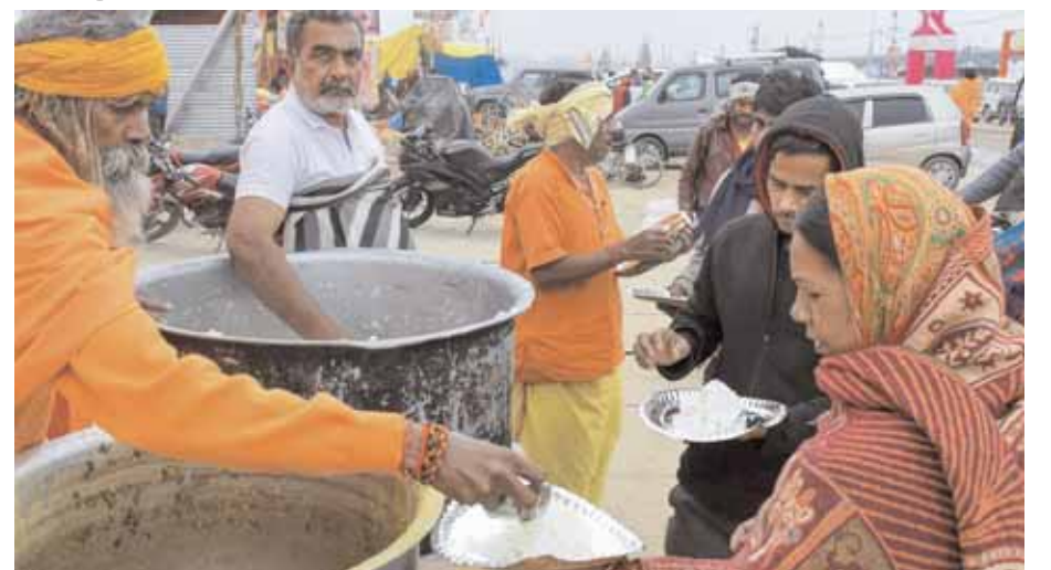
Pilgrims receive food ahead of Maha Kumbh 2025, at Sangam in Prayagraj on Tuesday

The government has effectively opened its "food granary" for the Maha Kumbh, arranging for 1.2 lakh white ration cards for Kalpvasis to access subsidised items. Kalpvasis, Akharas, and institutions will benefit from significantly reduced prices on essential supplies. Flour will be available at Rs 5 per kilogram, rice at Rs 6 per kilogram, and sugar at Rs 18 per kilogram, officials said. Additionally, the government has allocated 800 permits to Akharas and institutions. In addition to subsidised rations,