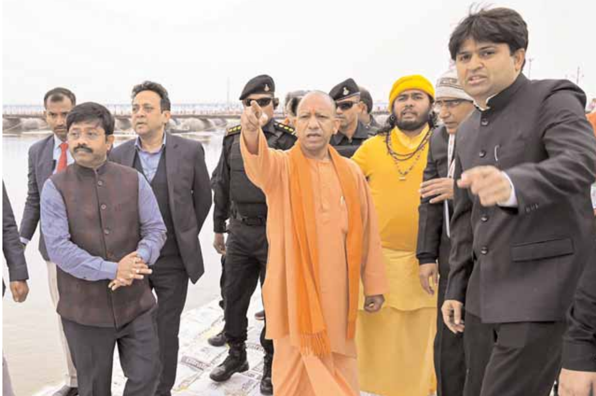
Uttar Pradesh Chief Minister Yogi Adityanath inspects preparations ahead of Maha Kumbh 2025 in Prayagraj on Tuesday

Extending his New Year wishes, the chief minister remarked, "With everyone's cooperation, the honour of hosting the Maha Kumbh with full grandeur will not only reflect the efforts of the double-engine government but also the pride of the people of Prayagraj. I appeal to the residents of Prayagraj to seize this opportunity to surpass the remarkable example of cleanliness and hospitality they set during the 2019 Kumbh. This time too, our Prayagraj will shine as a model of cleanliness and exemplary hospitality."