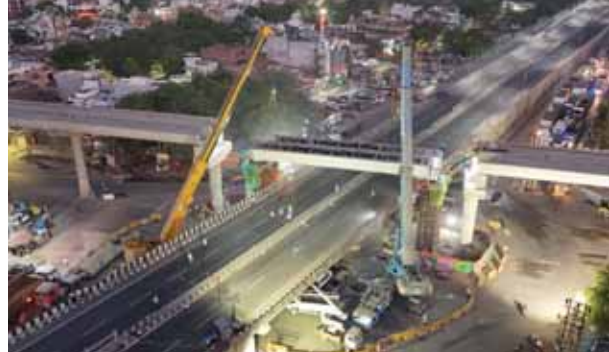
Kanpur Metro used steel box girders between the viaducts of Basant Vihar and Kidwai Nagar stations at Naubasta intersection.

Kanpur Metro achieved several historic milestones for the city in 2024. The key accomplishments include the erection of the steel box girder over the flyover at Naubasta intersection and the completion of tunnels and tracks up to Kanpur Central. This year also saw the commencement of civil construction work for Corridor-2 (CSA to Barra-8). Following the successful test run of metro trains on both lines (upline and downline) from Motijheel to Kanpur Central, preparations are now in the final stages to launch passenger service to Kanpur Central at the start of the new year. By the end of 2025, passenger service will extend to Naubasta, the last station of Corridor-1, connecting the city's key centres — educational institutions, markets, railway