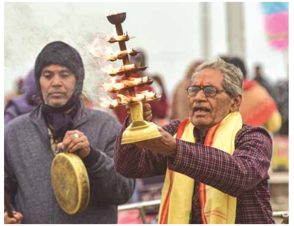
A devotee performs 'Ganga Aarti' after taking a holy dip in the Ganga river during a cold winter morning on Tuesday ahead of Maha Kumbh Mela 2025 at Sangam in Prayagraj