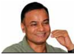
O P SINGH

these connections in today's fast-paced world requires conscious effort. Being present is challenging in a world of constant notifications, endless emails, and overflowing to-do lists. Yet studies show that mind-wandering—even toward pleasant thoughts—correlates with reduced happiness. The richest moments are those we fully engage in, whether during a family meal, a morning walk, or a simple act of kindness. Adaptability is another essential skill. Life rarely unfolds as planned, and the ability to pivot determines how well we navigate change. After reflection and building resilience, action must follow. Instead of sweeping declarations like "I'll meditate for an hour daily" focus on creating systems. Systems grounded in routine, rather than fleeting motivation, are more sustainable. The New Year isn't magical. It's a psychological cue to pause and reassess, but its real value lies in how you use it. Progress, not perfection, is the key to a fulfilling year. (The writer is author and DGP and head, Haryana State Narcotic Control Bureau; views are personal)