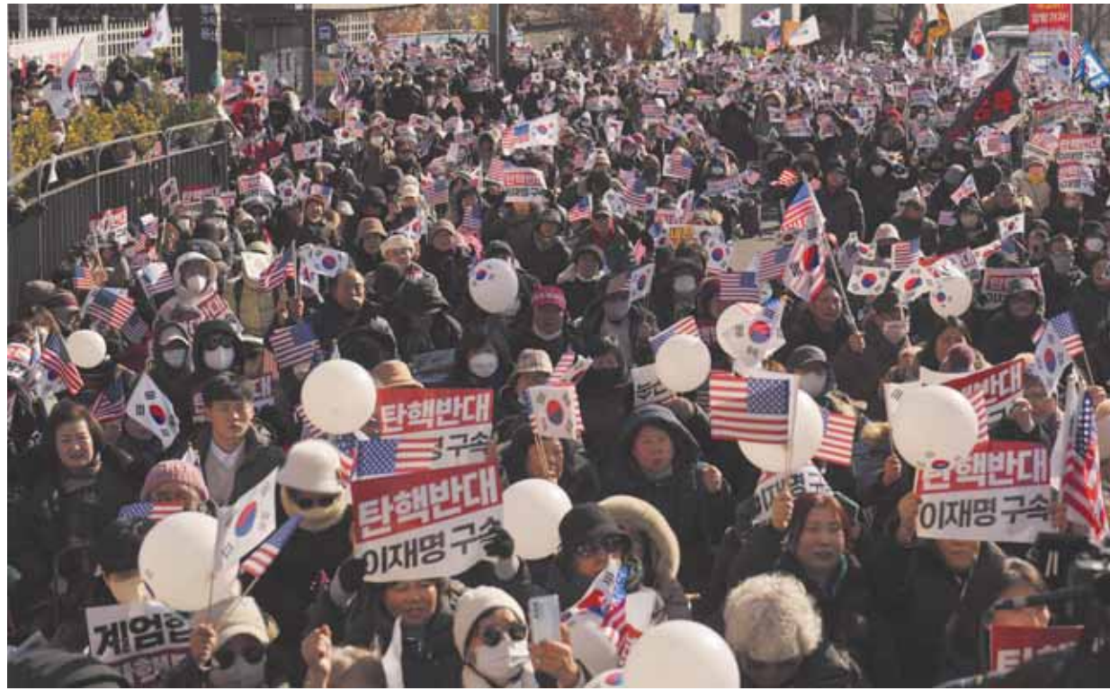
Supporters of impeached South Korean President Yoon Suk Yeol stage a rally near the presidential residence in Seoul, South Korea. The letters read 'Oppose Impeachment', and 'Arrest Lee Jae-myung'.