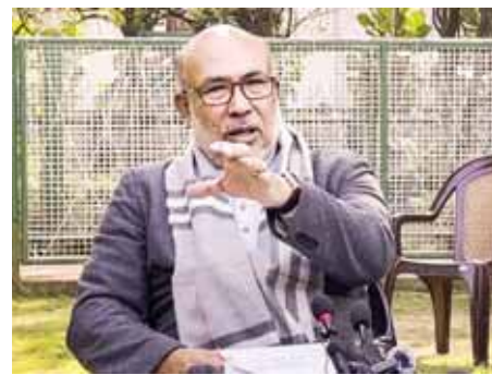
Manipur Chief Minister N. Biren Singh addresses a press conference

Singh said firing incidents have declined in the