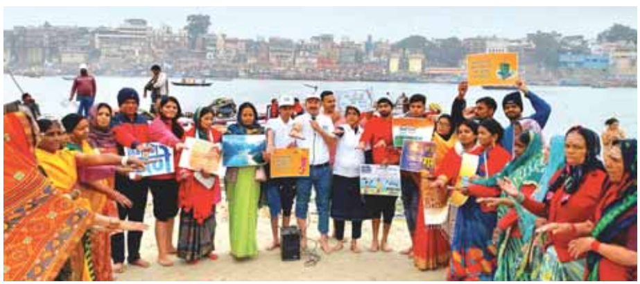
Namami Gange activists welcoming New Year 2025 in Varanasi on Tuesday.