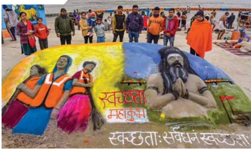
Devotees look at a sand sculpture themed on 'clean Mahakumbh' ahead of Mahakumbh 2025, in Prayagraj