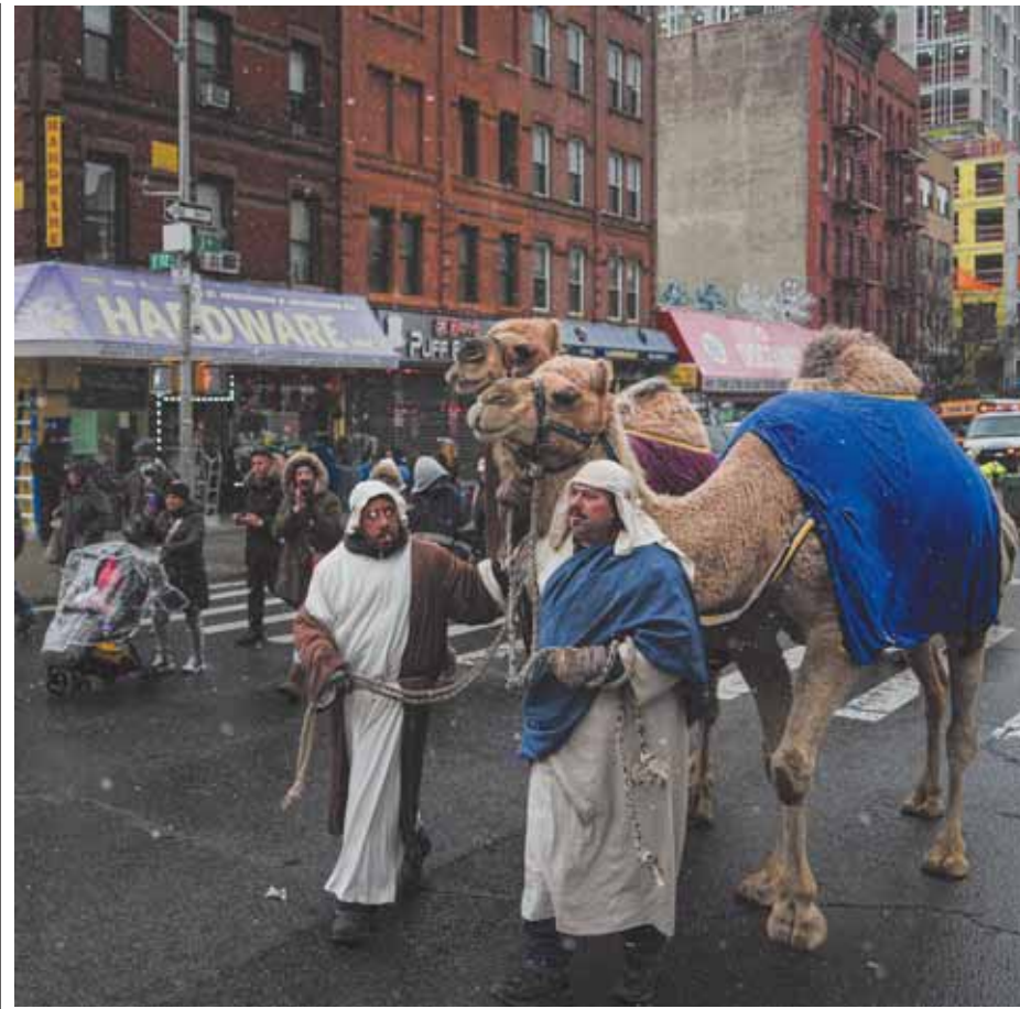
Camels walk through snow during El Museo del Barrio's 47th annual Three Kings Day parade on Monday, in New York.