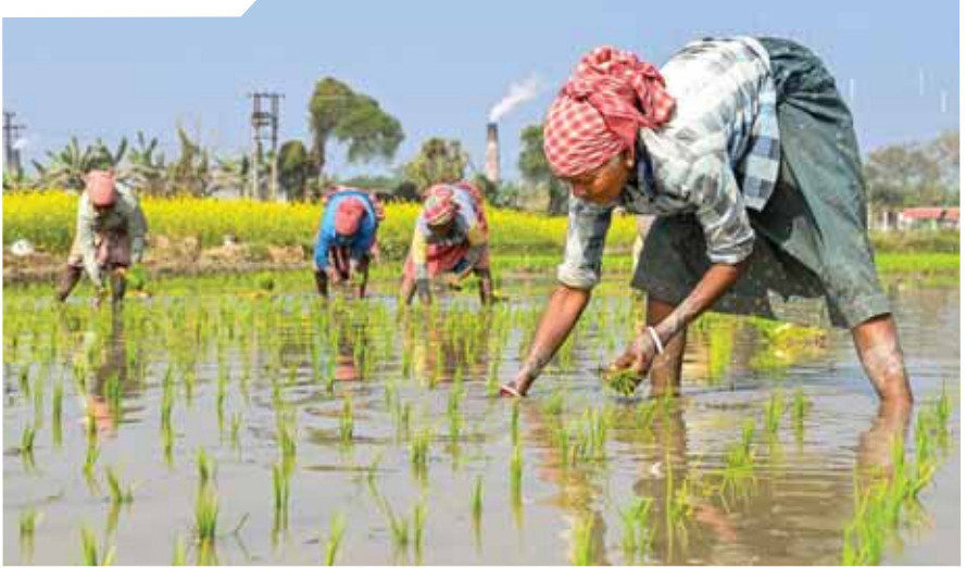
Farmers plant paddy saplings in a field, in Nadia