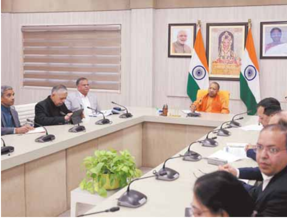
Chief Minister Yogi Adityanath chairing a meeting on Tuesday

Chief Minister Yogi Adityanath on Tuesday directed the officials to ensure robust health arrangements across the state to safeguard public health during the ongoing cold wave, the Uttar Pradesh government said in a statement. Addressing a high-level meeting on Tuesday, the chief minister emphasised the need for special precautions to protect the vulnerable groups, including the elderly, children and pre-existing conditions, as cold-related ailments such as cough, fever and respiratory issues are expected to rise. Reviewing the healthcare arrangements for the Maha Kumbh Mela pilgrims, he stressed the need for proper medical facilities in all sectors, including readily available ambulance services. Adityanath also directed the Health department teams to conduct regular visits to Prayagraj to monitor the condition of pilgrims and provide necessary medical assistance promptly. "Everyone should receive appropriate care when dealing with seasonal ailments or severe conditions," he said. The chief minister's directions assume importance in the backdrop of a few cases of HMPV (human metapneumovirus) detected in some states. Adityanath instructed that all