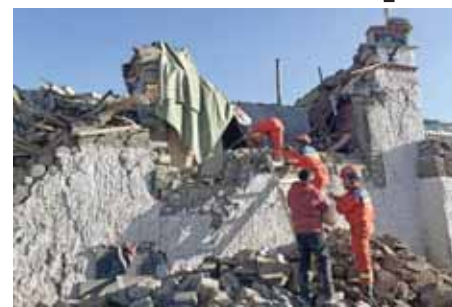
Rescue workers search for survivors in the aftermath of an earthquake in Changsuo Township of Dingri in Xigaze, southwestern China's Tibet Autonomous Region.

A 6.8-magnitude earthquake struck near one of Tibet's holiest cities on Tuesday, killing at least 95 people and injuring 130 others with tremors also shaking buildings and forcing people to run to the streets in neighbouring Nepal. According to regional disaster relief headquarters, the quake jolted Dingri County in Xigaze in Tibet Autonomous Region in China at 9:05 am Tuesday (Beijing Time). The US Geological Service, however, put the quake's magnitude at 7.1. At least 95 people have been confirmed dead and 130 others injured as of 3 p.m. Tuesday (local time), state-run Xinhua news agency reported. Chinese President Xi Jinping has ordered all-out rescue efforts to carry out relief and rescue operations in the affected areas. Xi ordered utmost efforts to treat the injured and urged efforts to prevent secondary