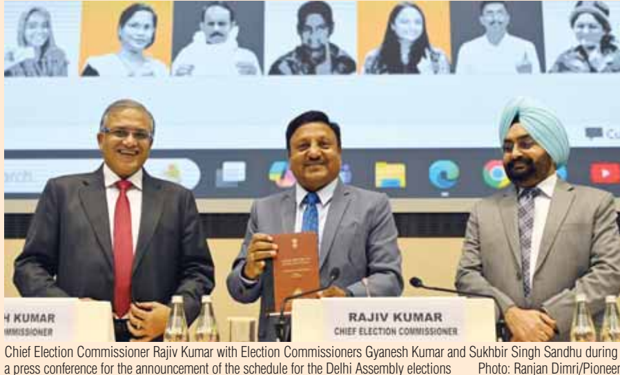
Chief Election Commissioner Rajiv Kumar with Election Commissioners Gyanesh Kumar and Sukhbir Singh Sandhu during a press conference for the announcement of the schedule for the Delhi Assembly elections.

With an announcement of the 70 assembly seats in Delhi in a single phase on February 5 and the votes will be counted on February 8 by the Election Commission (EC), the stage is set for a fierce triangular contest between the incumbent Aam Aadmi Party (AAP), the Bharatiya Janata Party (BJP), and the Congress. The battle lines are drawn between Prime Minister Narendra Modi's developmental model versus the 'freebies' model touted by the AAP chief and former Chief Minister Arvind Kejriwal, who is eyeing a hat-trick, having swept the 2015 and 2020 elections with 67 and 62 seats, respectively. The AAP faces anti-incumbency, corruption allegations and an aggressive BJP in its bid to assume power for a third successive term. The Congress will be keen to regain the national Capital. Although the Congress and the AAP contested the 2024 Lok Sabha elections together as part of the INDIA bloc, they will be competing separately in the upcoming Assembly polls. Announcing the dates for the Assembly polls in Delhi, Chief Election Commissioner Rajiv Kumar said "It is a single-phase election... We have deliberately kept polling on a Wednesday so more people come out to vote... like we did in Maharashtra. The entire election process will be completed by February 10." With the EC's announcement of the election schedule, the