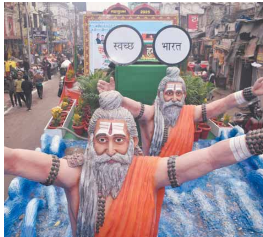
Swachhata Rath Yatra launched in Prayagraj to promote cleanliness and raise public awareness, drawing significant community participation

To achieve this, 30 uniquely crafted arches, inspired by mythological themes, have been constructed. Talented artisans from various parts of Uttar Pradesh have worked tirelessly to bring these majestic structures to life. Upon entering Mahakumbh Nagar, devotees will witness a stunning display of mythological events. The 14 gems from the Samudra Manthan, including Airavat, Kamdhenu Cow, Kaustubh Mani, Kalpavriksha, Rambha Apsara, Mahalakshmi, Moon, Sharang Bow, Conch, Dhyanvanti, and Amrit, will welcome the pilgrims in the form of well-adorned gates. A major attraction will be the colossal Nandi gate and a giant Damru of Bhole Bhandari, measuring an impressive 100 feet in length and over 50 feet in height, officials added. A large team of artisans is currently giving finishing touches to this masterpiece. Additionally, 30 other specially crafted arch gates, including the Samudra Manthan and Kachhapa gates, continue to reflect rich mythological symbolism, adding to the divine aura of the event. CM Yogi aims to present the Maha Kumbh as a global spiritual marvel, setting an exam-