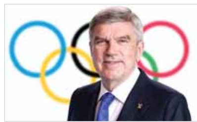
now we have this unfortunate situation that these two athletes are considered to be transgender. But they are Not."

over the world." The IOC has defended female boxers Imane Khelif and Lin Yu-ting — the Paris Olympic gold medalists. Both had been disqualified from the 2023 world championships run by the Russian-backed International Boxing Association, which said they failed eligibility tests. "These two women boxers have been born as women, they have been raised as women, they have competed as women and nobody ever claimed even that they are transgender," Bach said in AP's interview. "What happened there was a Russian-led misinformation campaign which then distorted the truth, the facts and now we have this unfortunate situation that these two athletes are considered to be transgender. But they are Not." Before the Paris Olympics, Bach warned of "deeply disturbing" trends, including "narrow self-interests trumping the rule of law."