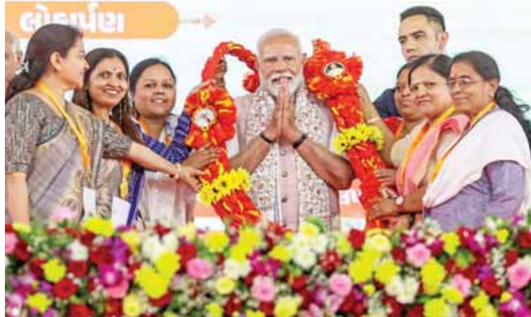
Prime Minister Narendra Modi during the launch of development works in Navsari, Gujarat

Air India responded amid public outrage and claimed that at no point was the wheelchair or any assistance denied to the passenger. Issuing a detailed statement after investigating the incident, Air India on Saturday said the family members accompanying the passenger had reported at the PRM (Person with Reduced Mobility) desk located near Air India's ticketing office less than 90 minutes before the scheduled time of departure to request for a wheelchair. "Due to the unprecedented peak demand at that hour, a wheelchair could not be made available within the 15 minutes that the passenger's relatives spent waiting for it," the airline said, adding that the claims of having waited for an hour for the wheelchair are baseless. On their own accord, the passenger decided to walk along with those accompanying her. She unfortunately suffered a fall in the airport premises. Upon noticing the incident, officials of the Delhi Airport, as well as the airport doctor immediately attended to her. "Upon reaching Bengaluru, the guest was escorted by our staff for further medical attention. At no point was the wheelchair or any assistance denied. Air India's staff cooperated with the guests through their journey. We have reached out to the guest's family and pray for her wellbeing," the airline said.