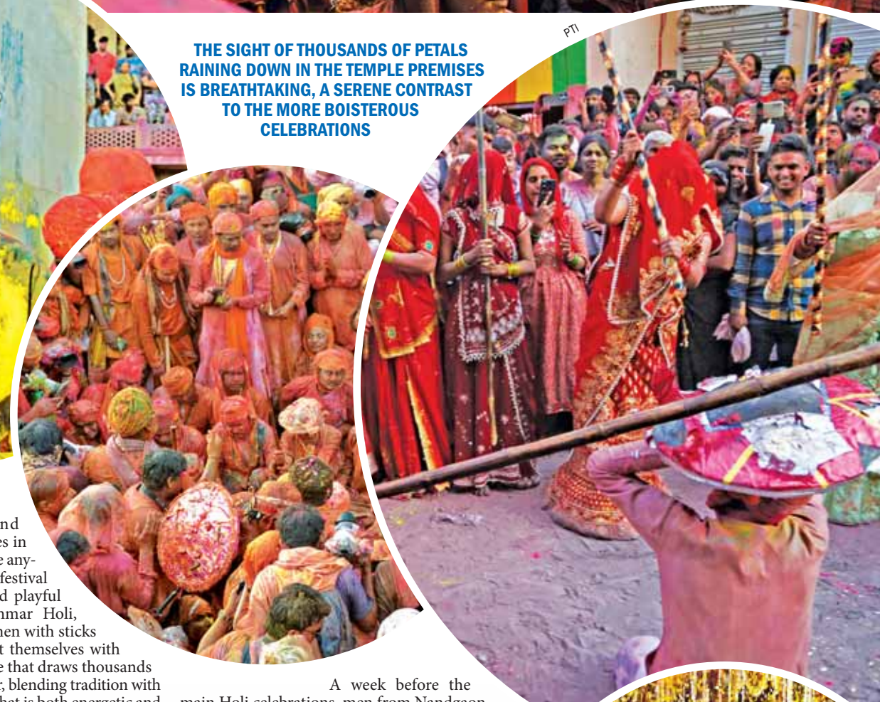
THE SIGHT OF THOUSANDS OF PETALS RAINING DOWN IN THE TEMPLE PREMISES IS BREATHTAKING, A SERENE CONTRAST TO THE MORE BOISTEROUS CELEBRATIONS