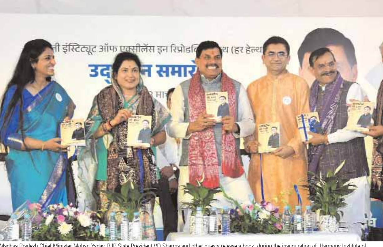
Madhya Pradesh Chief Minister Mohan Yadav, BJP State President VD Sharma and other guests release a book during the inauguration of Harmony Institute of Excellence in Reproductive Health in Bhopal on Saturday.