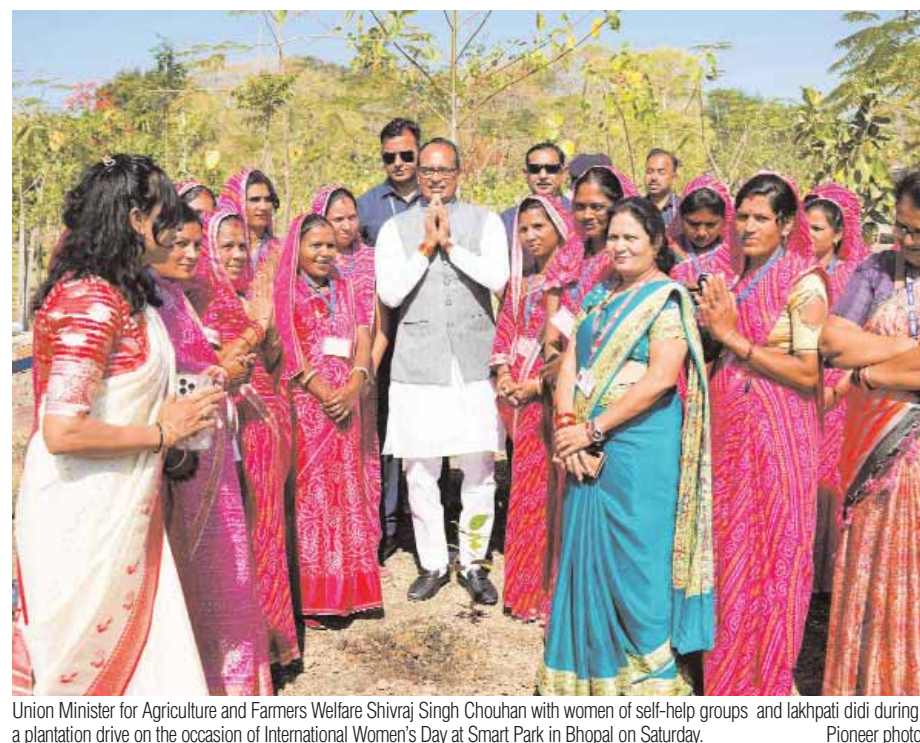
Union Minister for Agriculture and Farmers Welfare Shivraj Singh Chouhan with women of self-help groups and lakhpatti didi during a plantation drive on the occasion of International Women's Day at Smart Park in Bhopal on Saturday.

gressing under the Chief Minister's leadership. Gaur also underscored the role of young athletes as the future of the nation, urging them to work with dedication and patriotism.