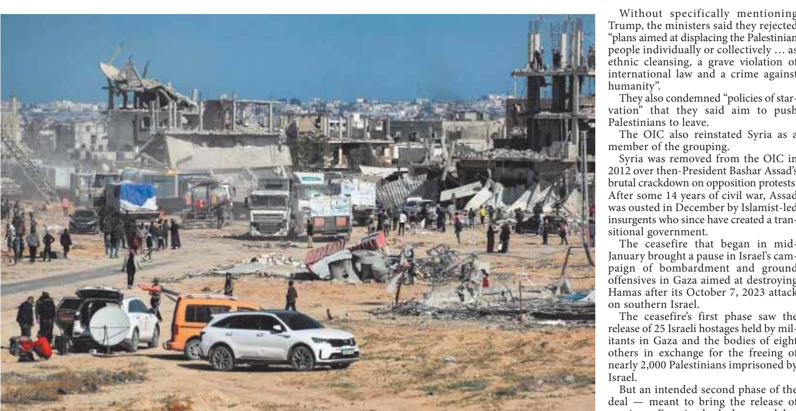
A large photograph showing a destroyed urban area in Gaza with rubble, damaged buildings, and people walking through the debris.

PRESS TRUST OF INDIA ■ Deir Al-Balah Foreign ministers from Muslim nations on Saturday rejected calls by US President Donald Trump to empty the Gaza Strip of its Palestinian population and backed a plan for an administrative committee of Palestinians to govern the territory to allow reconstruction to go ahead.