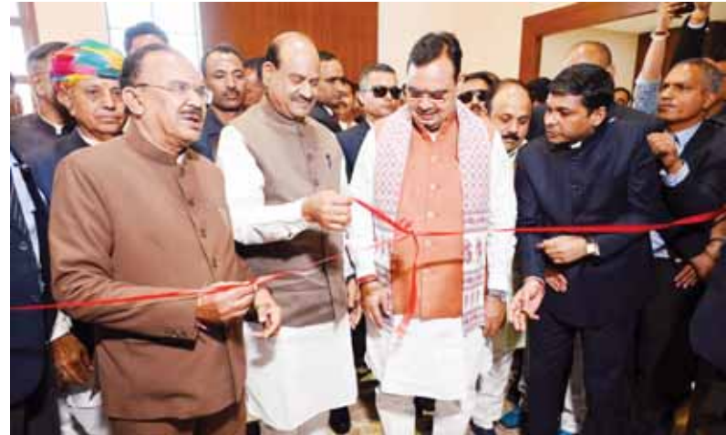
Lok Sabha Speaker Om Birla, Rajasthan CM Bhajanlal Sharma at the launch of Constitution Club of Rajasthan in Jaipur.

Birla hoped that the club will elevate policy-making and good governance to new heights. He mentioned that the concept of the Constitution Club in Delhi was conceived in 1947 during the drafting of