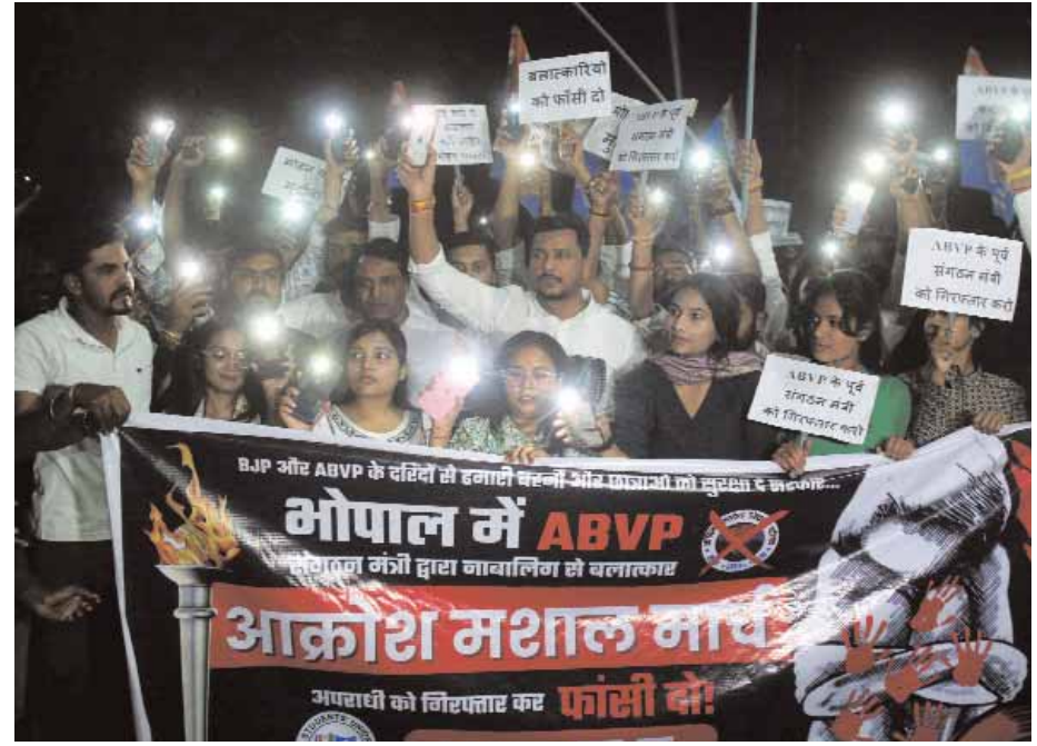
National Students Union of India (NSUI) activists during a torch rally to protest against the incident of an alleged rape with a tribal girl by an ABVP former office-bearer recently, in Bhopal on Saturday.