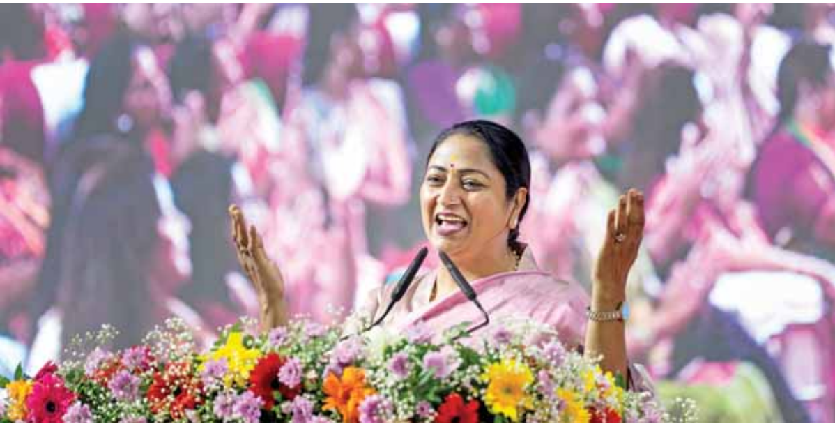
Delhi CM Rekha Gupta speaks during a felicitation programme organised to mark International Women's Day at Jawahar Lal Nehru Stadium

PUBLISHED FROM: DELHI LUCKNOW BHOPAL BHUBANESWAR RANCHI RAIPUR CHANDIGARH DEHRADUN HYDERABAD VIJAYWADA