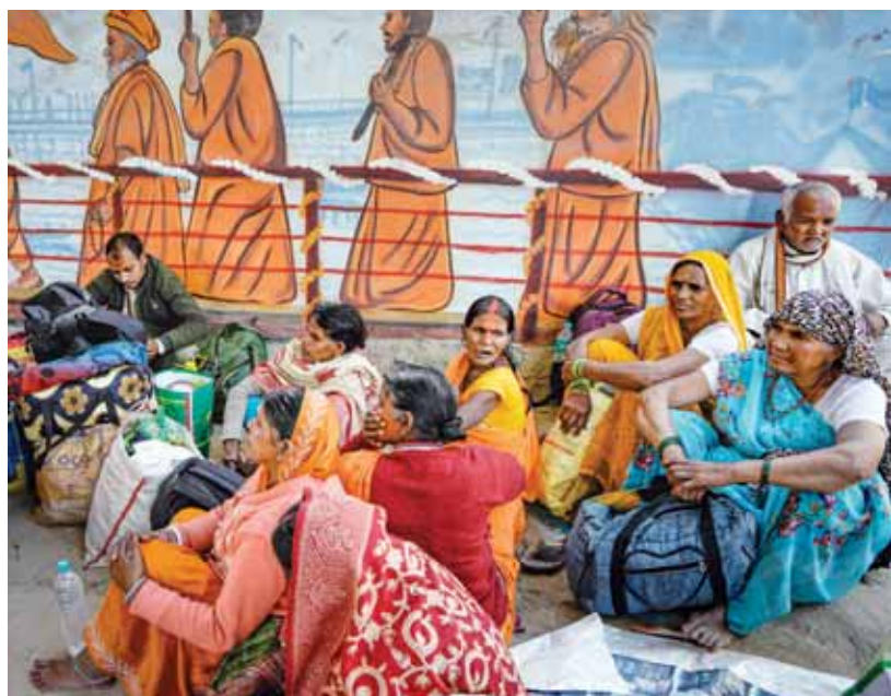
Devotees gather during Maha Kumbh Mela in Prayagraj in Uttar Pradesh

Somewhere between the chaotic railway station and the sacred waters, he dis-