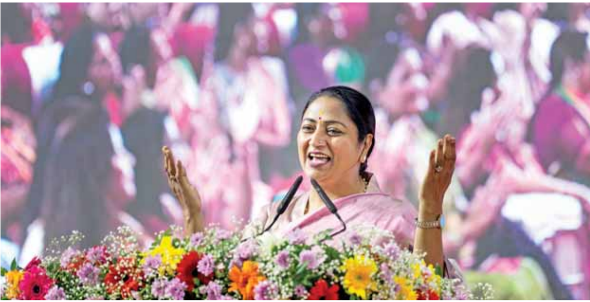
Delhi CM Rekha Gupta speaks during a felicitation programme organised to mark International Women's Day at Jawahar Lal Nehru Stadium