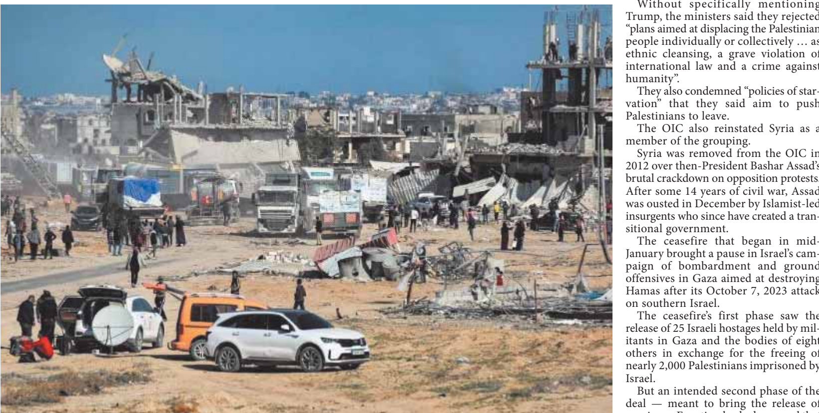
The devastation in Gaza following the Israeli military offensive, with many buildings destroyed and people struggling to survive in the rubble.