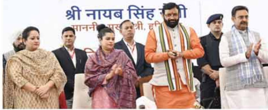
श्री नायब सिंह साहनी, माननीय मुख्यमंत्री, हरियाणा

आपकी बेटी हमारी बेटी के लिए एमआईएस पोर्टल