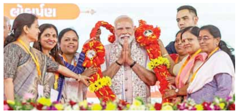
Prime Minister Narendra Modi during the launch of development works in Navsari, Gujarat

Prime Minister Narendra Modi on Saturday said his government has given topmost priority to women's safety and framed stricter laws and rules to prevent crimes against them, besides making a provision for capital punishment to those indulging in heinous crimes like rape. The Bharatiya Nyaya Sanhita (BNS), which replaced the colonial-era criminal law (Indian Penal Code), has strengthened the legal provisions related to women's safety and made filing of complaints easier and delivery of justice faster, he said. Addressing a huge gathering at Vansi Borsi village in Navsari district of Gujarat on International Women's Day, Prime Minister Narendra Modi said that India is walking on the path of women-led development for rapid progress of the country. A security cover comprising only women police personnel was deployed at the event to mark International Women's Day.