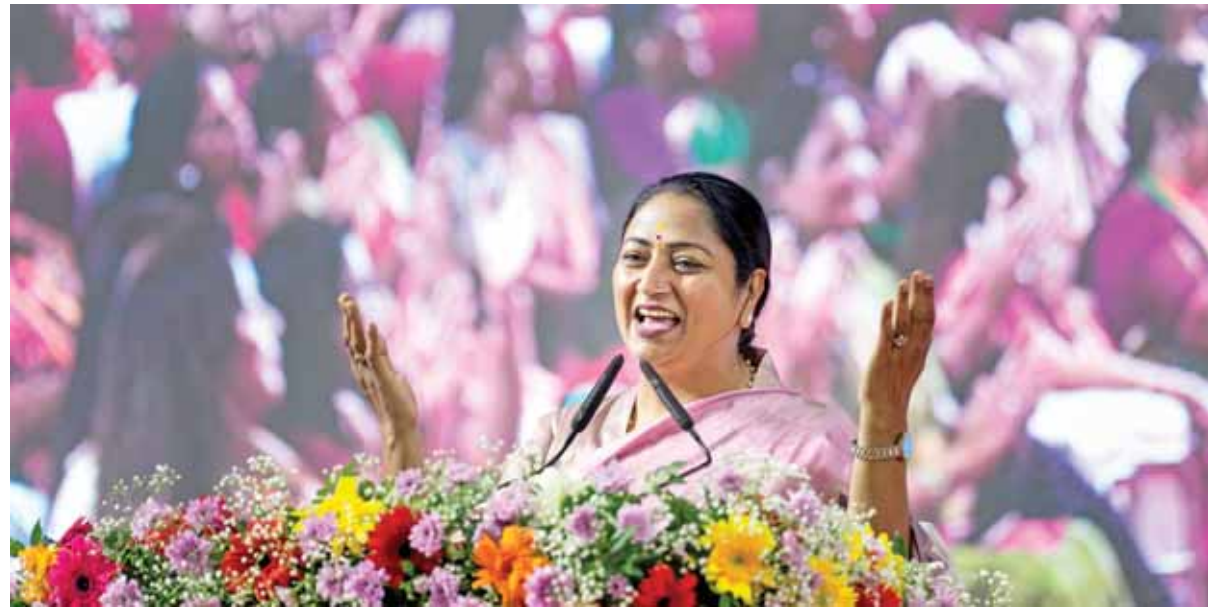
Delhi CM Rekha Gupta speaks during a felicitation programme organised to mark International Women's Day at Jawahar Lal Nehru Stadium