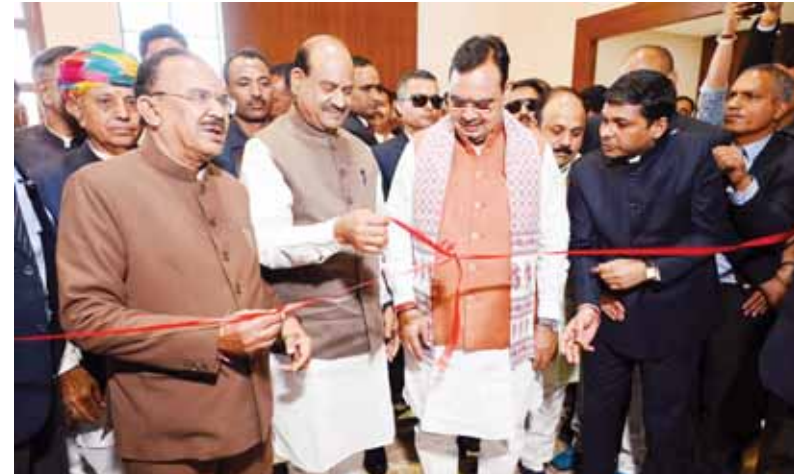
Lok Sabha Speaker Om Birla, Rajasthan CM Bhajanlal Sharma at the launch of Constitution Club of Rajasthan in Jaipur.

Birla hoped that the club will elevate policy-making and good governance to new heights. He mentioned that the concept of the Constitution Club in Delhi was conceived in 1947 during the drafting of