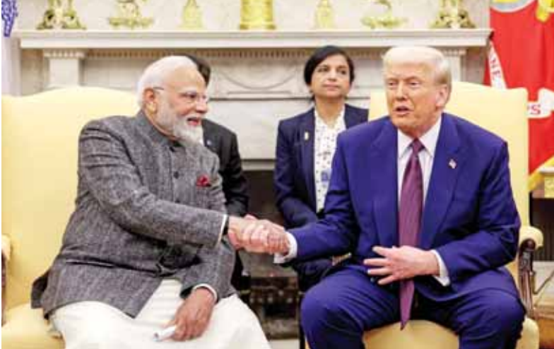
Prime Minister Narendra Modi during a meeting with US President Donald Trump at the White House in Washington

PRESS TRUST OF INDIA ■ New York/Washington