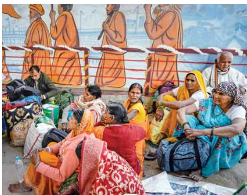
Devotees gather during Maha Kumbh Mela in Prayagraj in Uttar Pradesh

Somewhere between the chaotic railway station and the sacred waters, he dis-