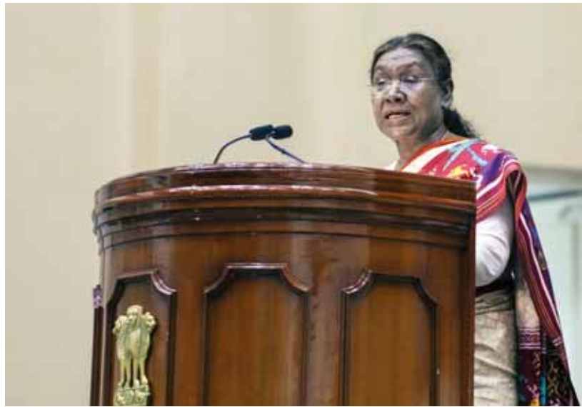
Droupadi Murmu speaks during inaugural session of 'Nari Shakti Se Viksit Bharat' in New Delhi.

"Is not society responsible for the well-being of the children who will shape our