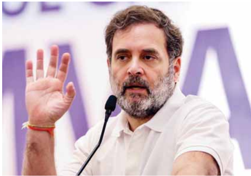
Congress leader Rahul Gandhi addresses party workers and pre-civil elections candidates in Ahmedabad

"For our district, block presidents and senior leaders, the party should find a place in their hearts. They should carry Congress in their blood. Put the issue of