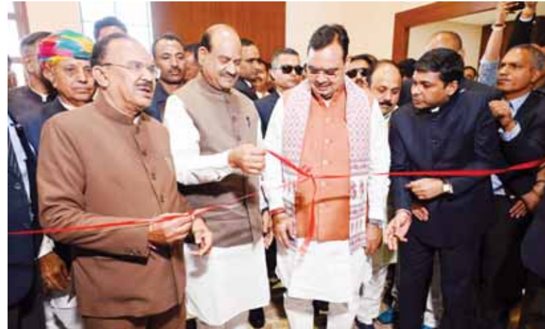
Lok Sabha Speaker Om Birla, Rajasthan CM Bhajanlal Sharma at the launch of Constitution Club of Rajasthan in Jaipur.

Birla hoped that the club will elevate policy-making and good governance to new heights. He mentioned that the concept of the Constitution Club in Delhi was conceived in 1947 during the drafting of