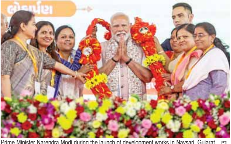
Prime Minister Narendra Modi during the launch of development works in Navsari, Gujarat