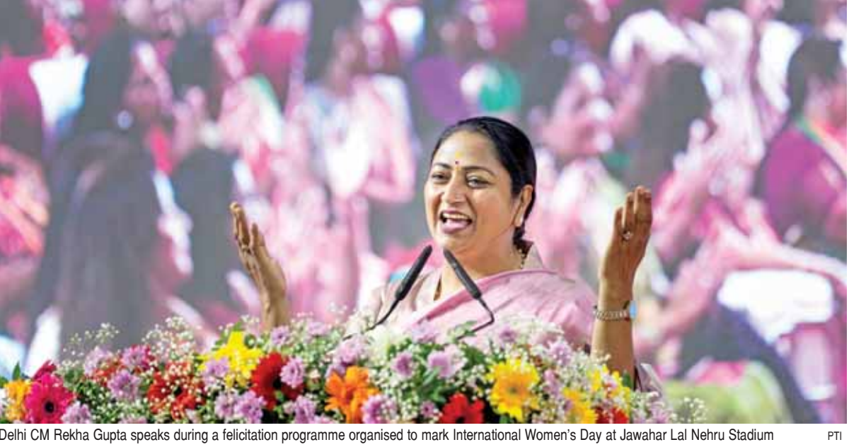
Delhi CM Rekha Gupta speaks during a felicitation programme organised to mark International Women's Day at Jawahar Lal Nehru Stadium