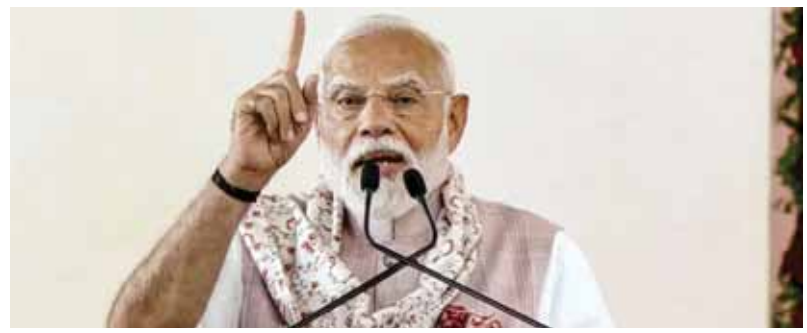
Prime Minister Narendra Modi.

With over three decades of experience, Agarwal has led accessibility audits and policy advocacy efforts to improve infra-