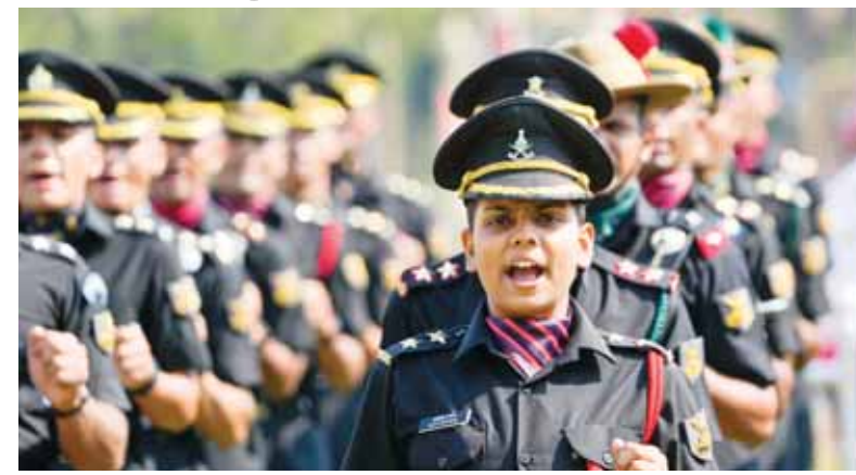
Cadets celebrate during their passing out parade at the Officers Training Academy in Chennai on Saturday