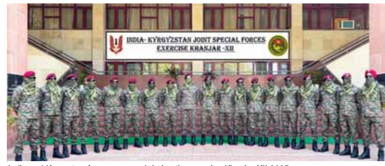
India and Kyrgyzstan Army personnel during the exercise Khanjar-XII 2025

The report also said that because of the variability, a statistical analysis of water quality data of various monitoring locations for the key parameters was undertaken from January 12 to February 22 at