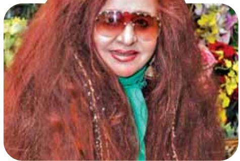
IN CONVERSATION WITH SHAHNAZ HUSAIN

To illuminate the path to healthy skin, we turned to Shahnaz Husain, a luminary in Ayurvedic beauty. She offers invaluable guidance for the time-pressed woman, revealing swift self-care practices, nature's potent remedies, and crucial skincare components. Husain champions a holistic approach, advocating for herbal solutions and stressing the imperative of prioritising personal wellness amidst life's relentless pace.