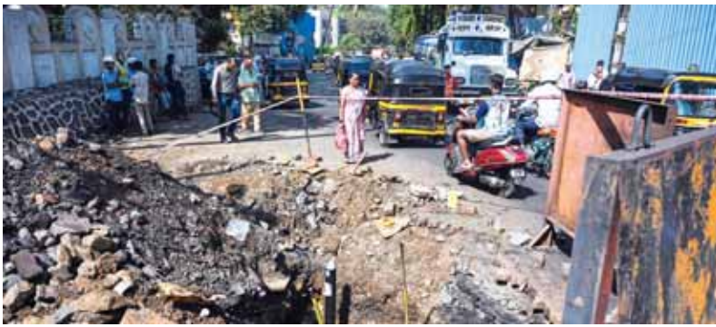
Repair work underway after leaking of a gas pipeline in Mumbai