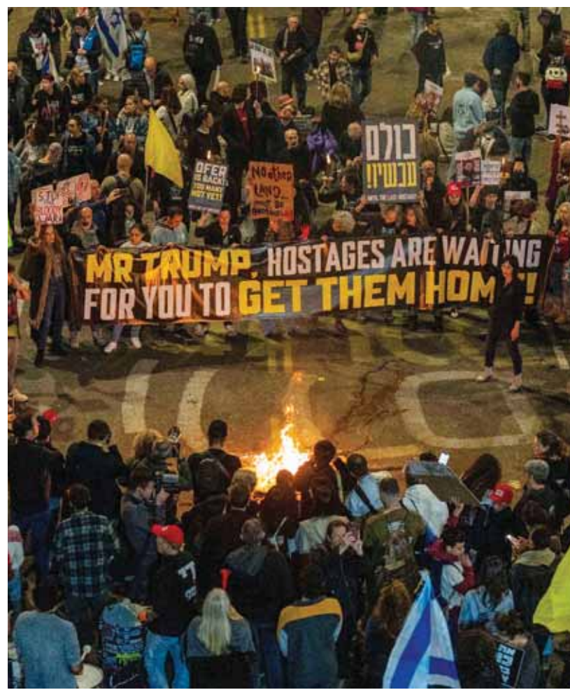
People take part in a protest in Tel Aviv, Israel, on Saturday, demanding the immediate release of hostages held by Hamas in the Gaza Strip

The foreign ministers of France, Germany, Italy and the United Kingdom said in a joint statement that they welcome the Arab initiative for a Gaza reconstruction plan, calling it "a realistic path." They added that "Hamas must neither govern Gaza nor be a threat to Israel anymore," and they support the central role for the PA. Early Saturday, an Israeli strike killed two Palestinians in the southernmost city of Rafah, the Health Ministry there said. The Israeli military said that it struck several men who appeared to be flying a drone that entered Israel. Israel's military offensive has killed more than 48,000 Palestinians in Gaza, mostly women and children, according to Gaza's Health Ministry, which doesn't say how many of the dead were militants. Hamas' attack in October 2023 killed around 1,200 people, mostly civilians, inside Israel and took 251 people hostage. Most have been released in ceasefire agreements or other arrangements. The militants also hold the remains of a soldier killed in the 2014 war.