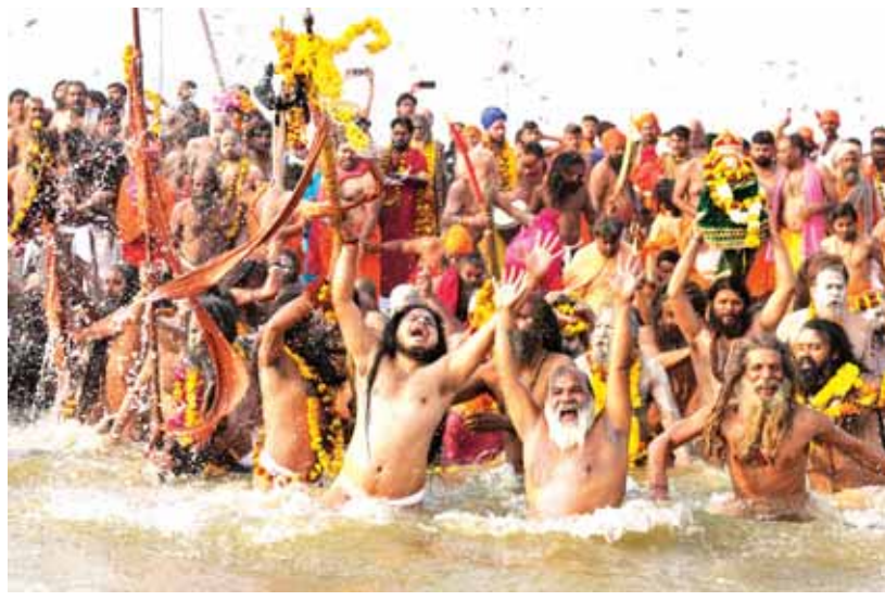
Sadhus take holy dip at Triveni Sangam during Maha Kumbh in Prayagraj

The DO or the amount of oxygen in water, BOD, which measures the amount of oxygen needed to break down organic