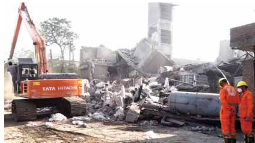
Rescue work underway after a multi-storey building of a textile factory collapsed in Ludhiana

One more worker died in the factory building collapse here, while the rescue operation was still on, as another worker was stated to be trapped under the debris, officials said on Sunday. The worker's body was brought out from under the debris on Sunday, taking the death toll in the incident to two, they said. On Saturday evening, a worker was killed after the building of a textile factory collapsed in the focal point area here. Two teams of National Disaster Response Force (NDRF), along with police, fire brigade and the municipal corporation, were undertaking the rescue operation, the officials said. Sources said repair work was being taken up in the factory when a pillar gave way. An eyewitness on Saturday said a loud sound was heard before the building caved in. On Sunday, Deputy Commissioner Jitendra Jorwal said that two workers have died in the incident. The rescue operations are still going on to locate one worker who is stated to be