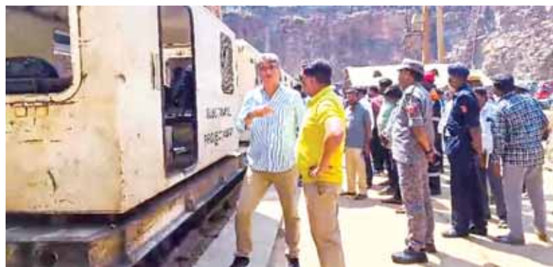
Rescue operation underway to trace workers trapped inside SLBC tunnel in Nagarkurnool