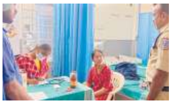
Rachakonda Police visiting the students who fell sick

Over 200 students from Narayana IIT Academy, Kuntloor, and Narayana Junior College reportedly fell ill after consuming aloo kurma and chapati for dinner on Saturday night. The students experienced severe vomiting and stomach pain, prompting the college