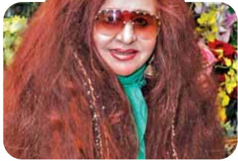
IN CONVERSATION WITH SHAHNAZ HUSAIN

To illuminate the path to healthy skin, we turned to Shahnaz Husain, a luminary in Ayurvedic beauty. She offers invaluable guidance for the time-pressed woman, revealing swift self-care practices, nature's potent remedies, and crucial skincare components. Husain champions a holistic approach, advocating for herbal solutions and stressing the imperative of prioritising personal wellness amidst life's relentless pace.