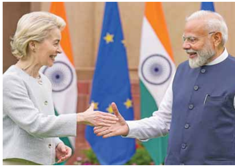
Prime Minister Narendra Modi and President of the European Commission Ursula von der Leyen at the Hyderabad House