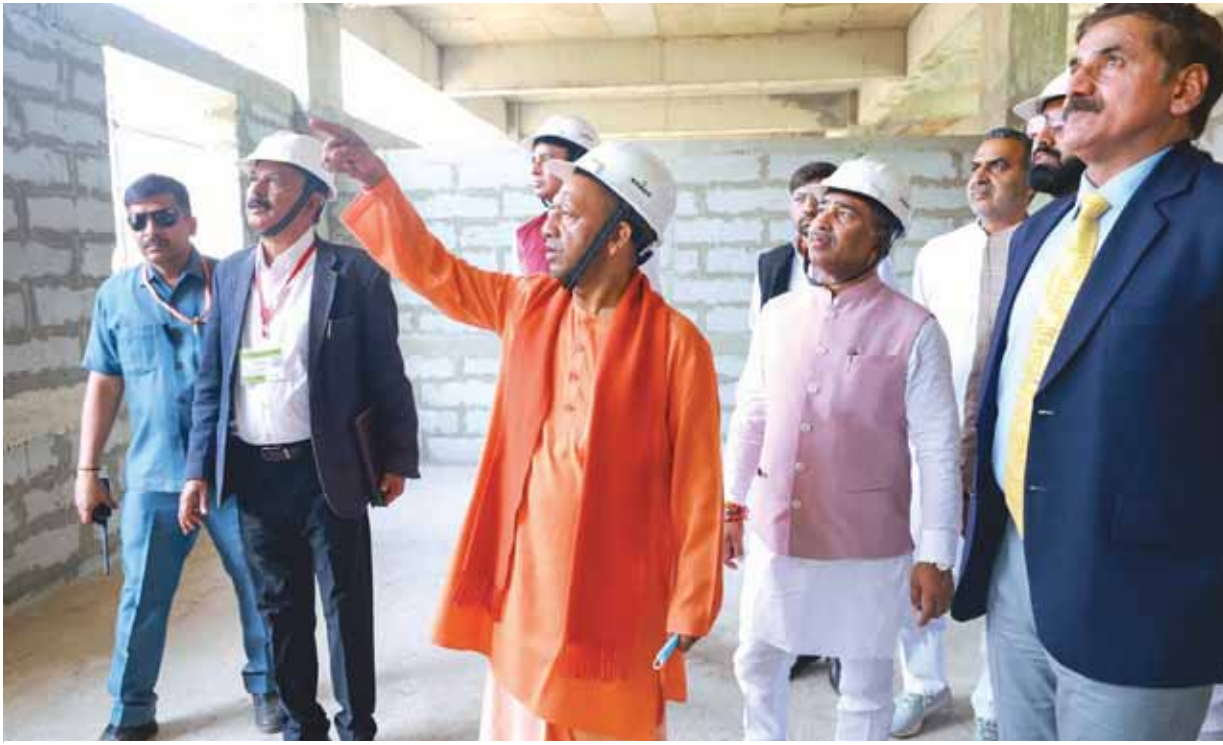
Uttar Pradesh Chief Minister Yogi Adityanath during inspection of the under-construction Major Dhyanchand Sports University, Meerut, on Sunday

He said, "The nation's first rapid rail service has been launched between Delhi and Meerut, complementing the existing 12-lane expressway. Additionally, the Ganga Expressway, which will connect Meerut to Lucknow and Prayagraj, is nearing completion. This year's budget has been allocated to extend the expressway from Meerut to Haridwar to strengthen connectivity further. Following the successful infrastructure development in Prayagraj, special attention is now being focused on Meerut." The chief minister also discussed key urban issues such as the inner ring road, traffic congestion, vending zones, sewerage, drainage, and solid