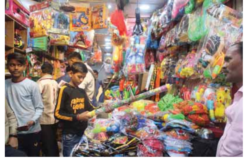
People shop for colours and other essentials ahead of Holi