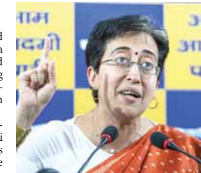
Leader of Opposition Atishi addresses press conference in New Delhi

In a video on X, Atishi said, "During election campaign, Prime Minister Narendra Modi had promised ₹2,500 to