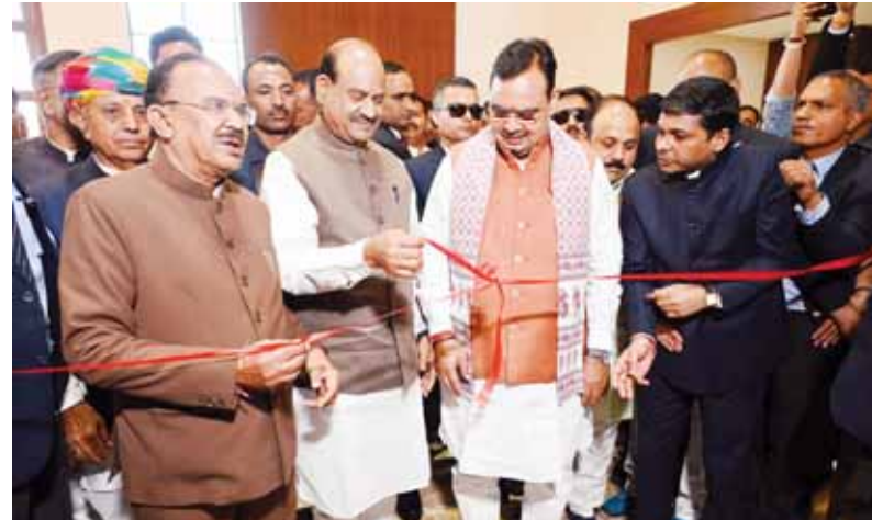
Lok Sabha Speaker Om Birla, Rajasthan CM Bhajanlal Sharma at the launch of Constitution Club of Rajasthan in Jaipur.

Birla hoped that the club will elevate policy-making and good governance to new heights. He mentioned that the concept of the Constitution Club in Delhi was conceived in 1947 during the drafting of