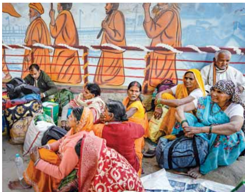
Devotees gather during Maha Kumbh Mela in Prayagraj in Uttar Pradesh

Somewhere between the chaotic railway station and the sacred waters, he dis-