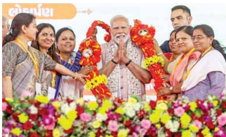
Prime Minister Narendra Modi during the launch of development works in Navsari, Gujarat

Air India responded amid public outrage and claimed that at no point was the wheelchair or any assistance denied to the passenger. Issuing a detailed statement after investigating the incident, Air India on Saturday said the family members accompanying the passenger had reported at the PRM (Person with Reduced Mobility) desk located near Air India's ticketing office less than 90 minutes before the scheduled time of departure to request for a wheelchair. "Due to the unprecedented peak demand at that hour, a wheelchair could not be made available within the 15 minutes that the passenger's relatives spent waiting for it," the airline said, adding that the claims of having waited for an hour for the wheelchair are baseless. On their own accord, the passenger decided to walk along with those accompanying her. She unfortunately suffered a fall in the airport premises. Upon noticing the incident, officials of the Delhi Airport, as well as the airport doctor immediately attended to her. "Upon reaching Bengaluru, the guest was escorted by our staff for further medical attention. At no point was the wheelchair or any assistance denied. Air India's staff cooperated with the guests through their journey. We have reached out to the guest's family and pray for her wellbeing," the airline said.