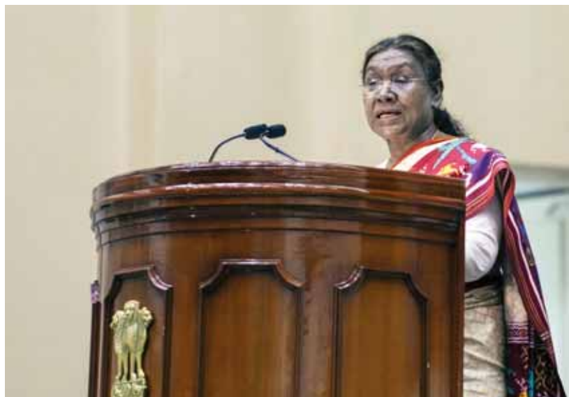
Droupadi Murmu speaks during inaugural session of 'Nari Shakti Se Viksit Bharat' in New Delhi.

"Is not society responsible for the well-being of the children who will shape our