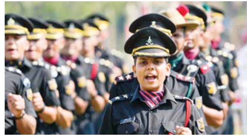
Cadets celebrate during their passing out parade at the Officers Training Academy in Chennai on Saturday