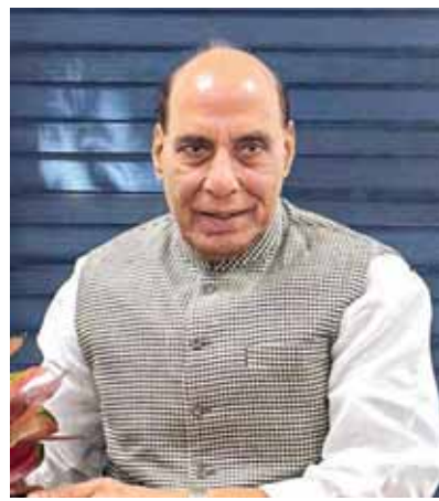
Union Defence Minister Rajnath Singh