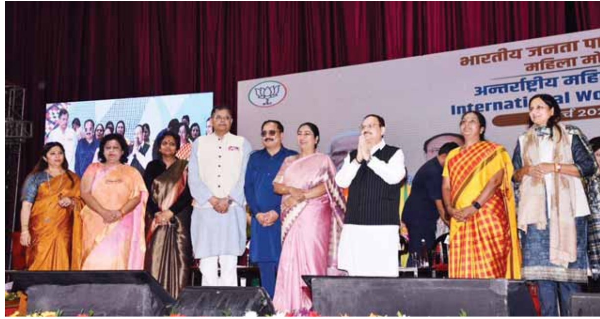
BJP national president JP Nadda along with Delhi CM Rekha Gupta

Delhi Chief Minister Rekha Gupta, addressing the gathering, said the BJP has