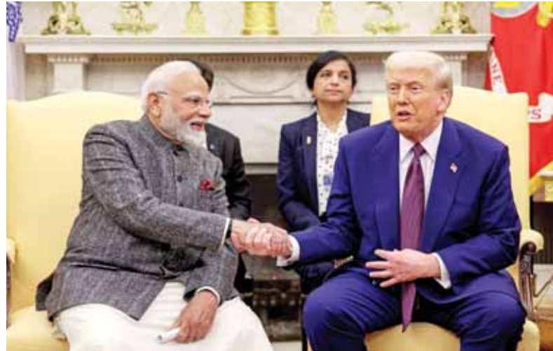
Prime Minister Narendra Modi during a meeting with US President Donald Trump at the White House in Washington

PRESS TRUST OF INDIA ■ New York/Washington