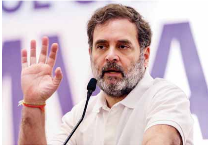
Congress leader Rahul Gandhi addresses party workers and pre-civil elections candidates in Ahmedabad

"For our district, block presidents and senior leaders, the party should find a place in their hearts. They should carry Congress in their blood. Put the issue of