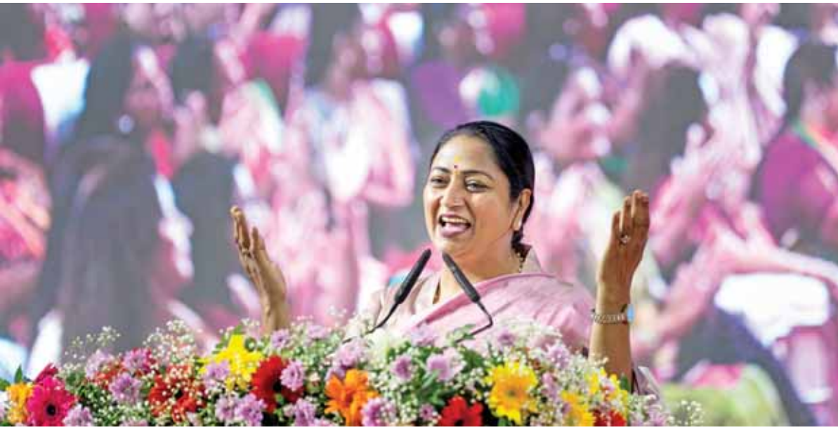
Delhi CM Rekha Gupta speaks during a felicitation programme organised to mark International Women's Day at Jawahar Lal Nehru Stadium

PUBLISHED FROM: DELHI LUCKNOW BHOPAL BHUBANESWAR RANCHI RAIPUR CHANDIGARH DEHRADUN HYDERABAD VIJAYWADA