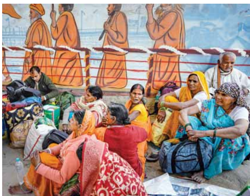
Devotees gather during Maha Kumbh Mela in Prayagraj in Uttar Pradesh

Somewhere between the chaotic railway station and the sacred waters, he dis-