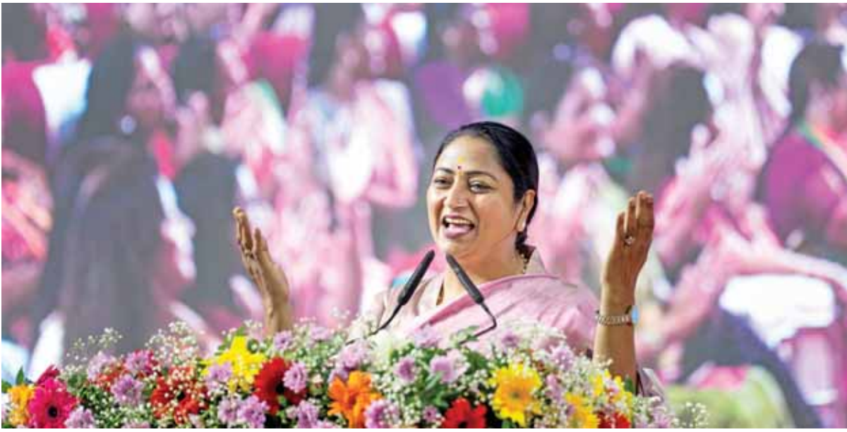
Delhi CM Rekha Gupta speaks during a felicitation programme organised to mark International Women's Day at Jawahar Lal Nehru Stadium