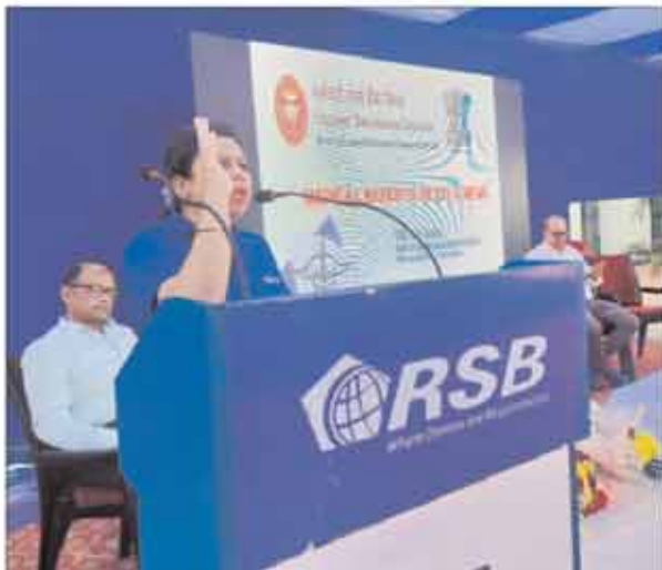
PNS : JAMSHEDPUR

The Employees' State Insurance Corporation (ESIC) and RSB Global Plant 1, Gambhariya, organized a special awareness session on Saturday as part of the 74th ESIC Foundation Day and Special Service Fortnight, observed from February 24 to March 10.