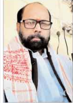
PNS : RANCHI