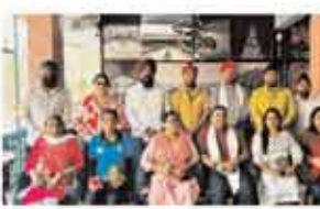
JAMSHEDPUR