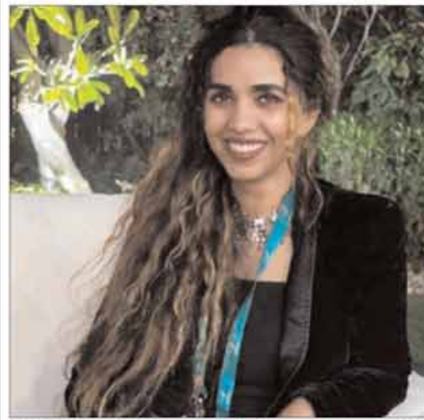
BY RACHNA TIWARI

India's beauty landscape is undergoing a profound transformation. The era of heavy, multi-layered skincare routines is fading, giving way to the rise of the "clean skin" movement—an approach that prioritizes simplicity, transparency, and gentle, effective ingredients. This shift is not just a passing trend but a lucrative business opportunity, particularly for innovative startups looking to make their mark.