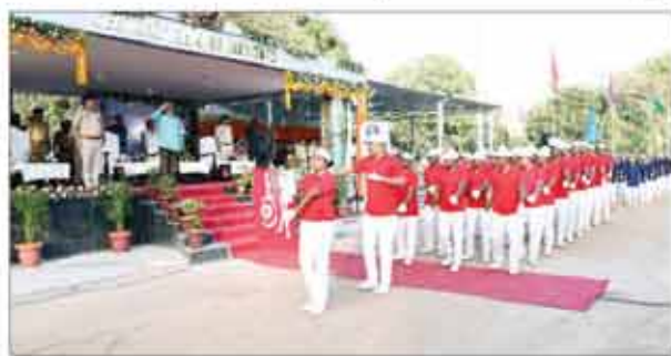
Chief Minister Hemant Soren inspects a parade on the occasion of the closing ceremony of Jharkhand State Home Guard Corps and Fire Service Sports Competition-2025 organized at Central Training Institute, Home Guard Corps, Dhurva in Ranchi on Saturday.

The CM said that the personnel of Home Guard Corps and Fire Service cadre work as an integral part of the state government. Be it city or remote rural area, your activities continue continuously everywhere. All of you are engaged in serving the common people step by step with the state government.