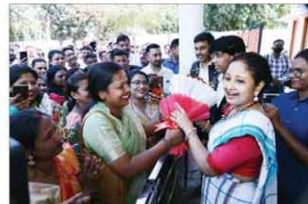
Women of various organisations meet Gandey MLA Kalpana Soren on the occasion of Women's Day in Ranchi on Saturday.

Kalpana Soren said that under the leadership of CM Hemant Soren, work is being done to give the women of the state their rights. Kalpana Soren said that day by day Jharkhand is moving in a positive direction. The state government has closely seen the