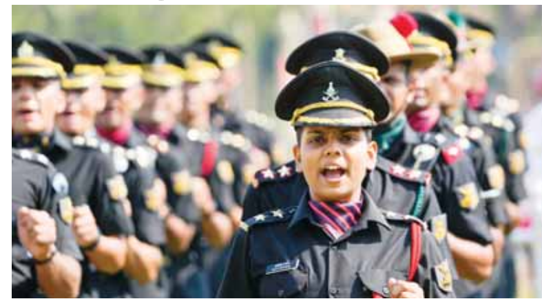
Cadets celebrate during their passing out parade at the Officers Training Academy in Chennai on Saturday