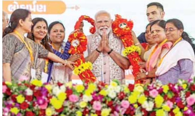
Prime Minister Narendra Modi during the launch of development works in Navsari, Gujarat