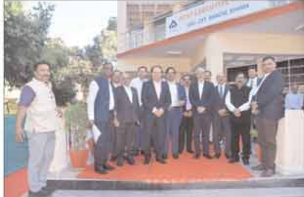
IEH has received a silver rating certificate from Indian Green Building Council (IGBC) under IGBC Green Existing Buildings O&M rating system. Key Features of the Green Building are:

This building known as the Ispat Executive hostel (IEH), is a 30 year old building which has been revamped to minimize its carbon footprint, showcasing SAIL's dedication to reducing its environmental impact. The building's innovative design and features ensure optimal energy efficiency, water conservation, and waste management.