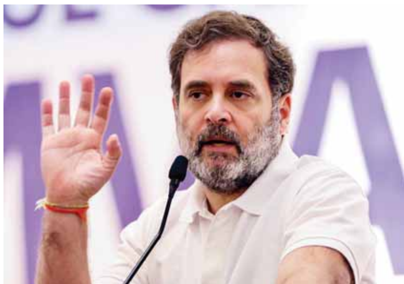
Congress leader Rahul Gandhi addresses party workers and pre-civil elections candidates in Ahmedabad

"For our district, block presidents and senior leaders, the party should find a place in their hearts. They should carry Congress in their blood. Put the issue of