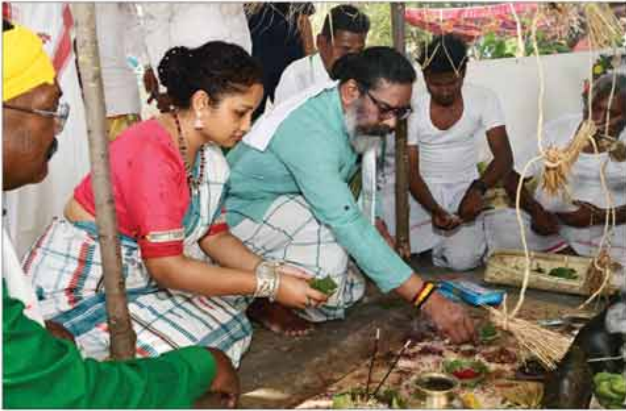
Chief Minister Hemant Soren with his wife and MLA Kalpana Soren offers prayers at Jaherthan on the occasion of Baha Parv at Jamshedpur on Saturday.

Baha Parv, a significant festival for the tribal communities, symbolizes reverence for nature, gratitude for a good harvest, and prayers for prosperity. The rituals at Jaherthan were conducted with deep spiritual fervor, reflecting the deep-rooted cultural traditions of the region. The Chief Minister, in his address, highlighted the importance of preserving