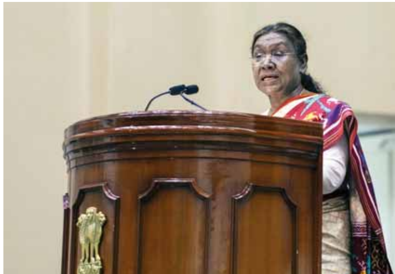
Droupadi Murmu speaks during inaugural session of 'Nari Shakti Se Viksit Bharat' in New Delhi.

"Is not society responsible for the well-being of the children who will shape our