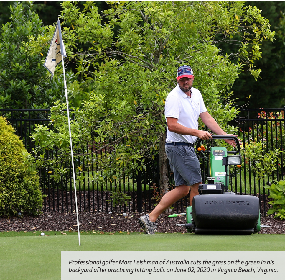
Professional golfer Marc Leishman of Australia cuts the grass on the green in his backyard after practicing hitting balls on June 02, 2020 in Virginia Beach, Virginia.

From a love of lawn to a highly prized golfing career, Marc Leishman has held onto his strong turf roots.