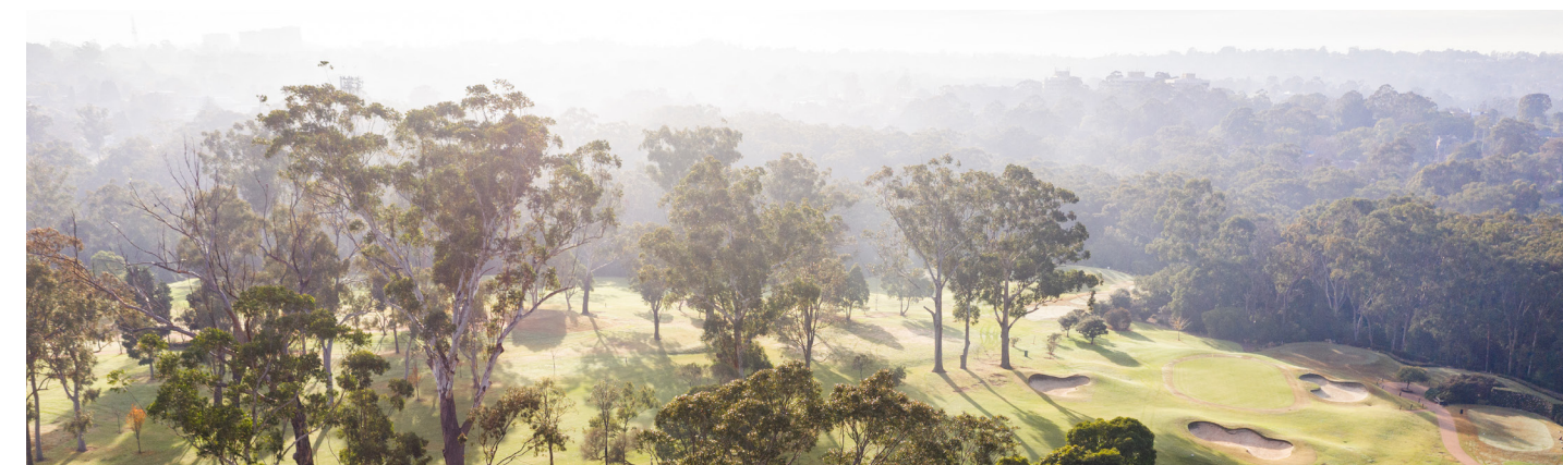
Oatlands Golf Club.