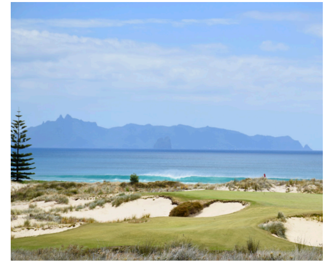
Looking across the 17 th green.

"The golf course is rated in the top tier in the continent and the rest of the world, so aligning our quality products and stellar dealer support makes for a very strong partnership."