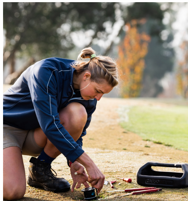
Women continue to drive change in turf management.

The Australian golf industry is leading the charge when it comes to equality and diversification with initiatives to encourage more women to choose turf management as a career.