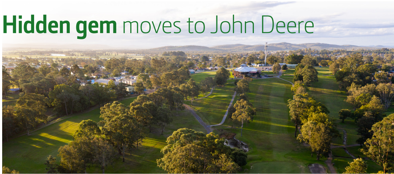
Muree Golf Course, a hidden gem.

Staff at a golf course tucked away in New South Wales' Hunter Region have a renewed attitude toward their turf management approach after reaping the rewards of an equipment update.