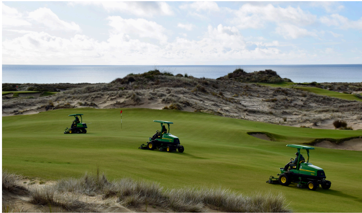
Tara Iti Golf Club with views of the beautiful Te Arai coast, just south of Mangawhai, New Zealand.