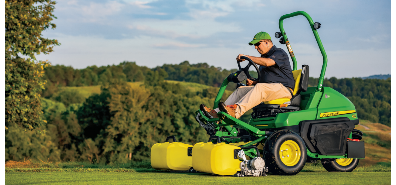
The 2700 and 2750 Triplex Mowers were designed to take the stress out of mowing.