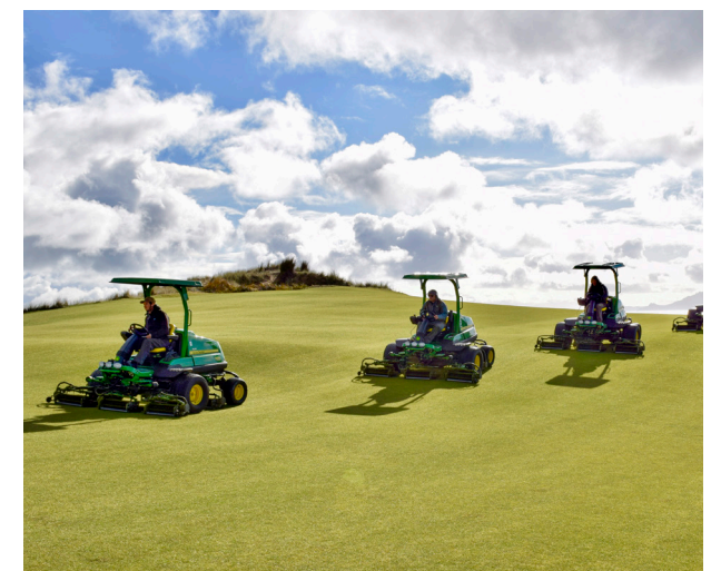
Mowing No. 12 fairway.