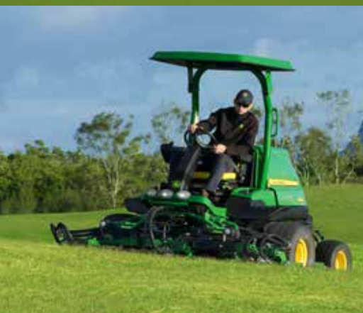
9009A Trim, Rough and Surrounds Mower