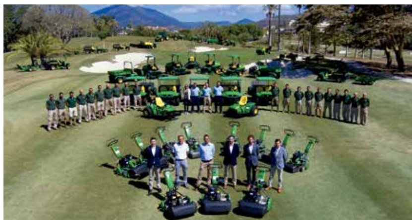
Real Club de Golf Las Brisas and John Deere staff with the new John Deere course maintenance equipment fleet. Drone video footage of the fleet line-up can be found on the Real Club de Golf Las Brisas website and on YouTube.

"We're confident we've made an excellent choice. Most importantly, the members are really happy with the improvements we've made and the way the course now plays."