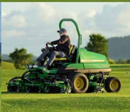
7700A PrecisionCut™ Fairway Mower