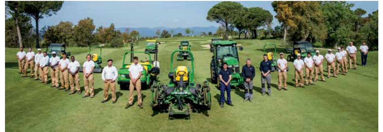
PGA Catalunya Resort near Girona in Spain signed its first ever five-year preferred equipment supplier agreement with John Deere to provide a fleet of 10 new Gator utility vehicles, as part of a three-year investment plan.

The European Tour Destination, renowned for its commitment to first-class course maintenance, had already been using John Deere 2500E Hybrid Electric Triplex Greens Mowers, 9009A TerrainCut™ Rotary Rough Mowers, 2030A ProGator Utility Vehicles equipped with HD200 low-profile amenity turf sprayers and TX Turf Gators.