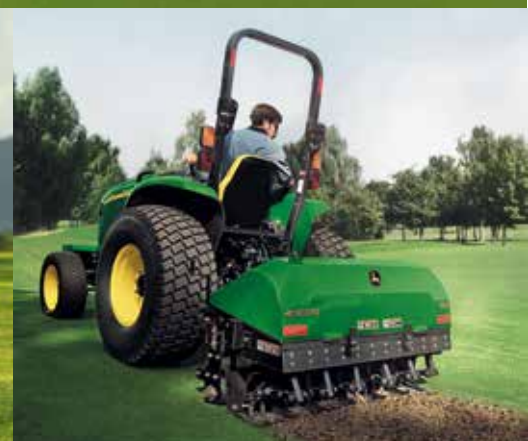
Aercore™ 1500 Aerator