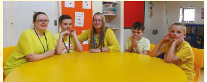
Class 2 on Yellow Tuesday

Once again, Threesixty Architecture hosted a fantastic Rainbow Week Challenge to raise money for East Park. A phenomenal amount of just over £5,000 was raised this year, exceeding all expectations. A huge thank you to all businesses and individuals who took part by part dressing in specific colours each day of the week. On the Saturday a brave