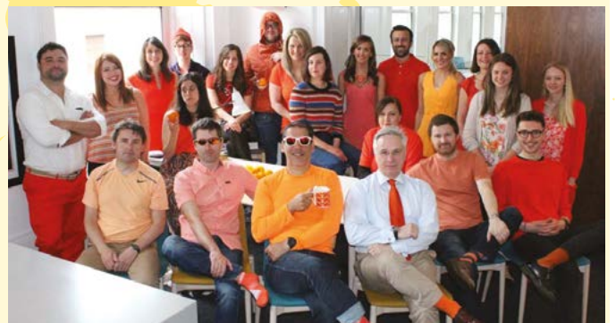
Threesixty Looking Good!

group (including some of our residents!) climbed Conic Hill in Balmaha. And to finish a colourful week off, Threesixty held a delicious 'Back to Black' breakfast at their offices for all those involved. What a week it was, and we hope that everyone enjoyed it as much as we did! And of course, thank you very much to all at Threesixty for your amazing efforts!