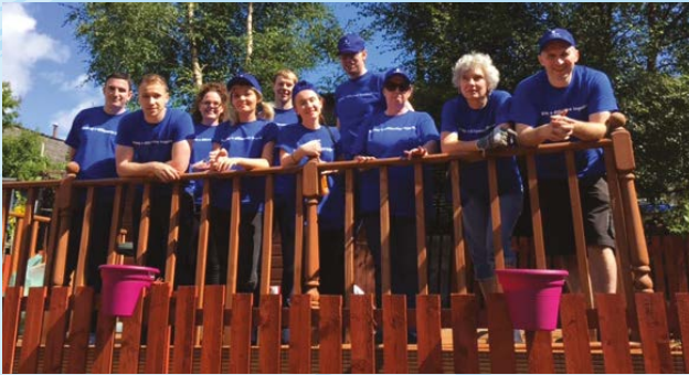
Zurich certainly got the weather!

painted our decking, carried out weeding and filled our tyres up with compost - thank you so much again and we hope to welcome you back soon!