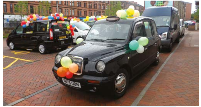
The taxis are ready to go!

The children, young people and their support workers had yet another fun filled day out thanks to the Glasgow Taxi Outing Fund in June. The taxis, kitted out in balloons and ribbons, took the young people to Troon for the day where