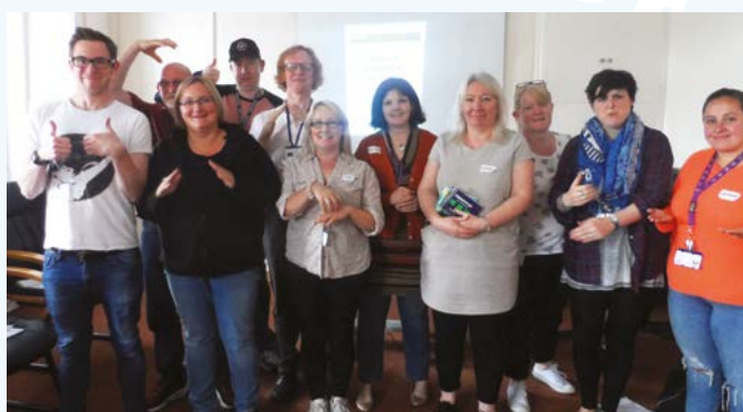
Staff pose their favourite Makaton sign

East Park has gratefully received financial support from a number of supporters to train its staff in the use of Makaton. Makaton is a language programme using signs and symbols to help people to communicate. Staff will be trained in the use of Makaton, enhancing their communication skills with the children and young people, as well as providing them with the knowledge and skills to share and train fellow staff members in using Makaton within East Park.