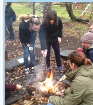
Learning to cook on an open fire

Each Wednesday afternoon pupils from classes across the school work together at the Children's Wood. Last term pupils were learning outdoors about fire safety, how to build and extinguish a fire, and how to cook on an open fire. Pupils have enjoyed toasting