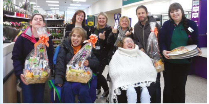
Thank You Morrisons!

At the end of last year, a group of young people from Workmates were lucky enough to be invited to the supermarket, Morrisons, in Partick, where they were given the chance to be involved in taster sessions, have a go on the checkouts and were able to explore the different areas of the store. The staff at Morrisons greeted the young people with a lovely warm welcome to the store and they were shown to their first station - fruits from around the world. Here, the young people were told about each fruit, where it comes from and had the option to try some if they liked. The group then moved on to the pizza area - a favourite amongst the young people as they had the opportunity to make their own pizza to take