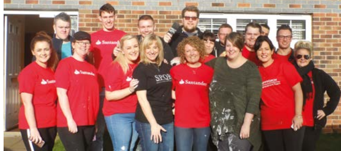
Santander volunteered in November!

At end of 2017 we were lucky enough to have corporate and community volunteers come in to East Park to help maintain and freshen up some areas around our community houses.