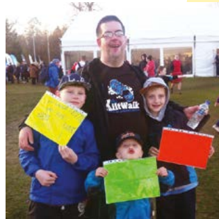
What a feeling!

The Kiltwalk is a well-established event which people can choose to walk a certain distance for a Scottish Charity of their choice