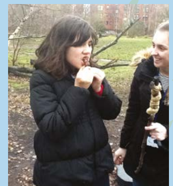
Enjoying the fruits of their labour!

marshmallows and baking bread from delicious dough donated to us by 'The Bakery - by Zique'. Pupils have been safely using tools to whittle sticks to cook with. Everyone has really enjoyed these exciting opportunities and has managed brilliantly while learning new skills.