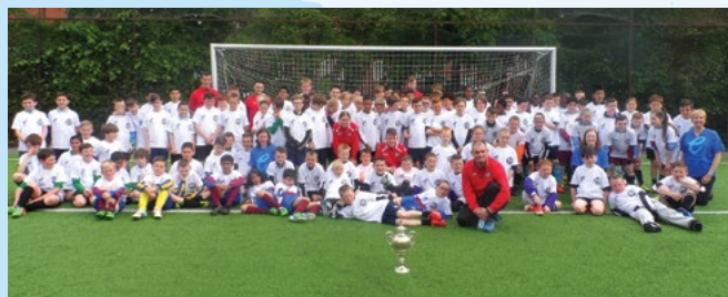
The East Park Maryhill Commonwealth Tournament

alongside a specialist theatre maker to create the adventure using sensory theatre techniques and simple role-play. The children have dressed-up, explored tastes, heard sounds and sung songs. The Celebrate Day has also been an opportunity for the