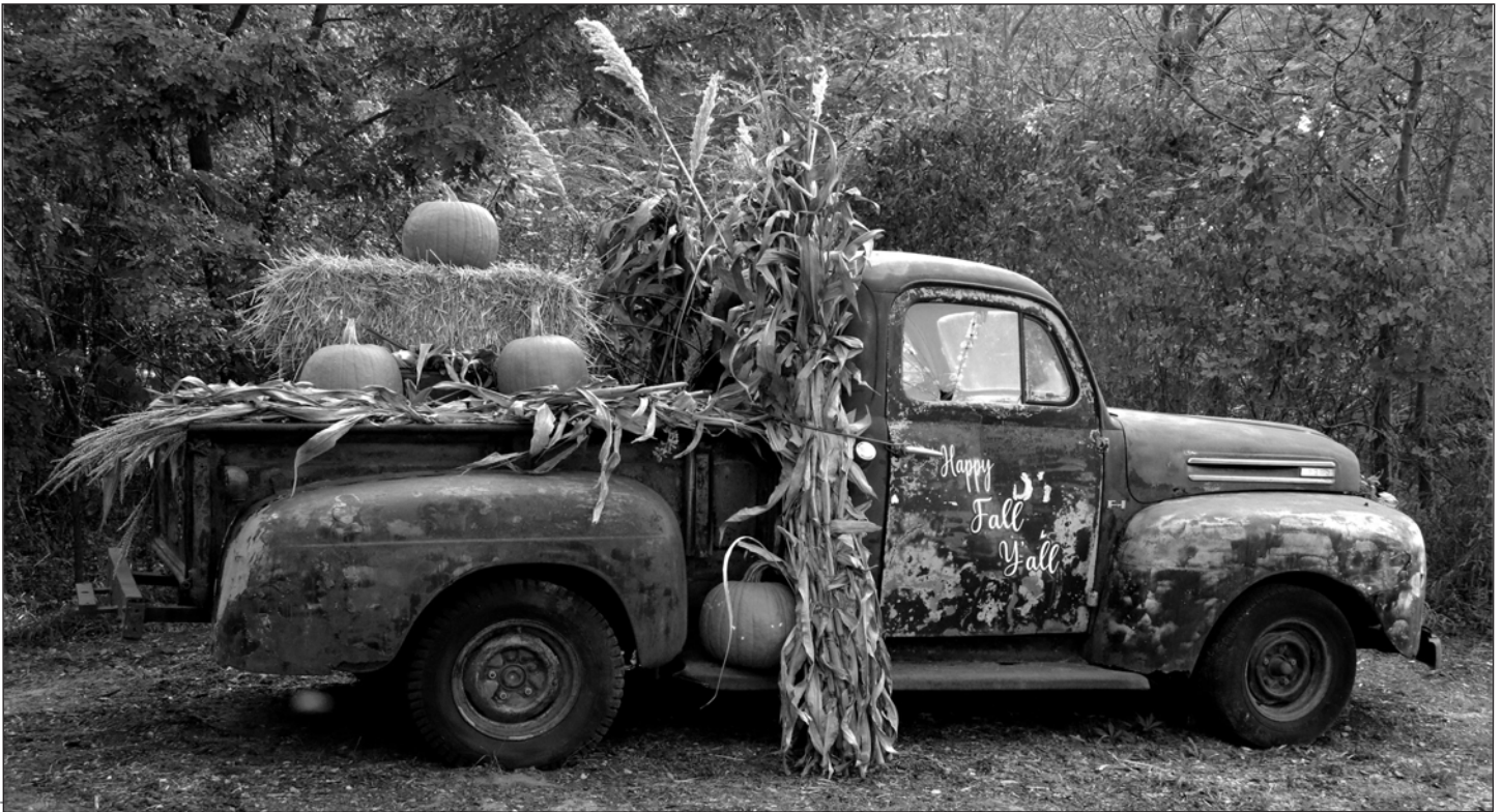
Photo of the Month: An old truck is dressed for fall on Fenton Road.