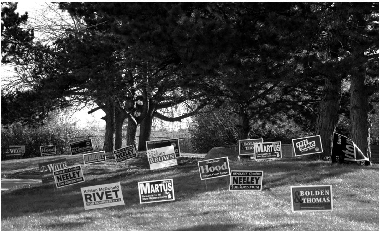
Candidate signs outside of UAW 651 on Longway Boulevard.

So, while I can't be sure what it means that America has chosen Trump, there are some explanations for his victory. As for what happens next, with a Republican Senate, a possible Republican House, a Supreme Court with Trump appointed justices, and Project 2025, there will be much to watch. ●