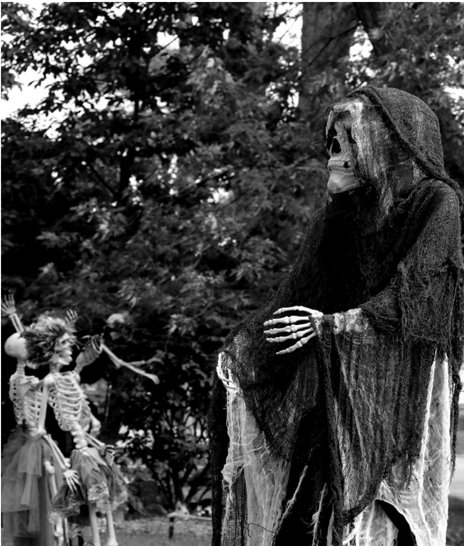
Halloween on Calumet Street