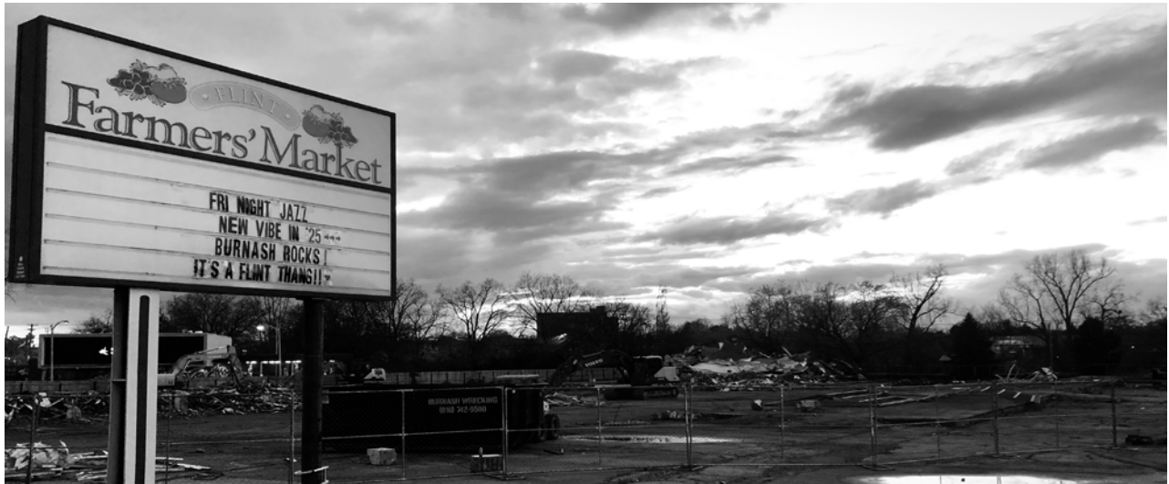
The demolition of the former Flint Farmers' Market is underway at 420 E. Boulevard.

That plan describes city corridors as situated to "leverage the economic potential of traffic and help minimize land use incompatibilities by containing a variety of uses in manageable areas of the City." City corridors, according to