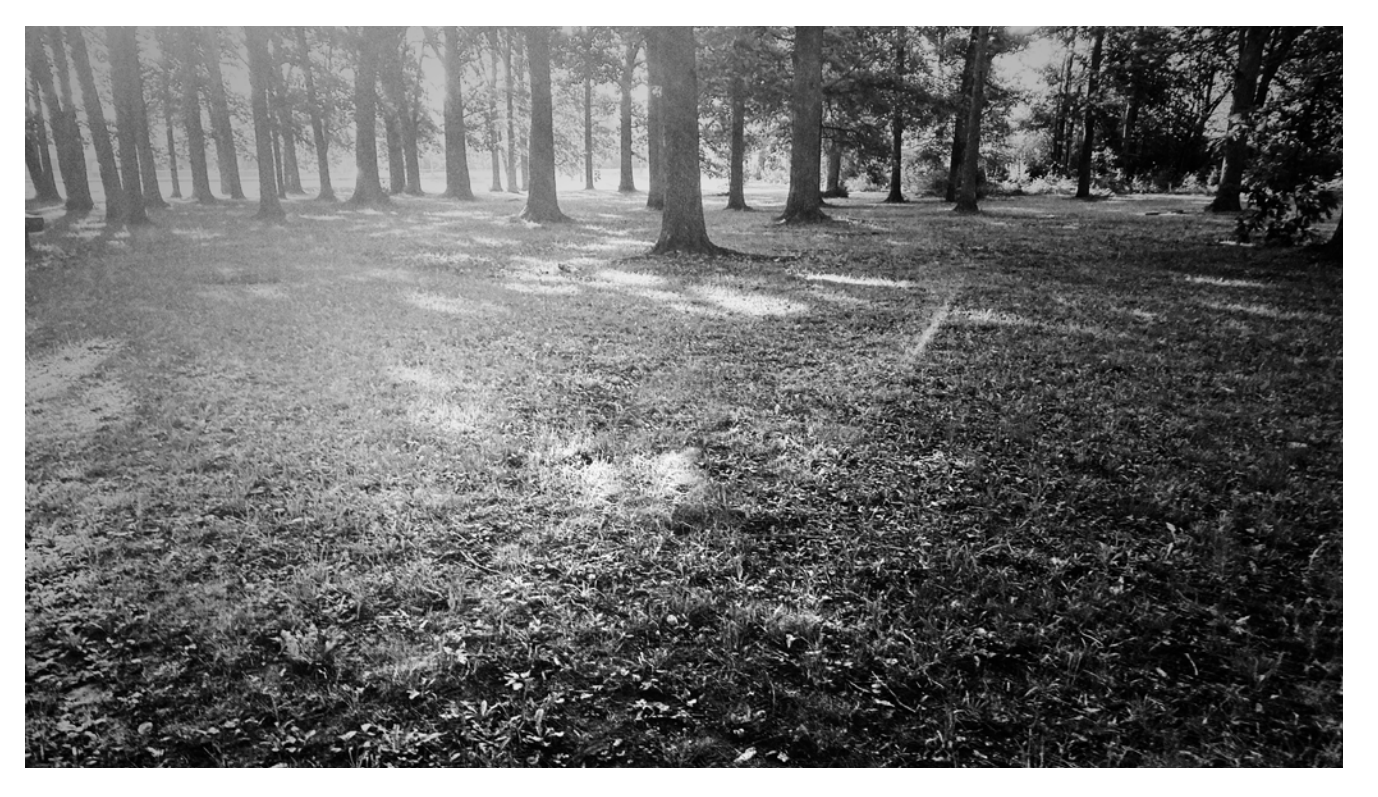
A clearing encountered during a walk in Max Brandon Park.