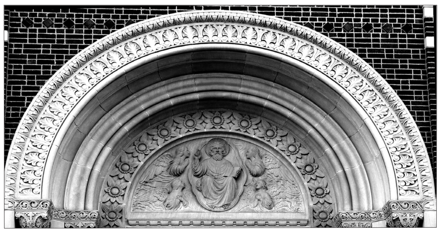
Photo of the Month: The arched entry to St. Matthew's Church on Beach Street.