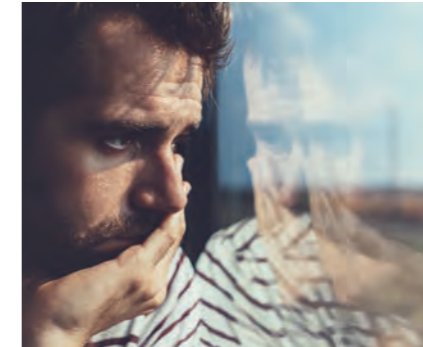
Usually for one person the loss cycle begins, there are 5 stages;

Coming to terms with losing someone who you thought you would be with forever, is one of the most difficult journeys a parent can take.