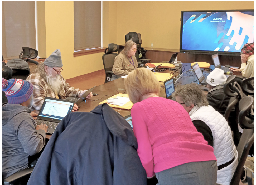
The first digital literacy class successfully completes the program.

To learn more about the Digital Literacy Classes and the Education & Employment program, please email: jamesb@eecm.org .