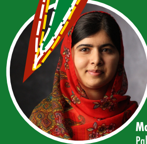
Malala Yousafzai Pakistani activist for female education and the youngest Nobel Prize laureate.