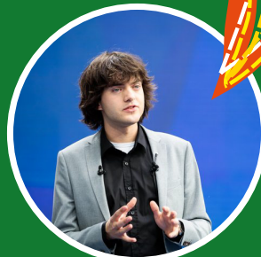
Boyan Slat Dutch inventor, entrepreneur and aerospace engineering student drop-out who is the CEO of The Ocean Cleanup.