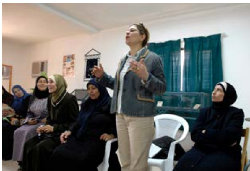
Women gather for a meeting at Wadi Mousa, Jordan.

Rural and indigenous women have proven their capacities to play a major role in rural development. For example, in Latin America, they have, through diverse forms of organization, developed strategies for building the resistance to the exploitation of natural resources in their territories, which could