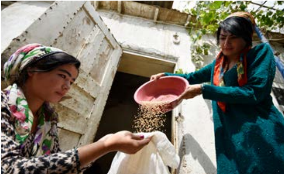
Women groups in Tajikistan received support in agriculture through a project focusing on “Strengthening Institutions and Capacity of the Ministry of Agriculture and State Veterinary Inspection Service for Policy Formulation”.

In addition to the above-mentioned policy blueprints, many good practices exist – some mentioned in this paper – from which governments and other development actors can learn in order to build effective interventions to promote and guarantee rural women’s rights, strengthen their voice and leadership, improve their livelihoods and thus enhance overall well-being of their families and communities. Improved data collection and analysis are needed over longer periods of time to assess the impacts of policy choices on rural women and their families and communities, and to compare the merits and demerits of different interventions.