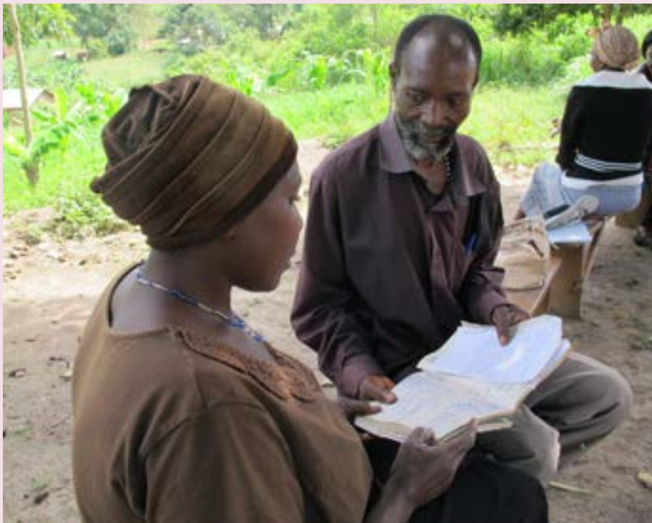
Participants in household mentoring in Uganda.

Expanding use of HHM has potential to reduce existing gender imbalances in food and nutrition security. HHM intervene directly in intra-household gender relations to strengthen smallholders' agency and efficacy as economic agents and development actors. Strengthening women's agency is a key mechanism for progressing towards collaborative, systemic farm management. This contributes to improved farm resilience in the face of climate change, strengthens food and nutrition security, and improves other development indicators.