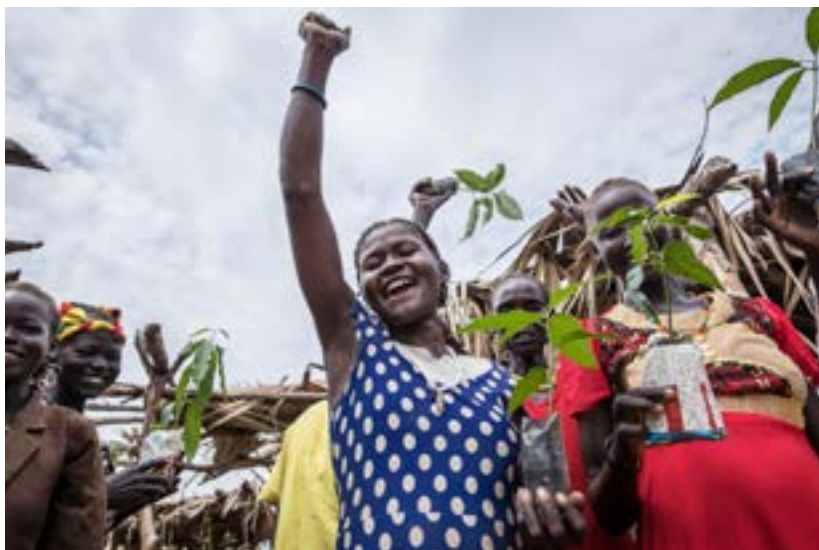
South Sudan, Kuac South, Warrap State. Rural women and girls, critical agents of change.

Significant gender gaps persist in rural labour markets because of gender-based discrimination. While women's participation in rural labour markets shows much heterogeneity at the regional level, women are generally over-represented in unpaid, seasonal and part-time work and often receive lower wages than men for the same work. Furthermore, rural women face massive constraints that limit their access to productive resources, credit, market information and skills enhancement opportunities and their ability to make decisions and seize emerging employment and entrepreneurial opportunities. This not only holds back rural women's employment, undermining their economic and social well-being, it also hinders the economic growth of rural communities and their capacity to contribute to agricultural production and food security.