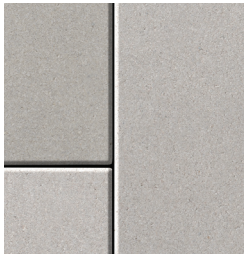
50% | Premier Opal