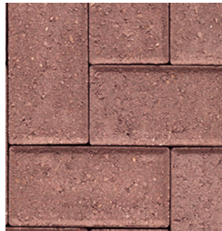
25% | Premier Red