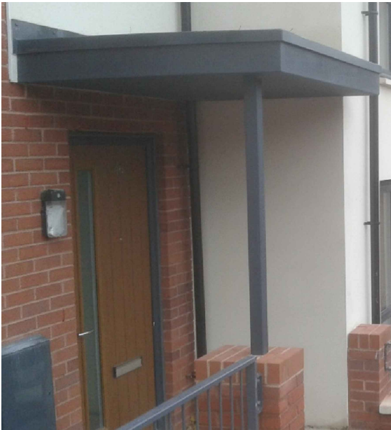
Post built into brickwork