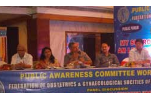
FERENTION OF OBSTETRICS & GYNAECOLOGICAL SOCITIES MANEL DIACOUSTON MV SURROUNDING, MV ISNURONMENT - AM SECONDA B CHAINPENSON I OR DUBCA SHANNAR DAM