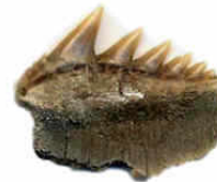
Notorynchus cepedianus (Sevengill Cow Shark)