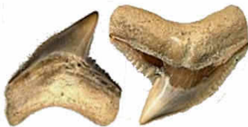
Galeocerdo cuvier (Tiger Shark)