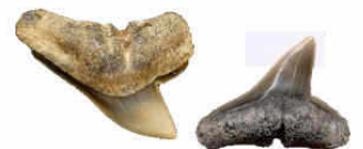
Sphyrna sp. (Hammerhead Shark)