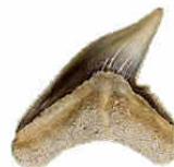
Physogaleus contortus (Tiger-like Shark)