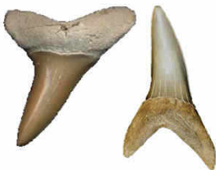
Isurus oxyrinchus (Mako Shark)