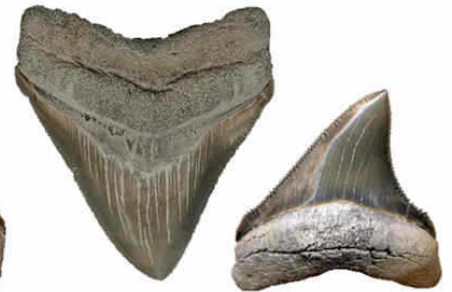
Carcharocles subauriculatus (Megatooth Shark)