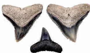
Carcharhinus sp. (Requiem Shark)