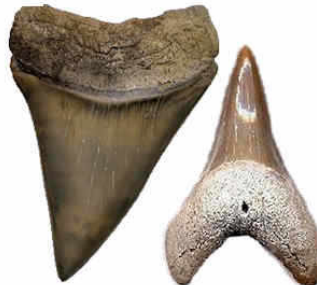
Carcharodon plicatilis (Giant White Shark)