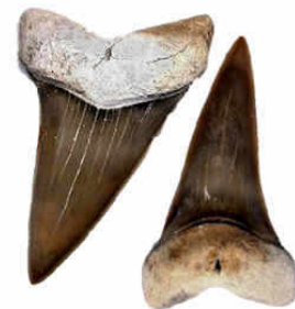
Carcharodon hastalis (Narrow White Shark)