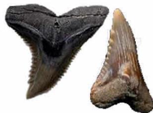
Hemipristis serra (Snaggletooth Shark)