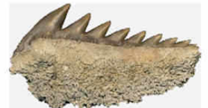
Hexanchus griseus (Sixgill Cow Shark)