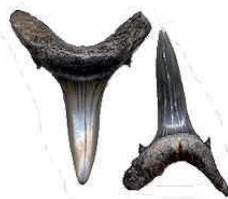
Carcharias sp. (Sand Tiger Shark)