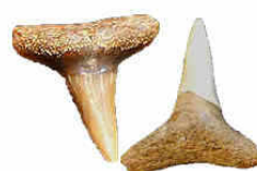
Negaprion sp. (Lemon Shark)