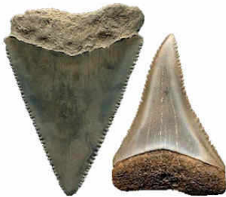
Carcharodon carcharias (Great White Shark)