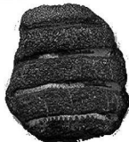
Myliobatis sp Ray crushing plate