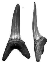
Carcharias hopei Sand Tiger Shark