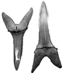
Striatolamia striata Sand Tiger Shark