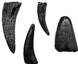
Thecachampsia sp. Crocodile Teeth