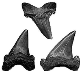
Otodus obliquus Giant Mackerel Shark