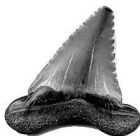
Paleocarcharodon orientalis Pygmy White Shark