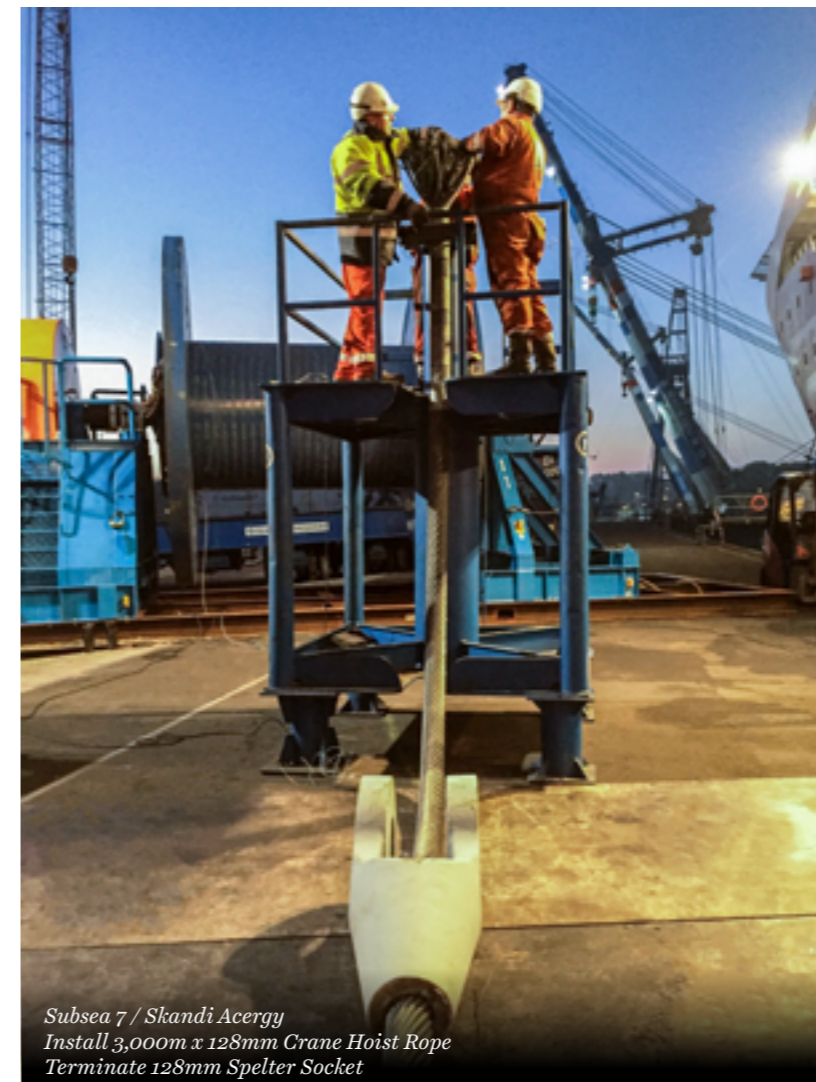
Subsea 7 / Skandi Acergy Install 3,000m x 128mm Crane Hoist Rope Terminate 128mm Spelter Socket