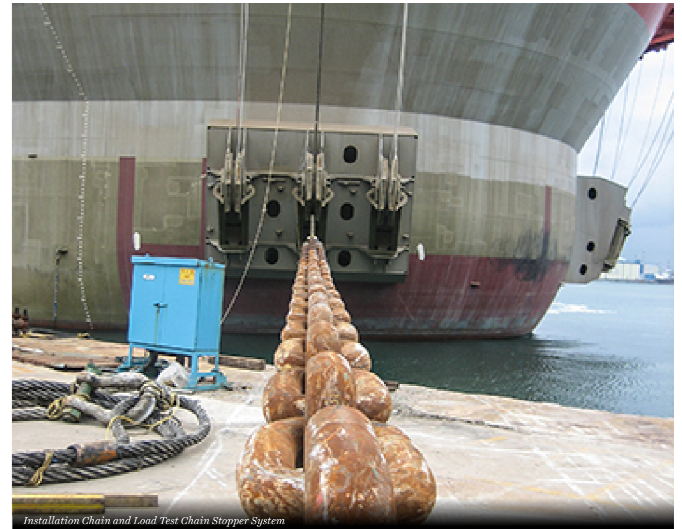
Installation Chain and Load Test Chain Stopper System

Our chain installation services include the provision of detailed reports and multi-media supporting files.