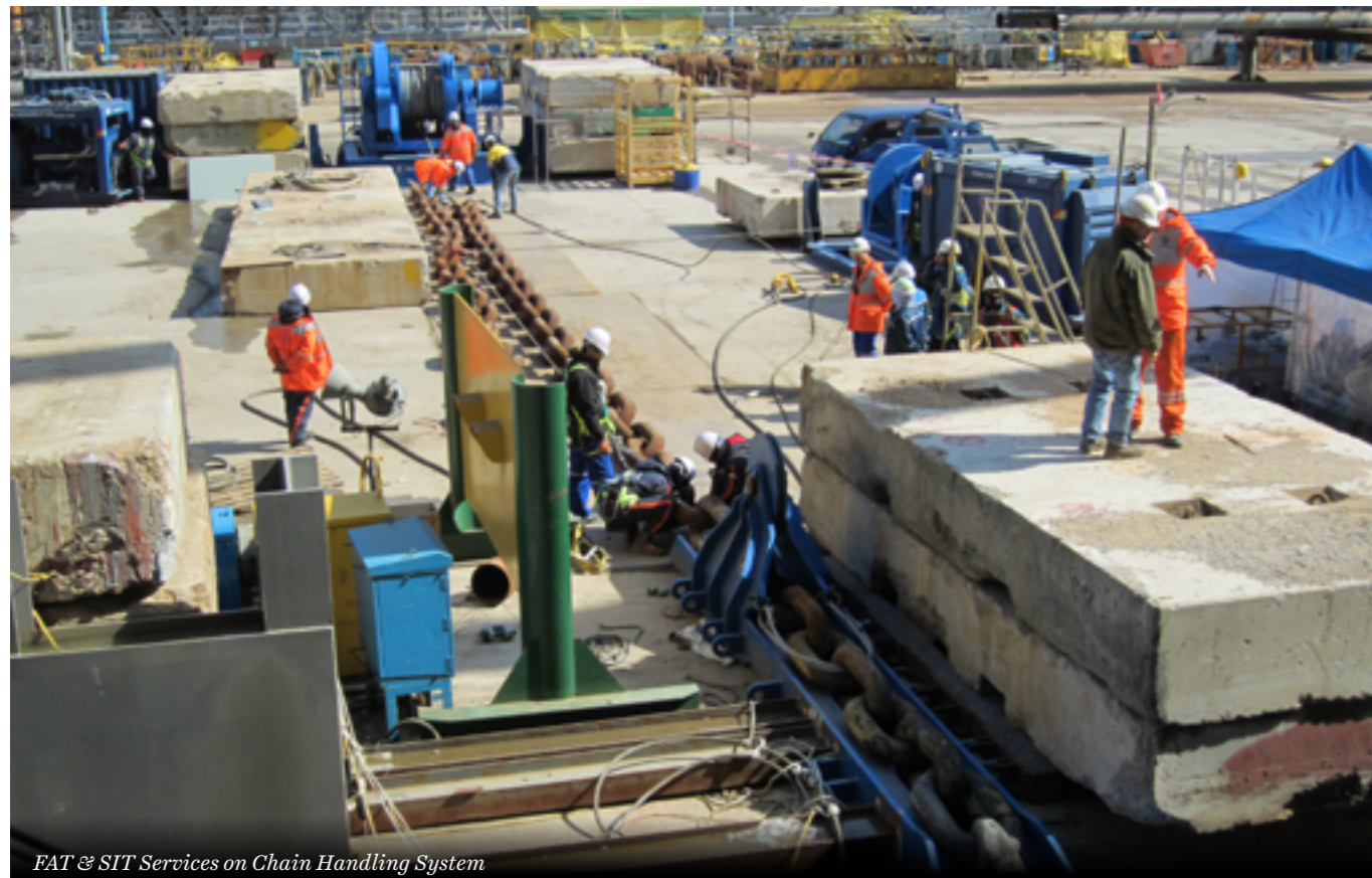
FAT & SIT Services on Chain Handling System

To support the work during equipment procurement and preparations, FATs, SITs and offshore execution