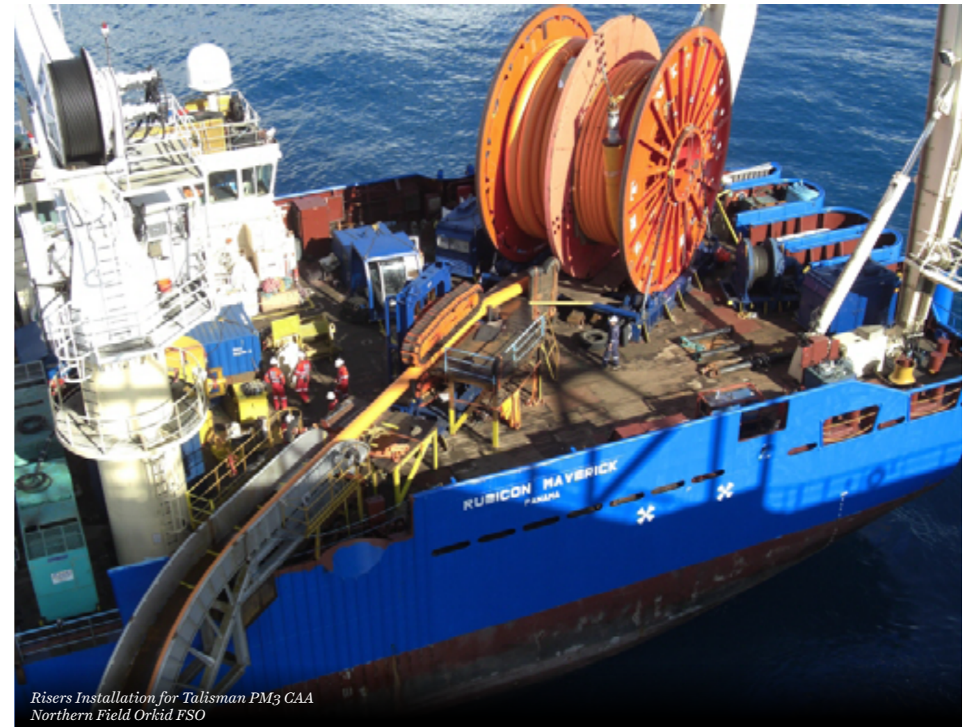
Risers Installation for Talisman PM3 CAA Northern Field Orkid FSO