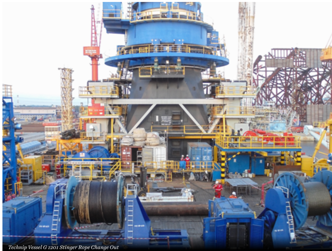
Technip Vessel G 1201 Stinger Rope Change Out

Experienced offshore spooling crews accompany our offshore spooling machines to ensure that the installation and removal of steel wire ropes are always conducted in a manner that enhances safety and reduces the potential for rope damage.