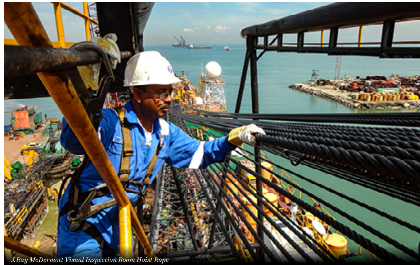
J.Ray McDermott Visual Inspection Boom Hoist Rope