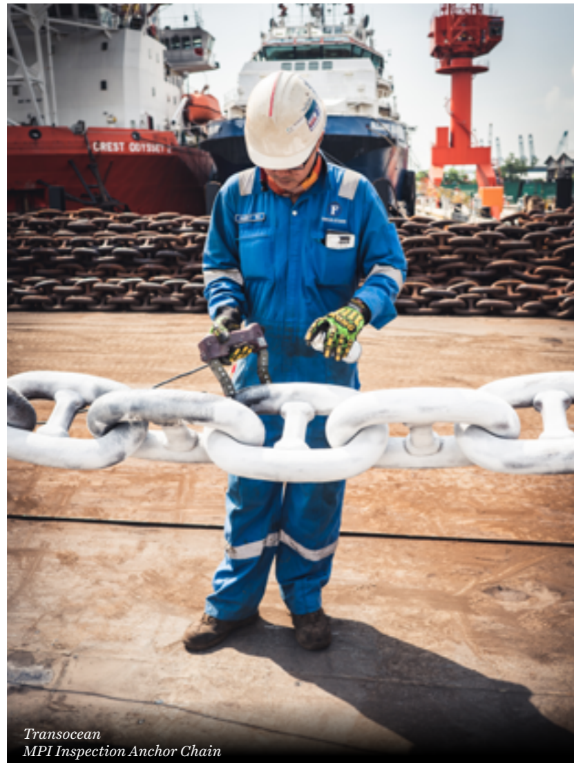
Transocean MPI Inspection Anchor Chain

Our equipment and stud press unit for anchor chain refurbishment can be set up for chain inspection both onshore and offshore. The stud press unit is certified for lifting and offshore use. When offshore, we can work from a AHV deck or a suitable flat top barge.