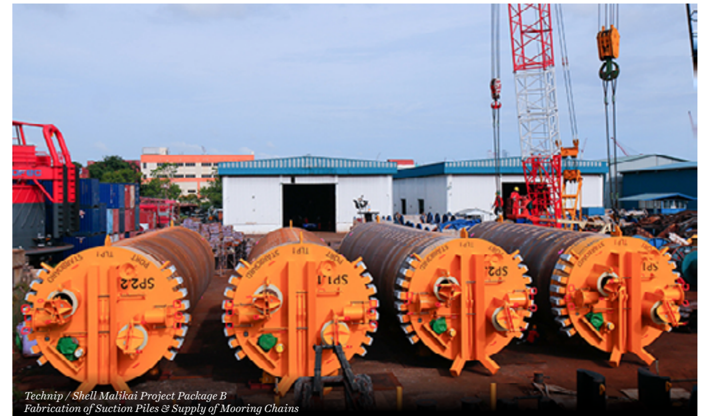
Technip / Shell Malikai Project Package B Fabrication of Suction Piles & Supply of Mooring Chains