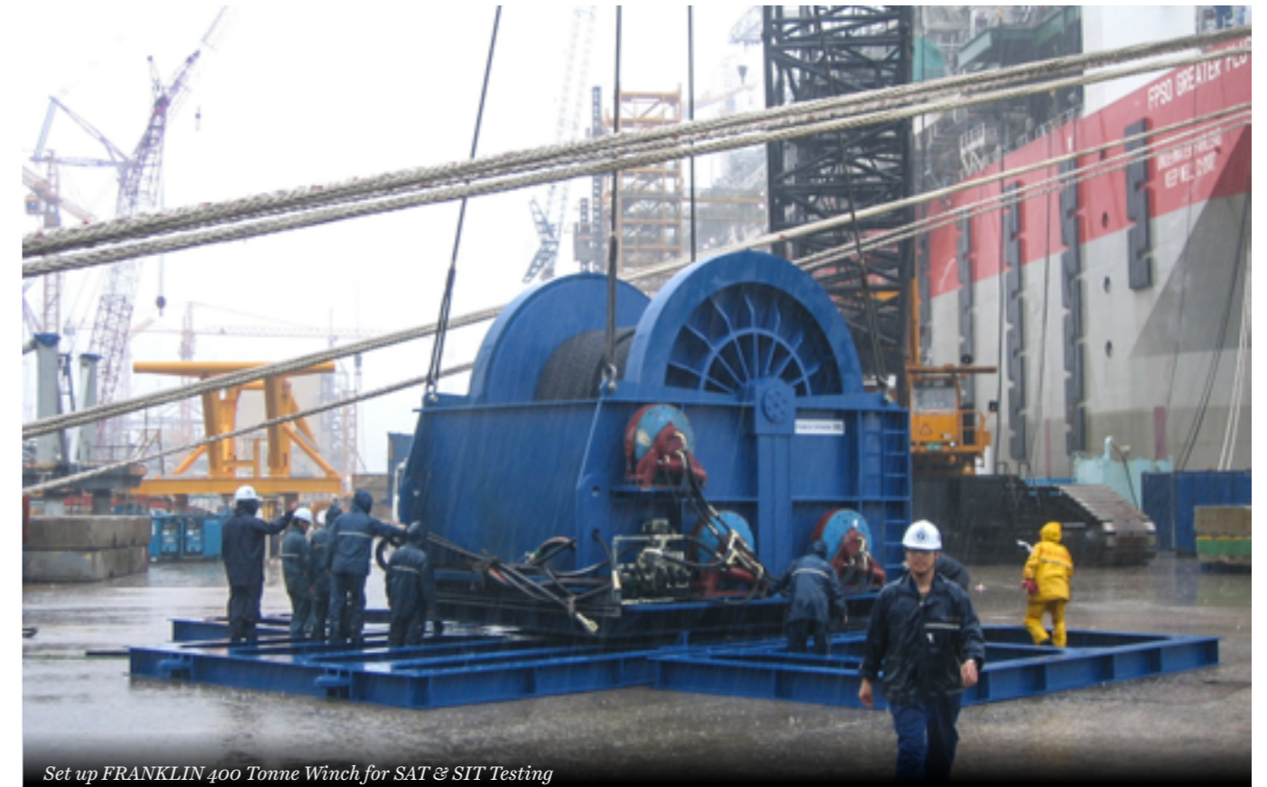
Set up FRANKLIN 400 Tonne Winch for SAT & SIT Testing