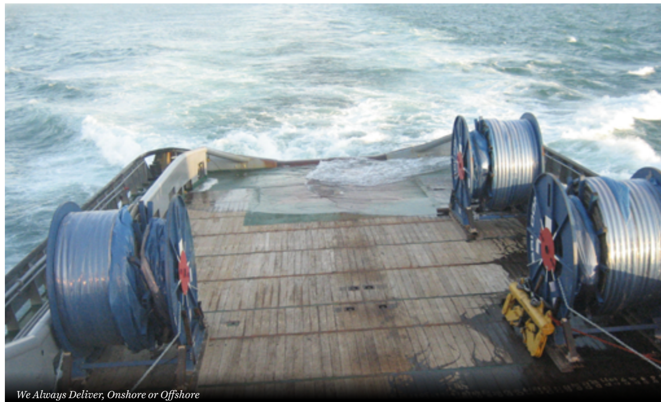
We Always Deliver, Onshore or Offshore