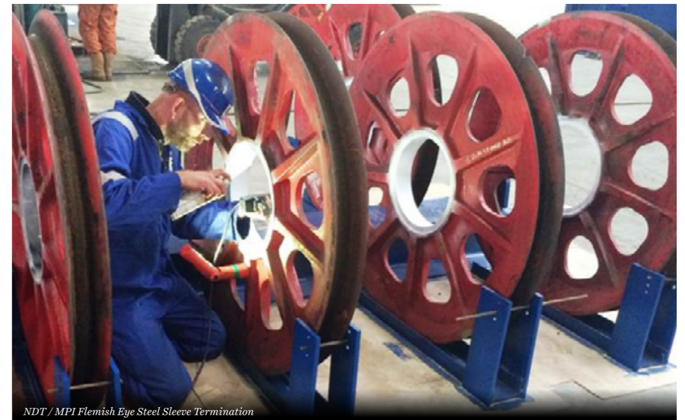
NDT / MPI Flemish Eye Steel Sleeve Termination

We are a full member of Lifting Equipment Engineers Association ( LEEA ) and our staff members are trained to international standards. This ensures compliance and competence in carrying out inspections and lifting equipment certification.