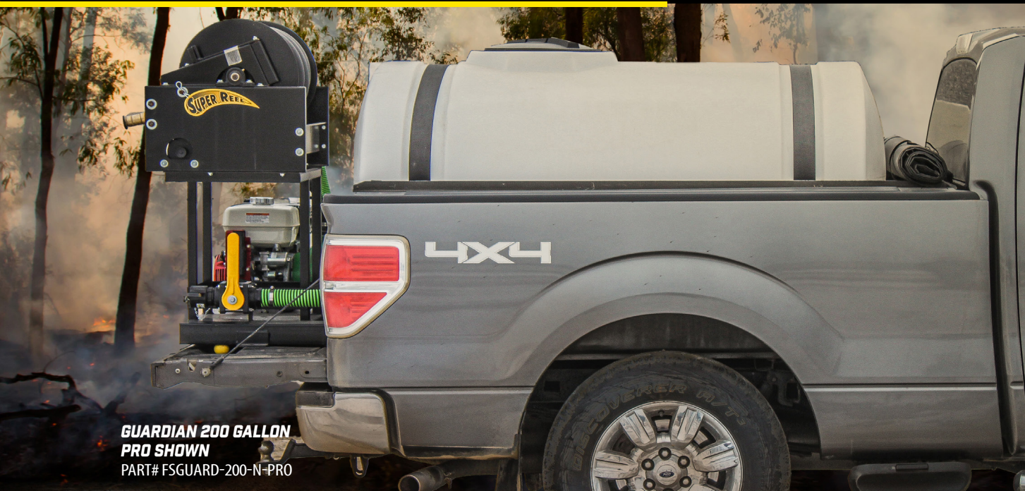
GUARDIAN 200 GALLON PRO SHOWN PART# FSGUARD-200-N-PRO