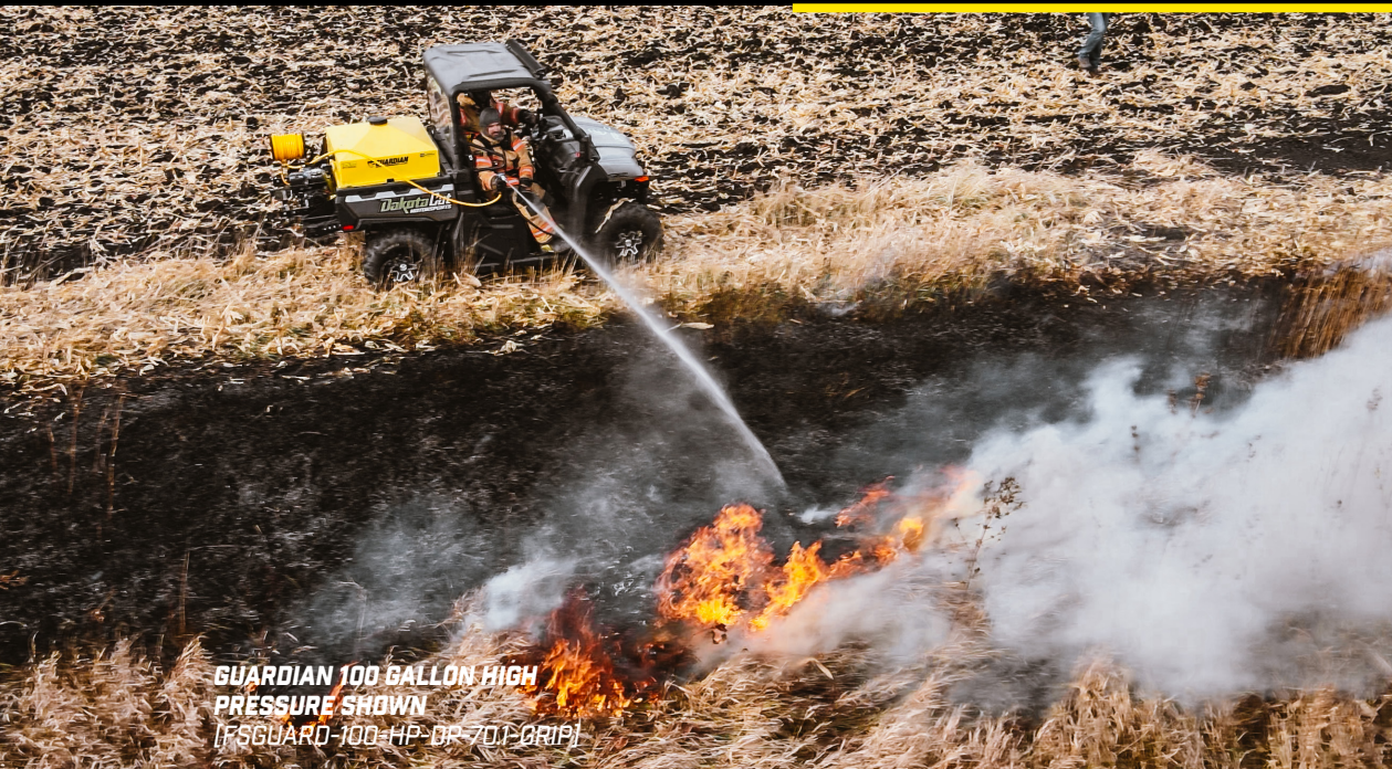
GUARDIAN 100 GALLON HIGH PRESSURE SHOWN (FSGUARD-100-HP-DP-70.1-GRIP)