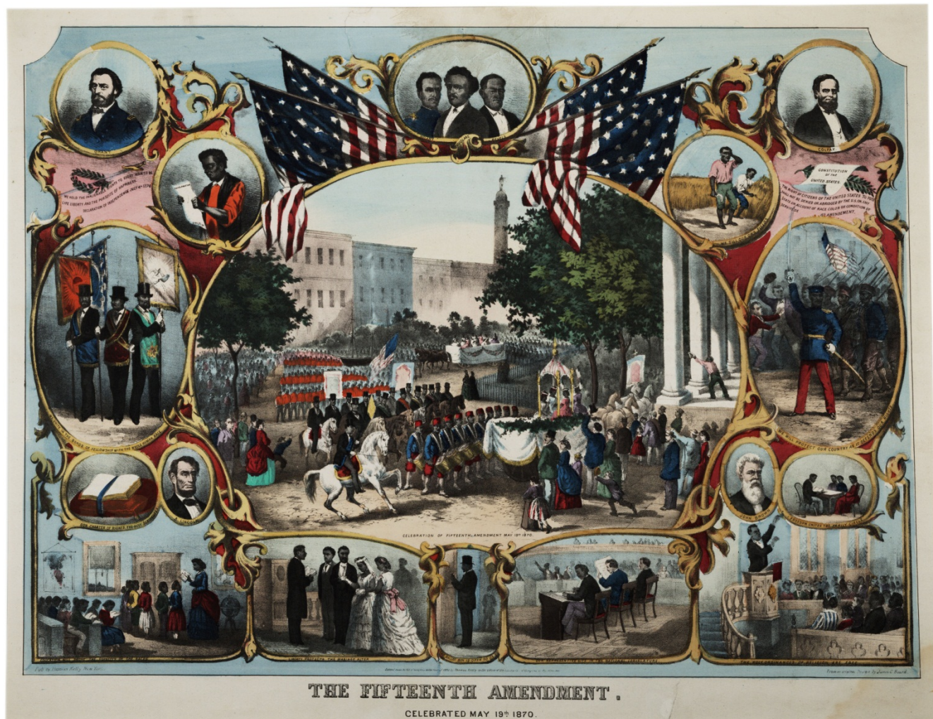
“The fifteenth amendment celebrated May 19th 1870,” print, 1870 (Private Collection)