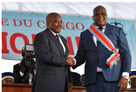
DRC's outgoing President Kabila shakes hands with newly inaugurated President Tshisekedi on 24 January 2019. Kabila has retained influence over many of DRC's institutions.