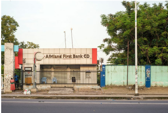
A branch of Afriland First Bank in Kinshasa. After Gertler's designation under US sanctions, Afriland DRC's profit increased by 350%.

As a result, 2018 was a very good year for Afriland. The bank's profits increased nearly 350% in a year.