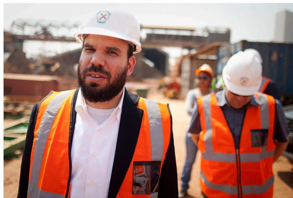
Dan Gertler tours a mining site in DRC in 2012. Despite being sanctioned since 2017, the Israeli billionaire has not changed his ways.

Competent authorities in other relevant jurisdictions, including but not restricted to DRC, Israel and Switzerland, must take steps to investigate and – where evidence of wrongdoing is found – prosecute the individuals and companies involved in the suspect natural resource deals involving Dan Gertler in DRC. Sanctions regimes that have not already done so