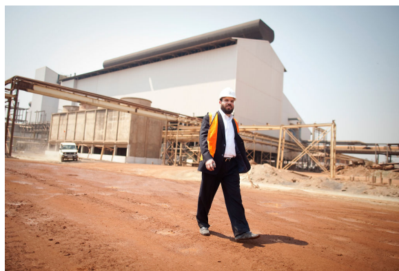
Dan Gertler was sanctioned by the US for “corrupt mining and oil deals” in DRC.

In June 2018, the US added another 14 entities affiliated with Gertler to its sanctions list. The Treasury Department said that these companies have “enabled Dan Gertler to access the international financial system and profit from corruption and misconduct”. 26 Following this second round of designations, a total of 34 individuals and entities connected to Gertler, including Gertler himself, had been sanctioned under the Global Magnitsky Act. 27 Following a March 2020 OFAC revision, one of these companies was removed from the sanctions list. 28