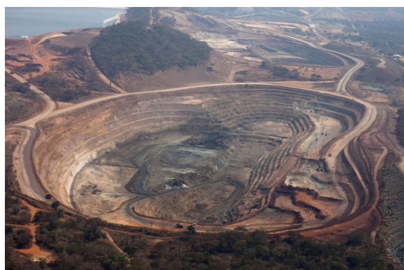
Gertler continues to earn huge royalties from Glencore's vast Mutanda copper and cobalt mine in DRC, despite being sanctioned.

Royalty payments had always been made by Glencore's Congolese subsidiaries in US dollars. Gertler's designation as a sanctioned individual in December 2017 was a huge challenge for Glencore: would it cease payments to its most