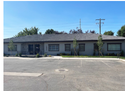
BOISE 1921 E Overland Road Meridian, ID 83642 Phone: (208) 576-6646