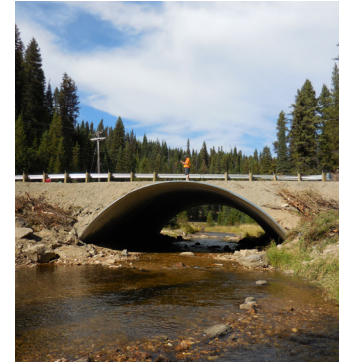
▲ American River Aquatic Organism Passage Culvert