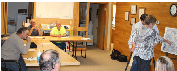
▲ Great West Led Community Planning Session

Scan to learn more about our planning capabilities.