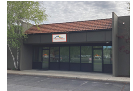
SPOKANE 10220 N. Nevada St., Suite 130 Spokane, WA 99218 Phone: (509) 413-1430