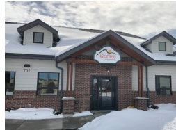
GREAT FALLS 702 2nd Street South, Suite 2 Great Falls, MT 59405 Phone: (406) 952-1109