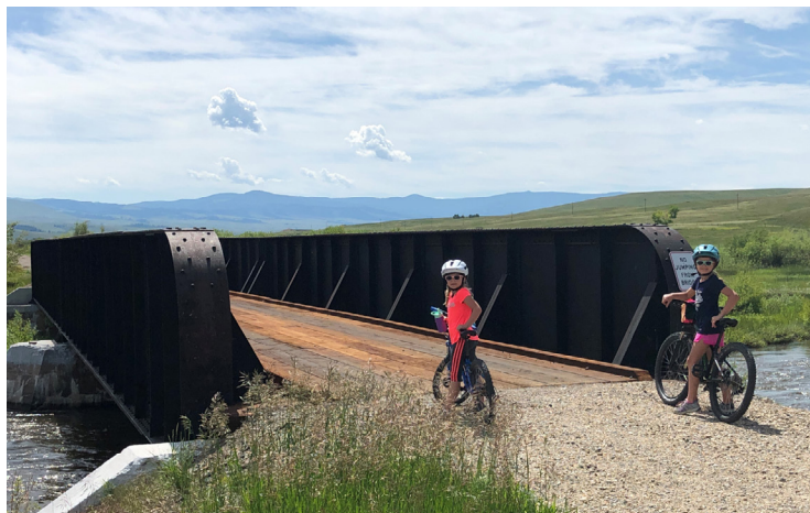
▲ Employee Family Members Take the First Ride on the Old Yellowstone Trail Project