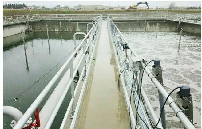
▲ ICEAS Mechanical Wastewater Treatment Plant | City of Glendive

Scan to learn more about our wastewater capabilities.