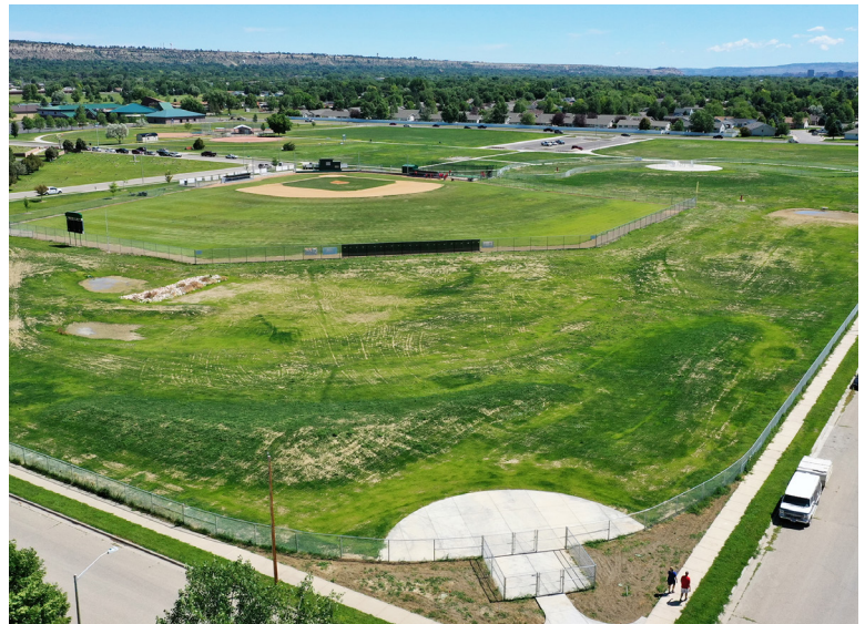
▲ Centennial Park | Billings