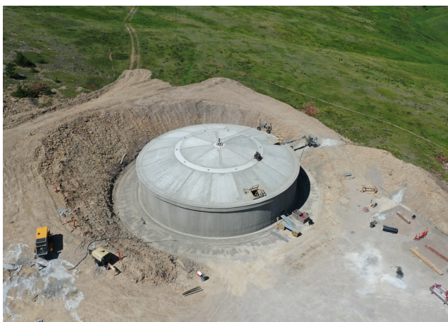
▲ Storage Tank Construction For Musselshell Judith Rural Water System, 230 Mile System Delivering Water to Seven Communities

Scan to learn more about our water capabilities.