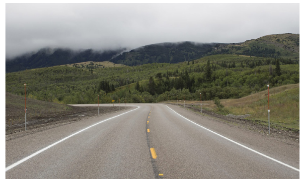
▲ Kiowa Jct N&S and N of Kiowa N | Montana Department of Transportation

Scan to learn more about our transportation capabilities.