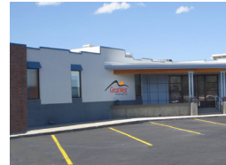
HELENA 2501 Belt View Drive Helena, MT 59601 Phone: (406) 449-8627 Fax: (406) 449-8631