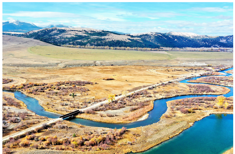
▲ Old Yellowstone Trail, Part of Rails to Trails System Spanning East to West of United States | Powell County

Scan to learn more about our parks and trails capabilities.