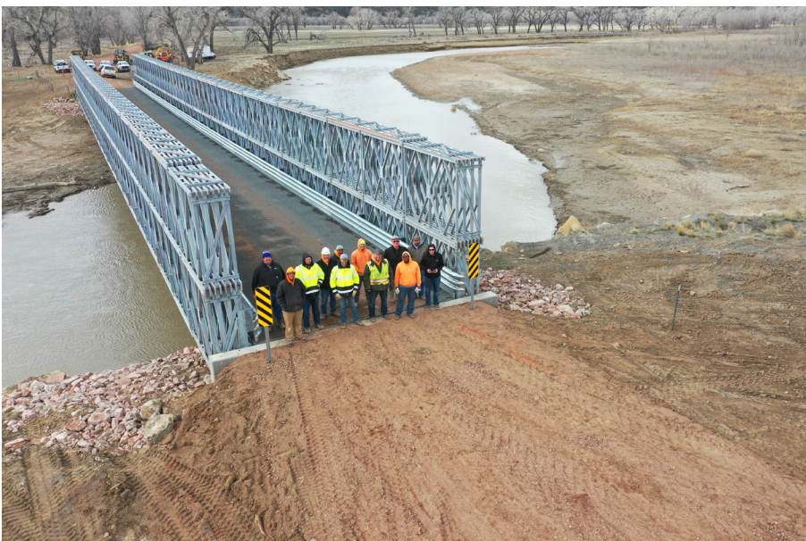
▲ EDA Funded Moorehead Bridge | Powder River County