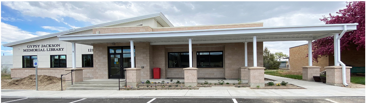
▲ Gypsy Jackson Memorial Library, City of Homedale | CDBG/Rural Envelopment Funding and Administration

In addition to helping clients apply for funding, we have spent a tremendous amount of internal resources and training to ensure our staff can assist clients with grant administration. Grant administration includes accountability for grant compliance and use of grant funds, compiling draw requests to disburse funds, compliance auditing, labor compliance, and project closeout. From project conception to project closeout Great West can provide project funding expertise to communities of all sizes.