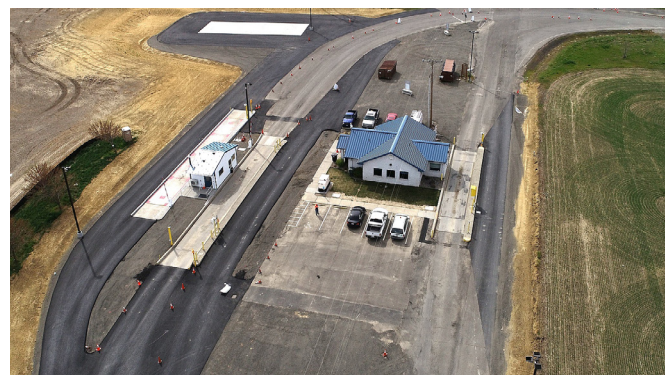
▲ New Scalehouse and Entrance Improvements | City of Walla Walla