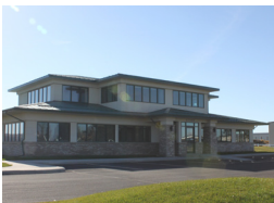
BILLINGS 6780 Trade Center Ave. Billings, MT 59101 Phone: (406) 652-5000

▶ www.greatwesteng.com See what's possible.