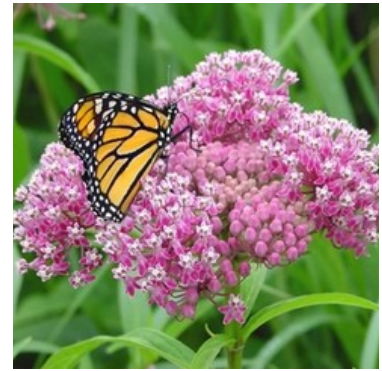
Swamp Milkweed Asclepias incarnata