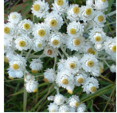
Pearly Everlasting Anaphalis margaritacea