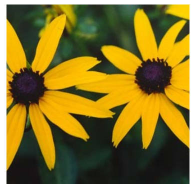
Black-eyed Susan Rudbeckia fulgida