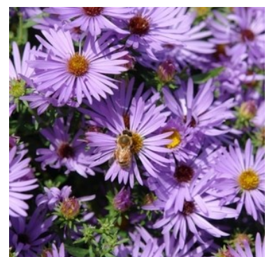
Asters Aster or Symphyotrichum spp.