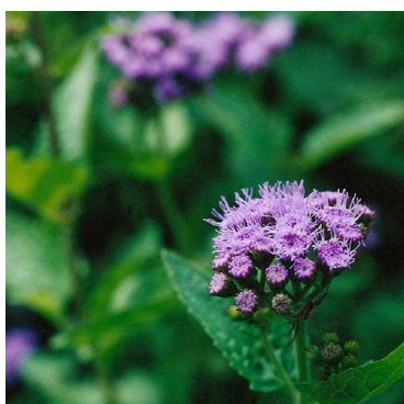
Blue Mistflower Conoclinium coelestinum