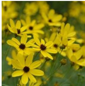
Tickseed Coreopsis tripteris