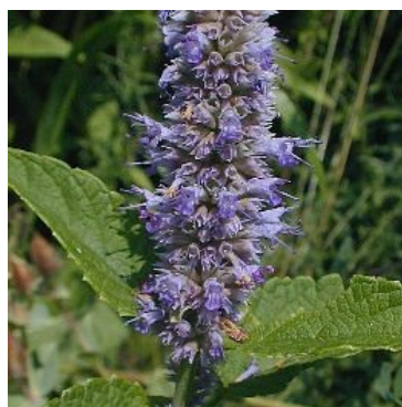
Anise Hyssop Agastache foeniculum