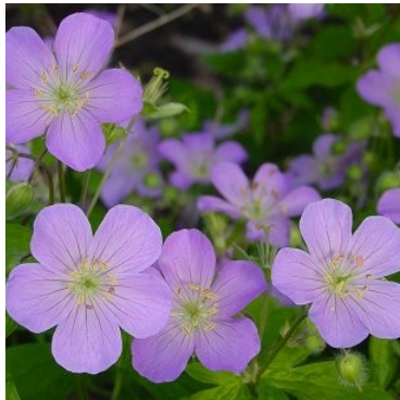
Wild Geranium Geranium maculatum