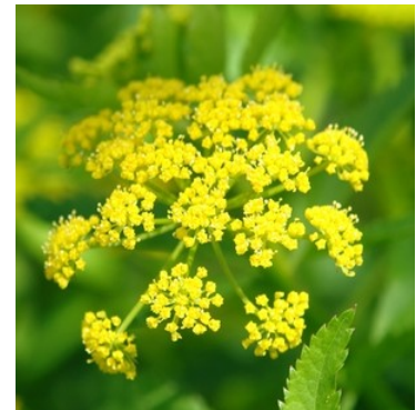
Golden Alexanders Zizia aurea