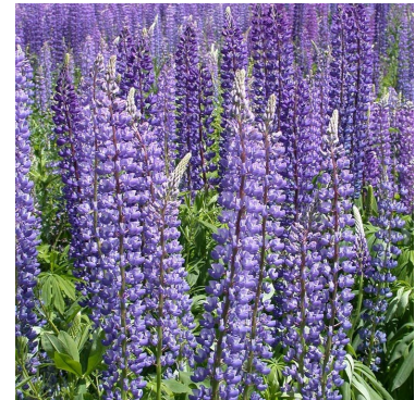
Sundial Lupine Lupinus perennis