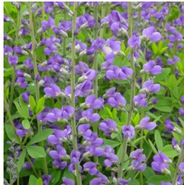
False Blue Indigo Baptisia australis