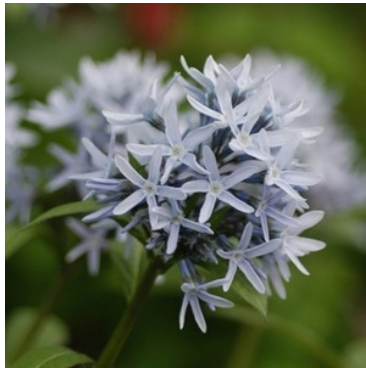
Eastern Bluestar Amsonia tabernaemontana