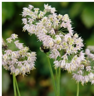
Nodding Onion Allium cernuum