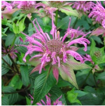
Wild Bergamot Monarda fistulosa