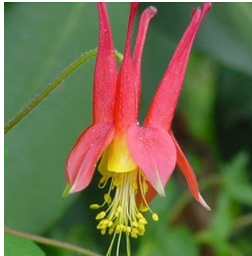
Wild Columbine Aquilegia canadensis