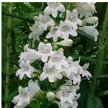
Beardtongue Penstemon digitalis