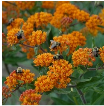
Butterfly Milkweed Asclepias tuberosa