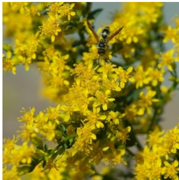
Goldenrods Solidago spp.