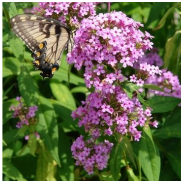
Garden Phlox Phlox paniculata