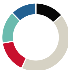
Votes against management by topic (%)**