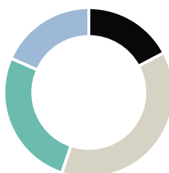
Votes against management by topic (%)**